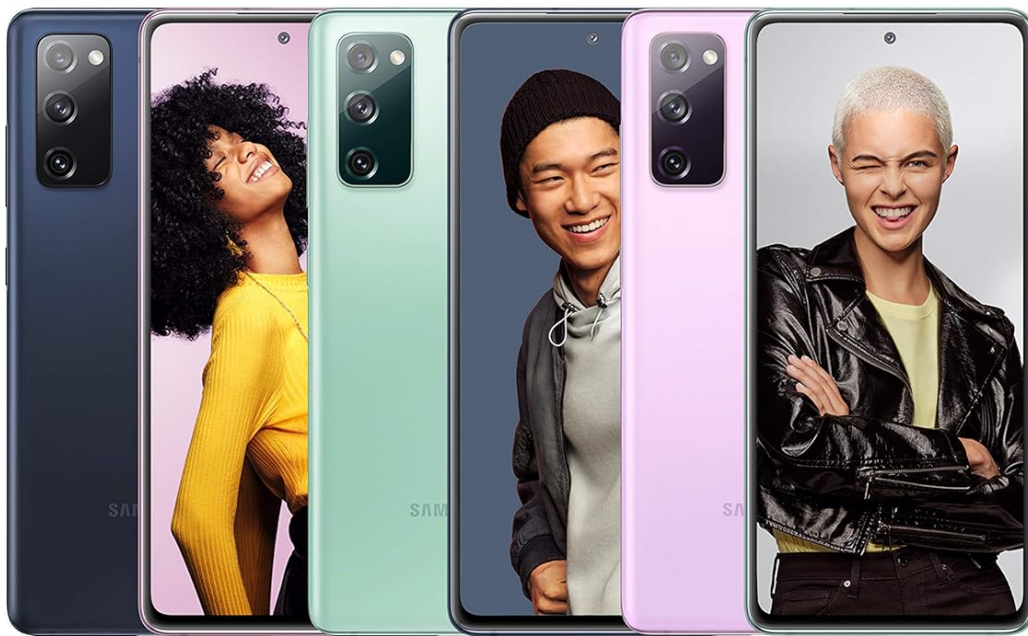
Image: Multiple Samsung Galaxy S20 FE 5G phones showcasing the 120Hz Super Smooth Display and various on-trend color options.