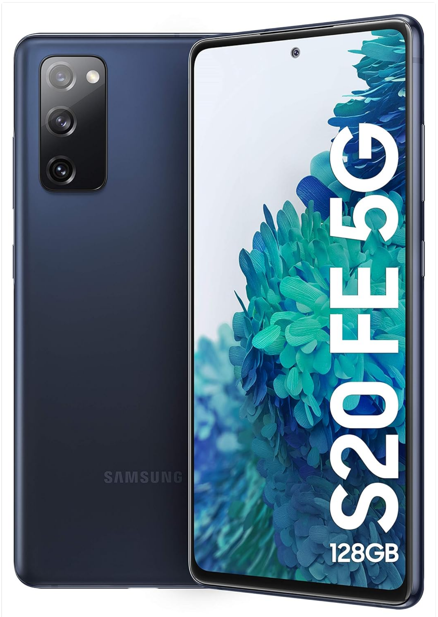
Image: Front and rear view of the Samsung Galaxy S20 FE 5G in Cloud Navy. The device features a triple camera setup on the rear and a punch-hole display on the front.