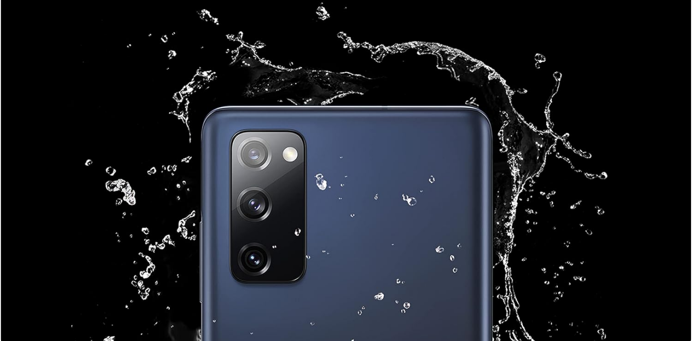
Image: A close-up of the rear camera module of the Samsung Galaxy S20 FE 5G with water splashing around it, illustrating its IP68 dust and water protection rating.