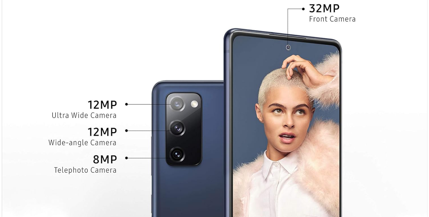
Image: Detailed breakdown of the Samsung Galaxy S20 FE 5G's camera system, showing the 12MP Ultra Wide, 12MP Wide-angle, 8MP Telephoto rear cameras, and the 32MP Front Camera.