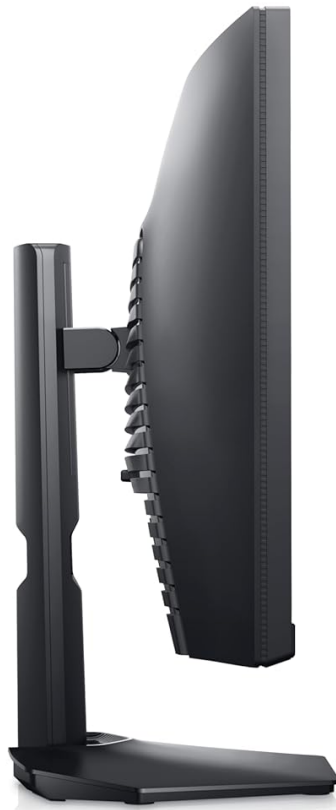
Image: Side view of the Dell S2422HG monitor, illustrating the assembled stand and monitor panel.