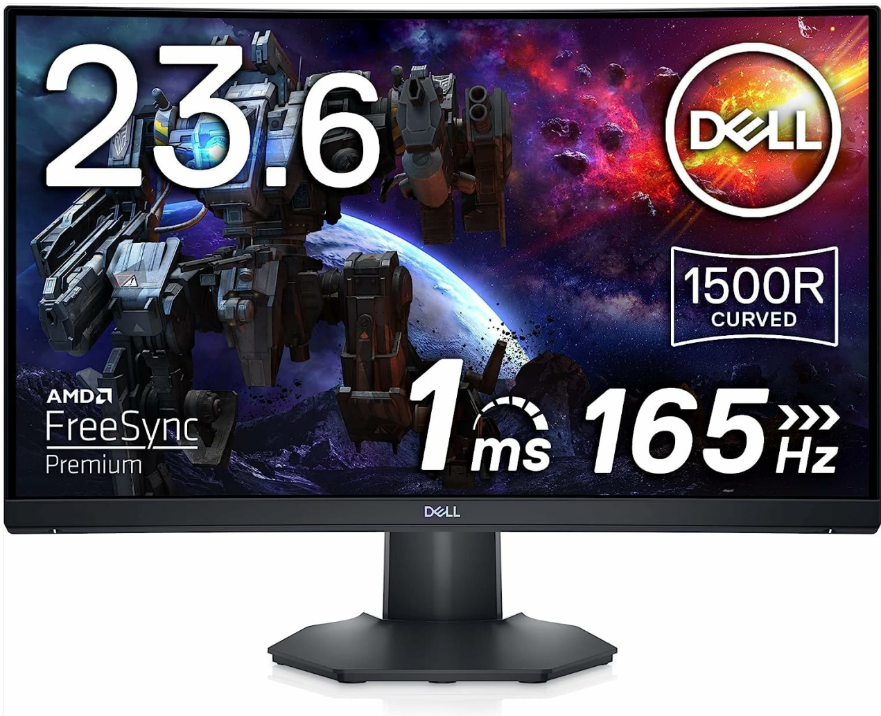
Image: Front view of the Dell S2422HG monitor, showcasing its curved display and narrow bezels while displaying a gaming scene.