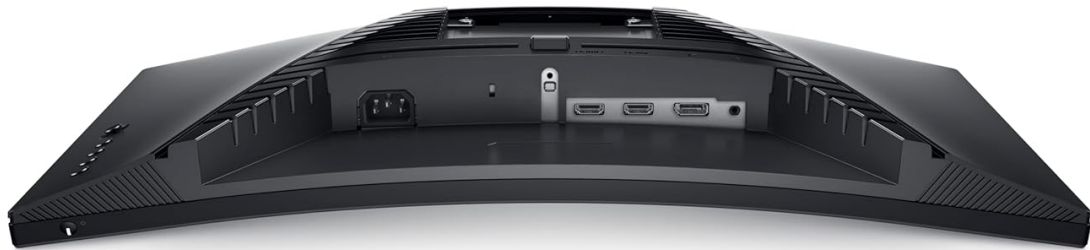
Image: Rear view of the Dell S2422HG monitor, highlighting the power input, DisplayPort, and HDMI connections.