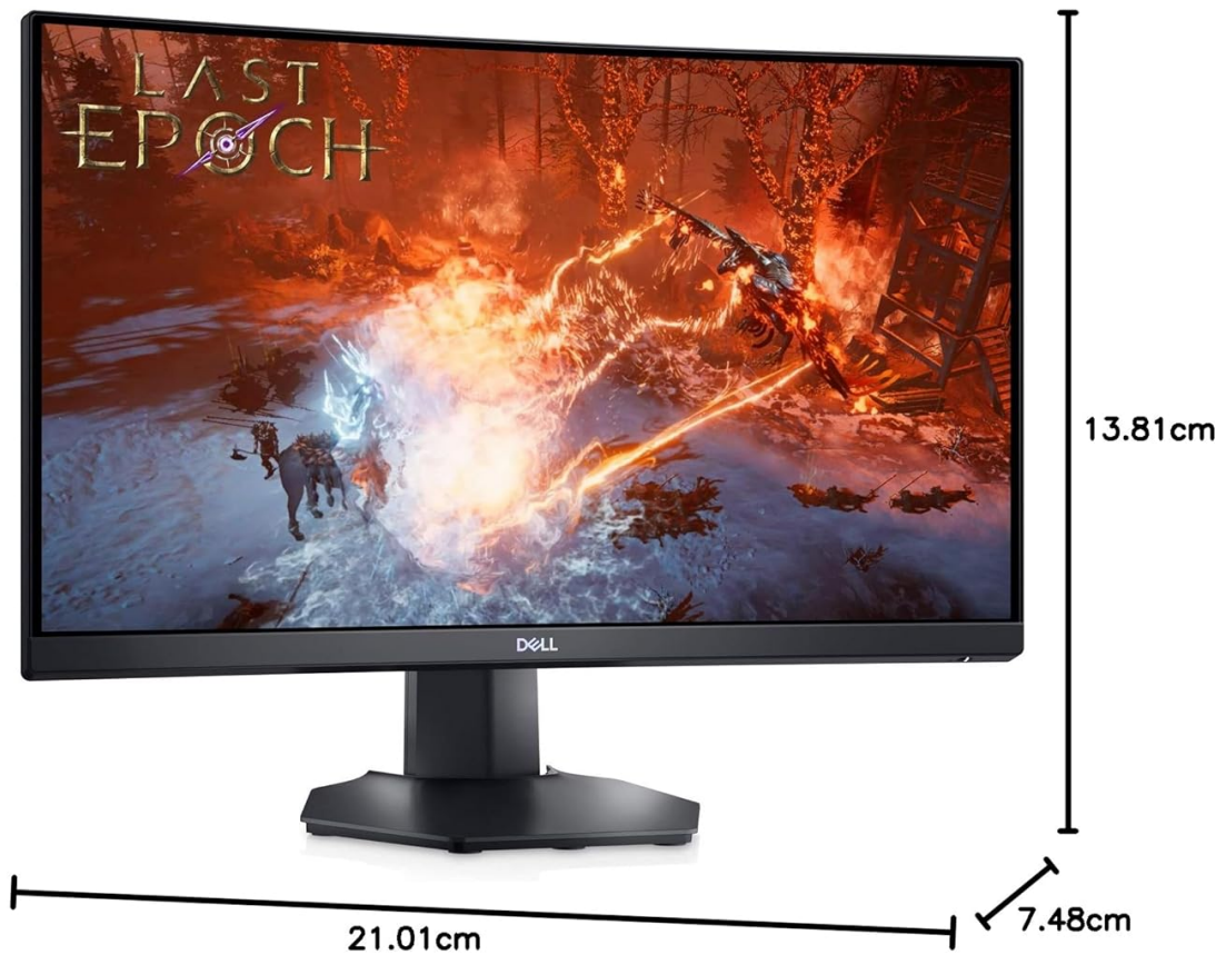
Image: Diagram illustrating the physical dimensions of the Dell S2422HG monitor with its stand.