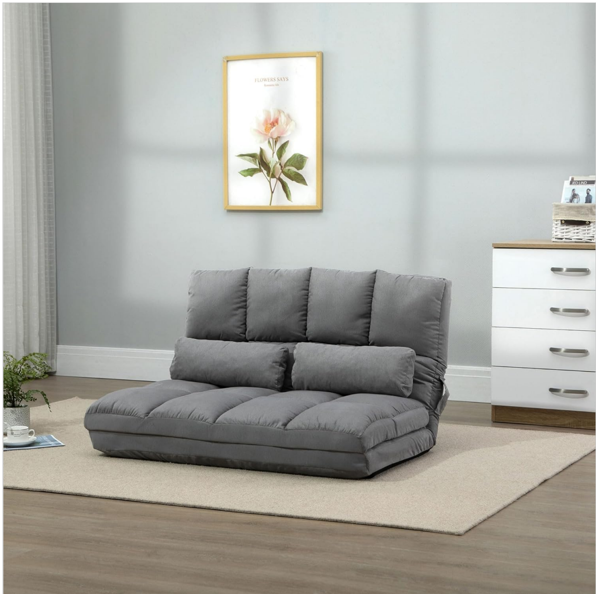
Image: The HOMCOM Convertible Floor Sofa Chair in its upright sofa configuration, placed on a rug in a room.