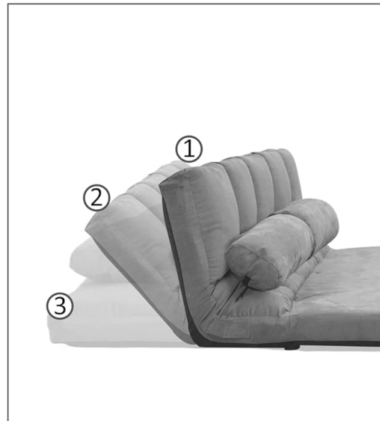
Image: A diagram illustrating the adjustable backrest and headrest positions. The backrest can be set to three different angles, and the headrest to five.