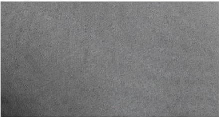
Soft Suede Fabric