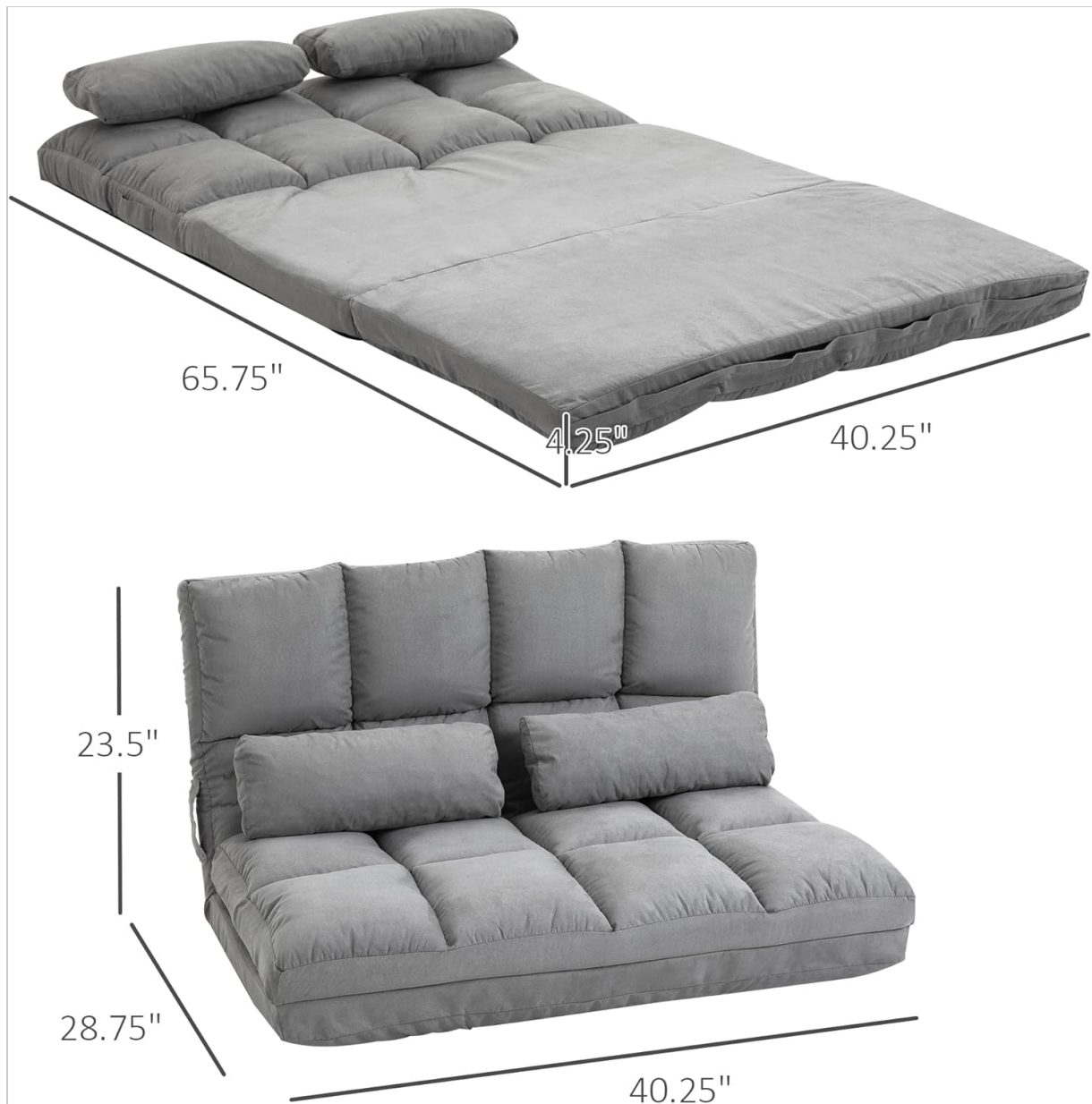
Image: A detailed diagram illustrating the dimensions of the HOMCOM Convertible Floor Sofa Chair in both its upright sofa form and fully reclined bed form.