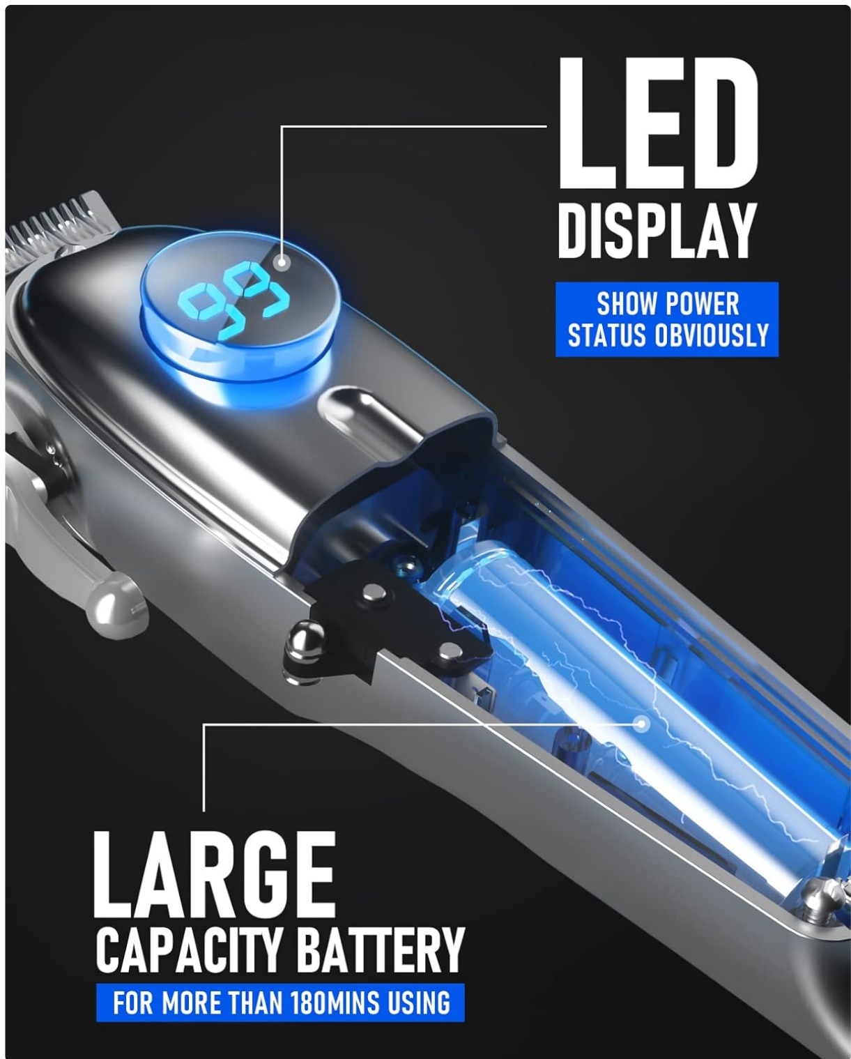
Image: An internal view of the clipper showing the LED display indicating power status and the large capacity battery, providing over 180 minutes of use.