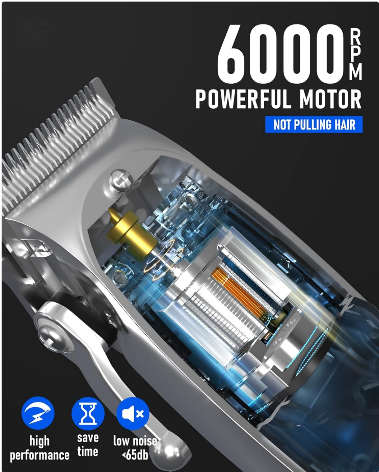
Image: An illustration of the clipper's internal 6000 RPM powerful motor, designed for high performance, time-saving, and quiet operation without pulling hair.