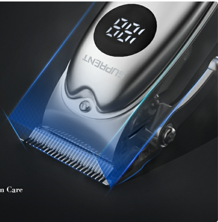
Image: A visual representation of the clipper's thermostatic technology, ensuring constant temperature for gentle care and skin protection.