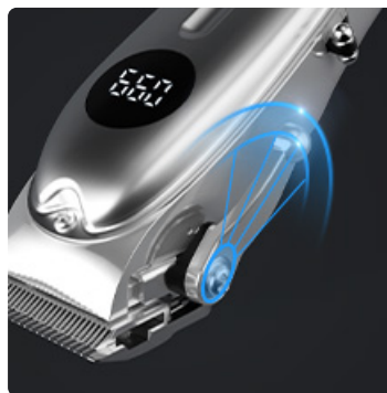
Image: A close-up of the blade adjustment lever on the side of the clipper, used for fine-tuning cutting length.

The main clipper features a taper lever on the side. Move the lever up or down to adjust the cutting length of the blade without changing guide combs. This allows for blending and fading.