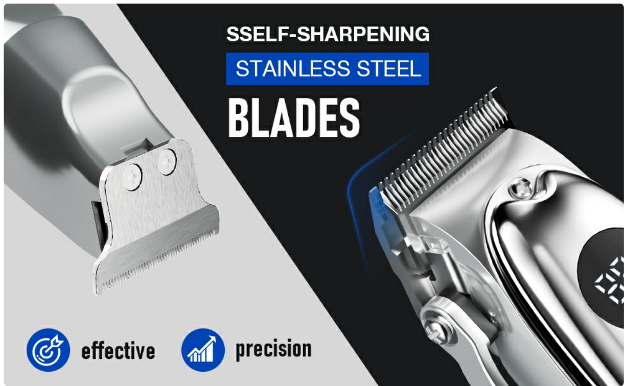
Image: Illustration of the self-sharpening stainless steel blades, emphasizing their effectiveness and precision for consistent performance.