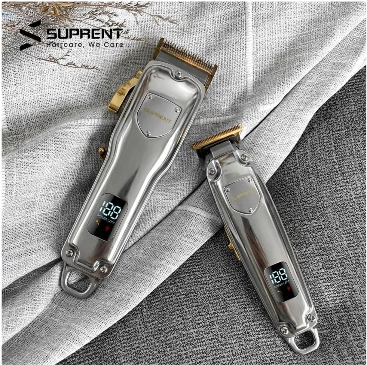
Image: The SUPRENT HC596SX professional hair clipper and detail trimmer, showcasing their sleek design and LED displays.