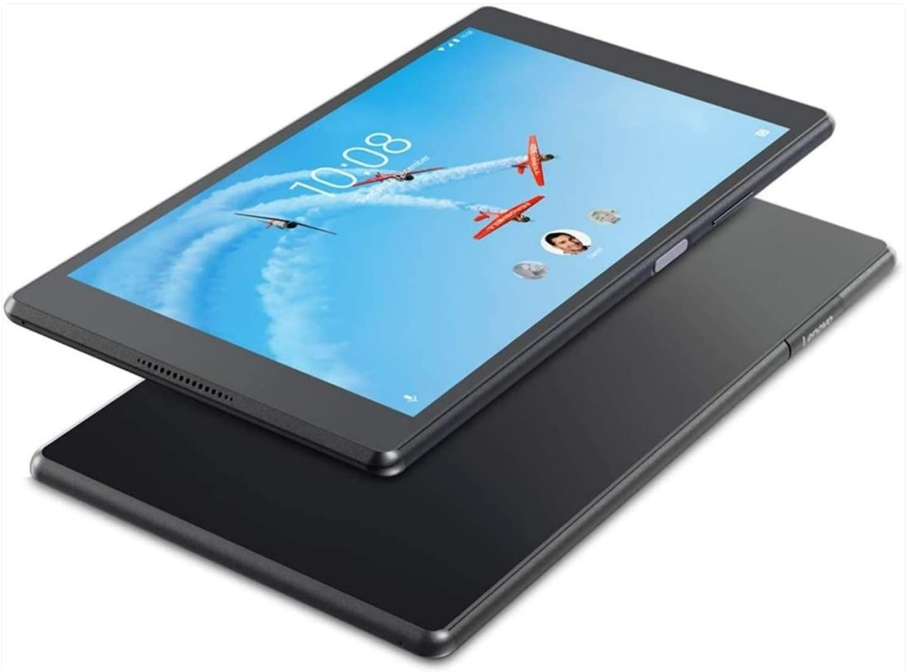
Figure 6.1: Angled view of the Lenovo Tab 4 Plus 8" Tablet.