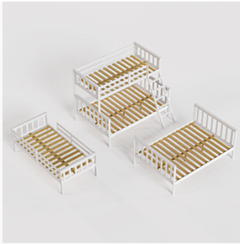
Image 4.2: Visual representation of the bunk bed converting into two separate beds.