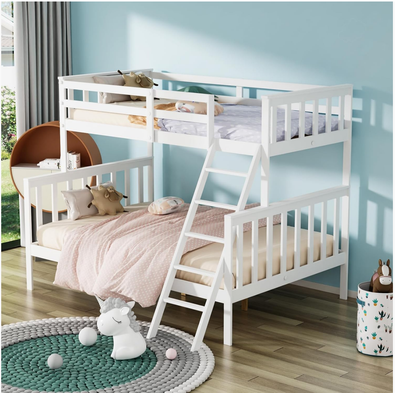
Image 1.1: Fully assembled JOYMOR Twin Over Full Bunk Bed in a bedroom setting.