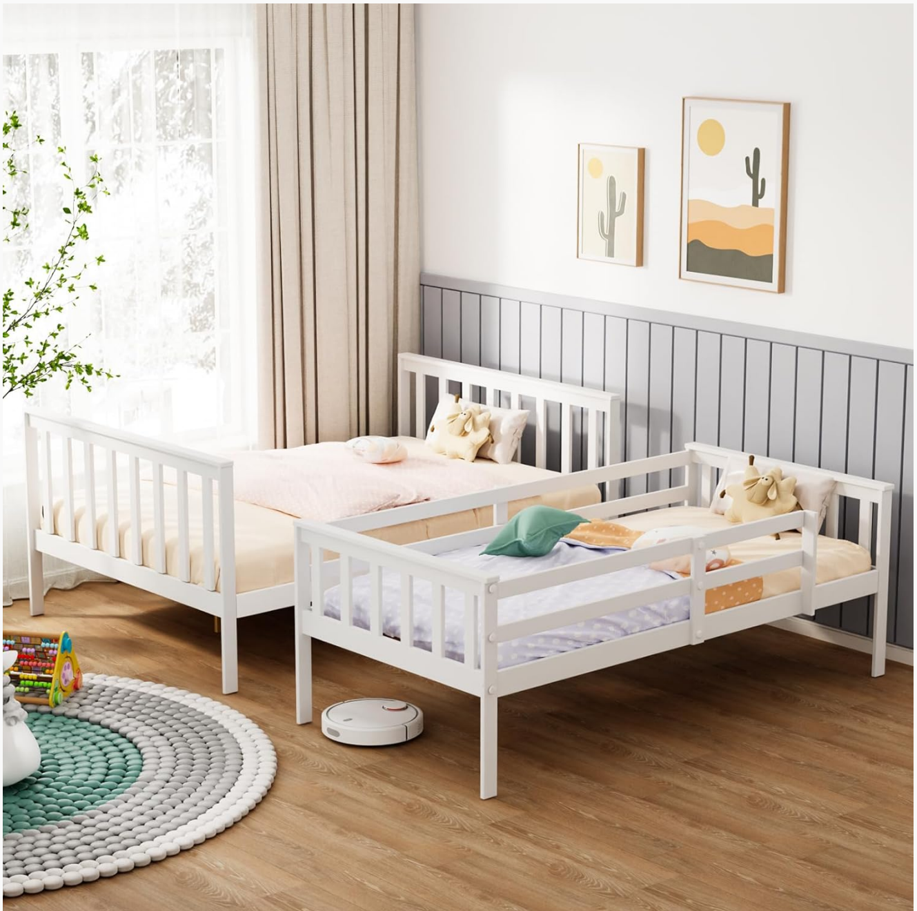
Image 4.3: The JOYMOR bed frame configured as two individual beds.