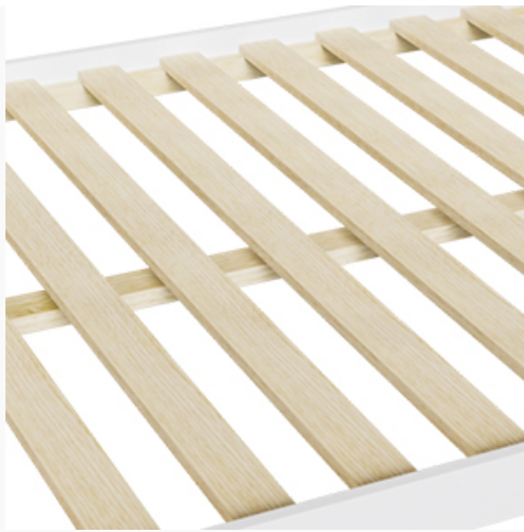
Image 3.2: Detail of the hardwood slats providing mattress support.