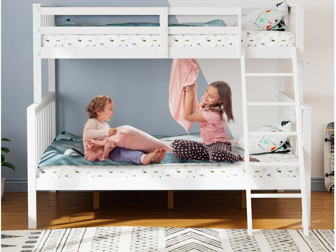
Image 4.1: Children utilizing the bunk bed, demonstrating the guardrail height.

Great height between the two beds and 14.5 in. upper bunk safety guardrails.