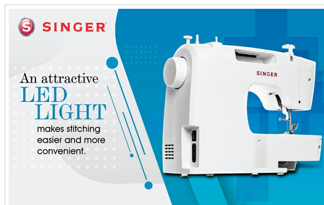
Image: The SINGER M1155 Sewing Machine with an arrow pointing to the LED light, indicating its position for illuminating the sewing area.

The integrated LED light illuminates your sewing area, providing clear visibility for detailed work and reducing eye strain. It activates automatically when the machine is powered on.