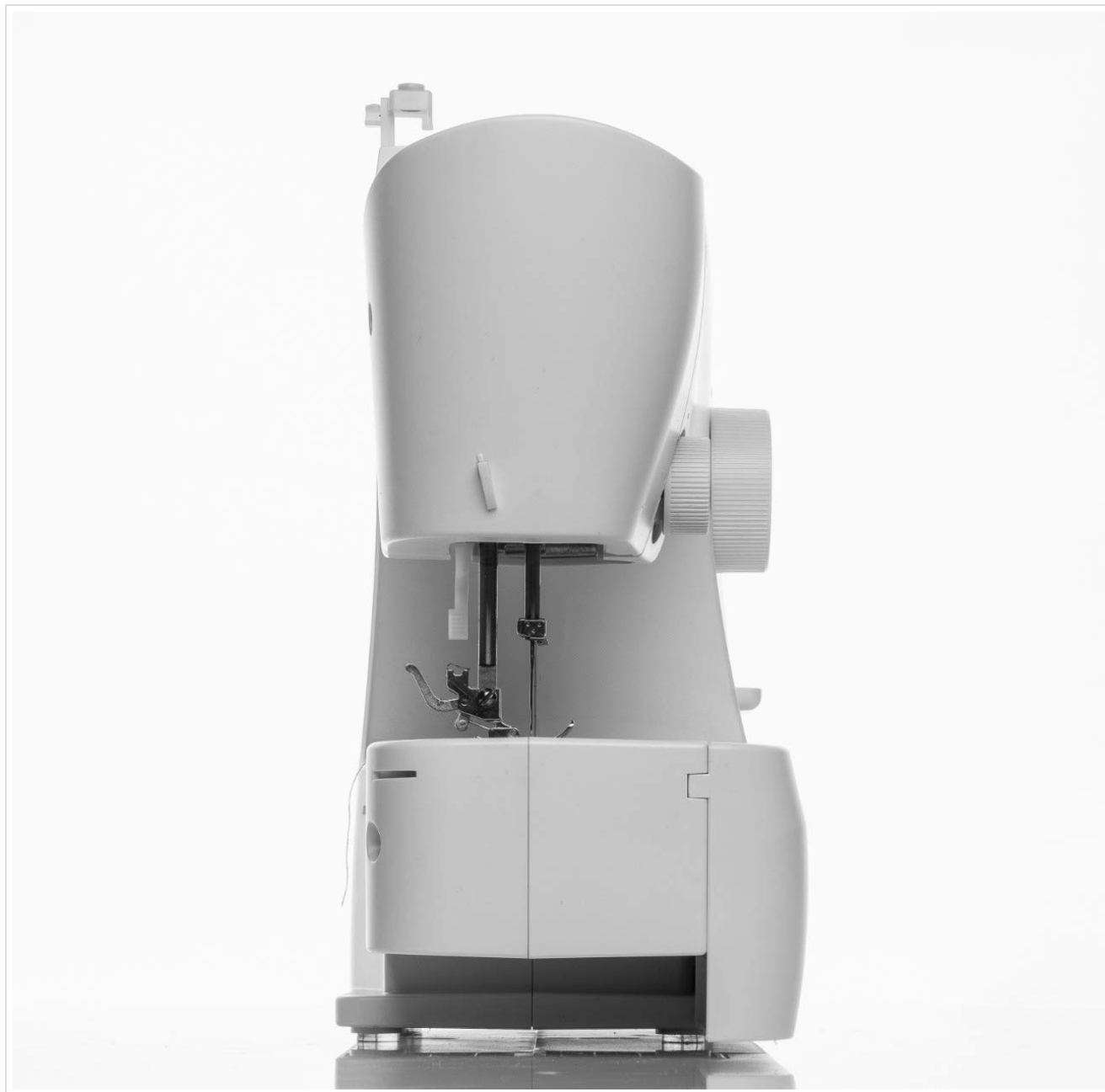
Image: Close-up view of the needle and presser foot area, illustrating the working space for threading and needle changes.

Ensure the machine is turned off before changing the needle. Loosen the needle clamp screw, remove the old needle, and insert a new needle with the flat side facing the back of the machine. Tighten the needle clamp screw securely. The machine supports needle positions for left and center stitching.