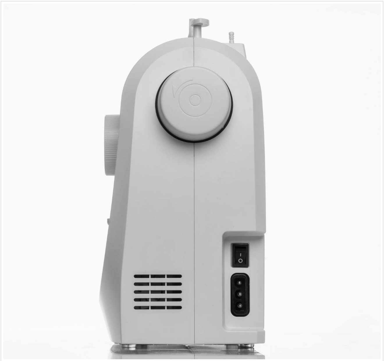
Image: Rear view of the SINGER M1155 Sewing Machine, showing the power input and on/off switch.