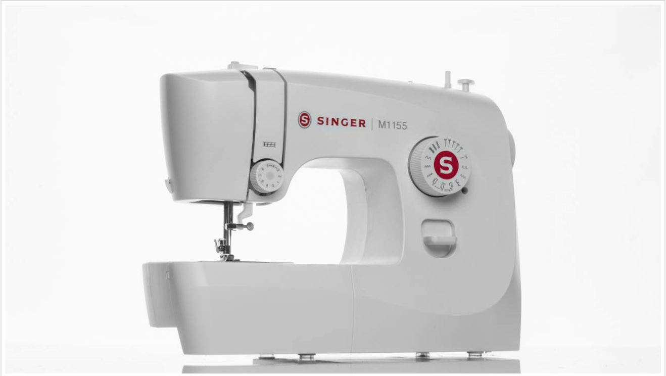
Image: Front view of the SINGER M1155 Sewing Machine, showcasing its compact design and main controls.