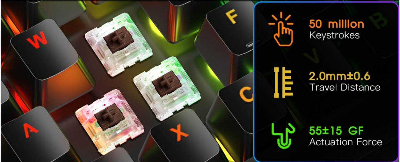
Image: A detailed view of the brown mechanical switches on the RECCAZR TK18 keyboard, highlighting their construction.

Not only offer the satisfying tactile bump feel, but also being ever so slightly quieter than blue switches, fitting for working or gaming use.