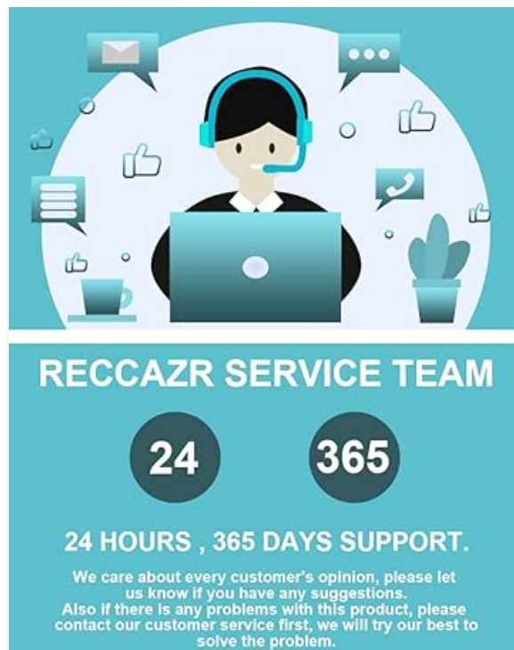
Image: An illustration representing the RECAZR customer service team, indicating 24/365 support availability.