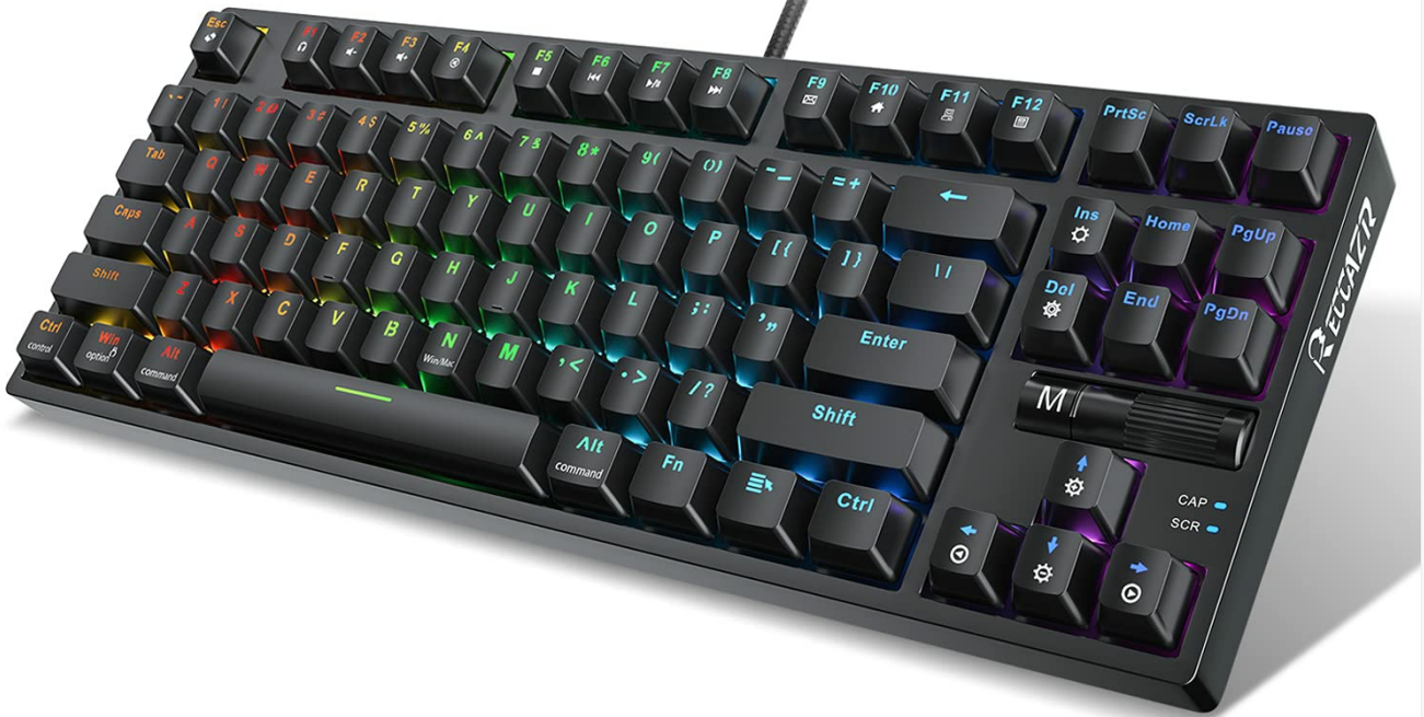
Image: The RECCAZR TK18 TKL Mechanical Gaming Keyboard, showcasing its compact design and RGB lighting.