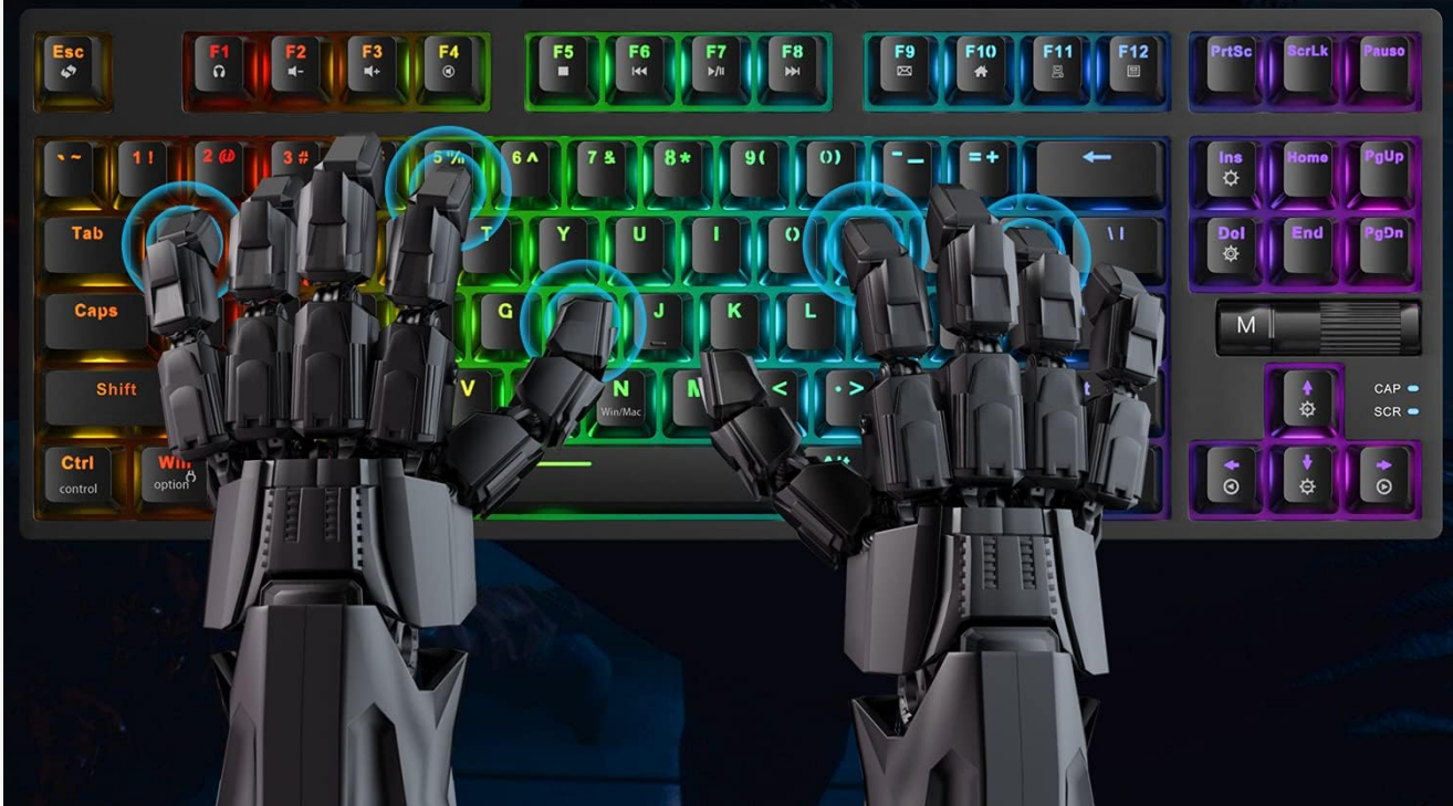
Image: The RECCAZR TK18 keyboard showcasing its vibrant RGB LED backlighting with different color patterns.

ALL 87 keys are conflict free (n-Key Rollover) for ultimate Gaming performance. Make gaming unimpeded.