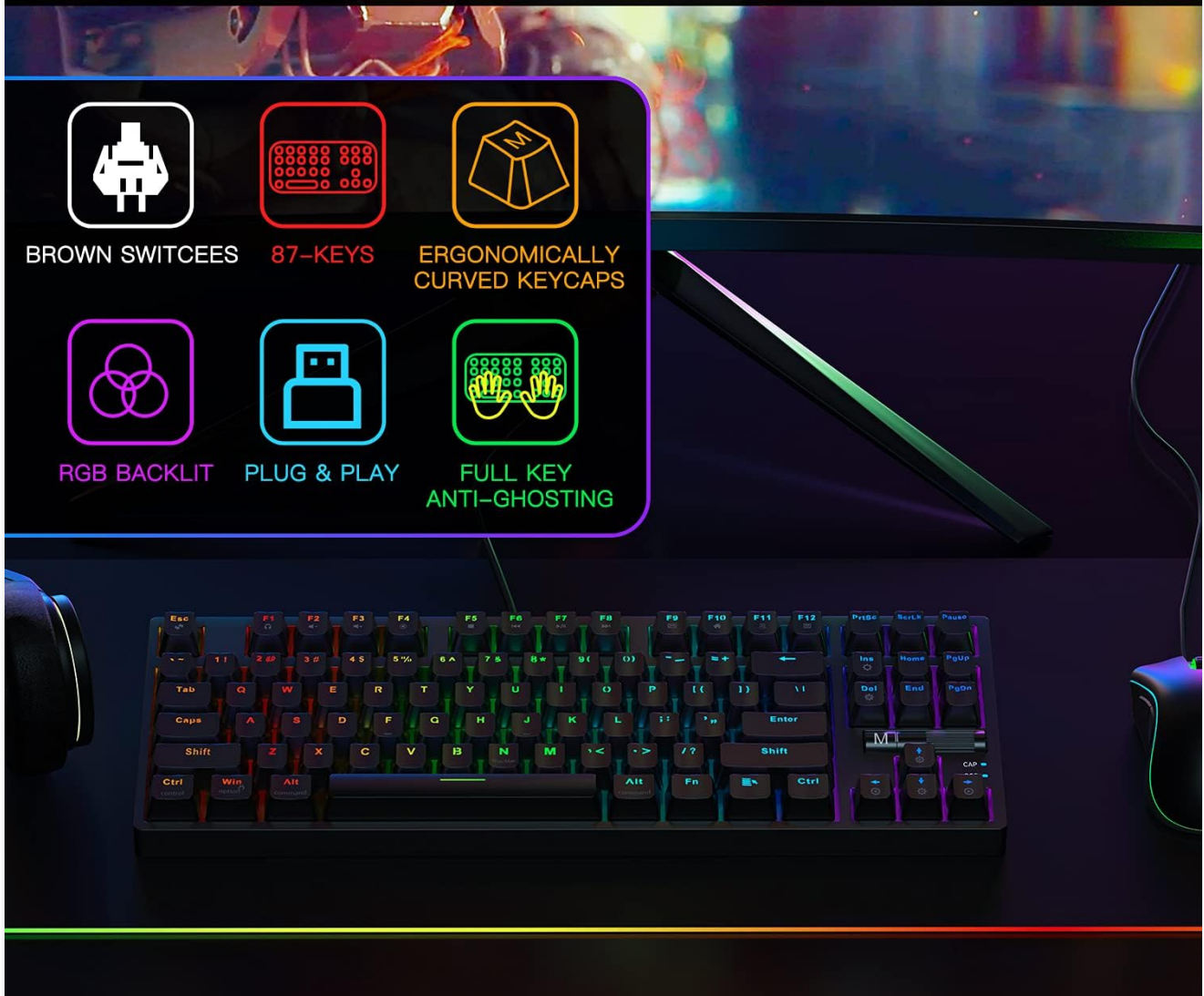
Image: The RECCAZR TK18 keyboard with icons indicating brown switches, 87 keys, ergonomic keycaps, RGB backlight, plug & play, and full key anti-ghosting.