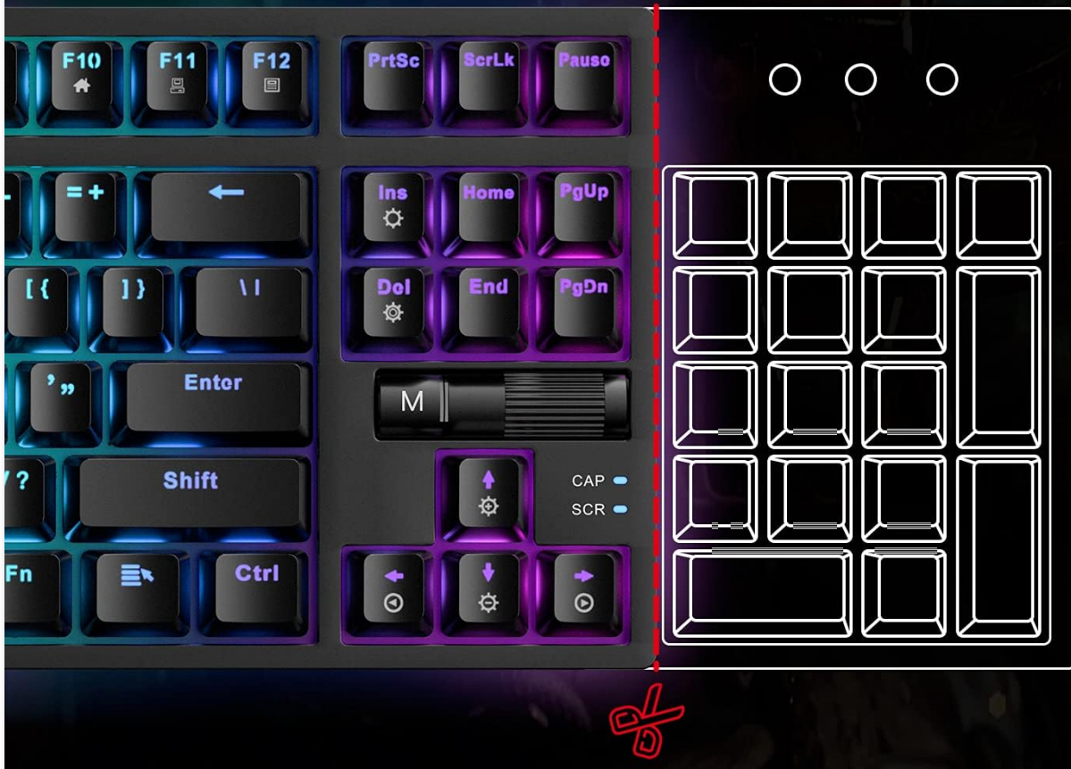
Image: A visual representation of the RECCAZR TK18's tenkeyless design, showing the absence of a numeric keypad to save space.

The compact 87 keys space-saving design, frees up your desktop space. Make your work and game operation more comfortable and handy.