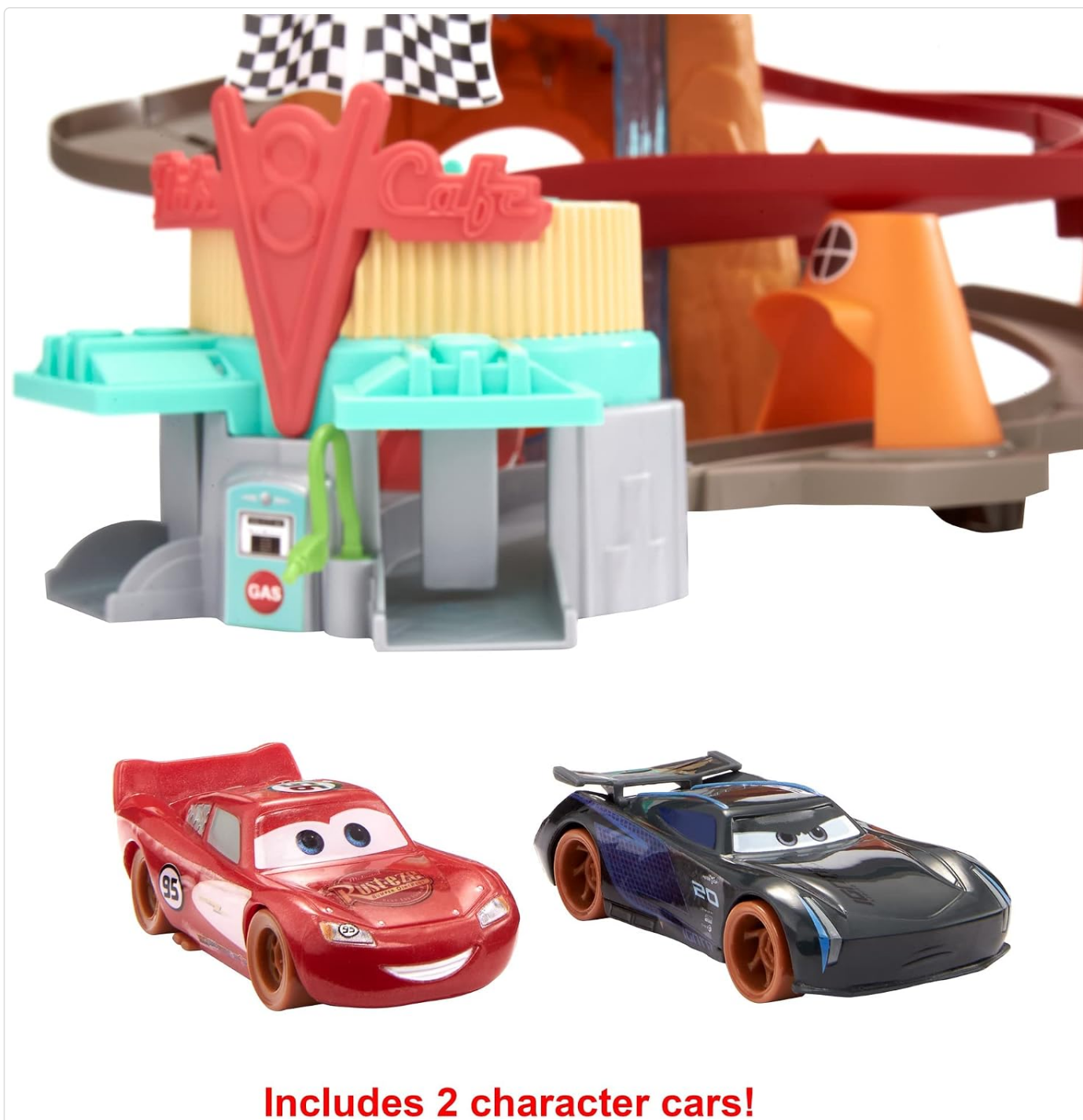
Image: The two included character cars, Lightning McQueen (red) and Jackson Storm (dark blue/black).