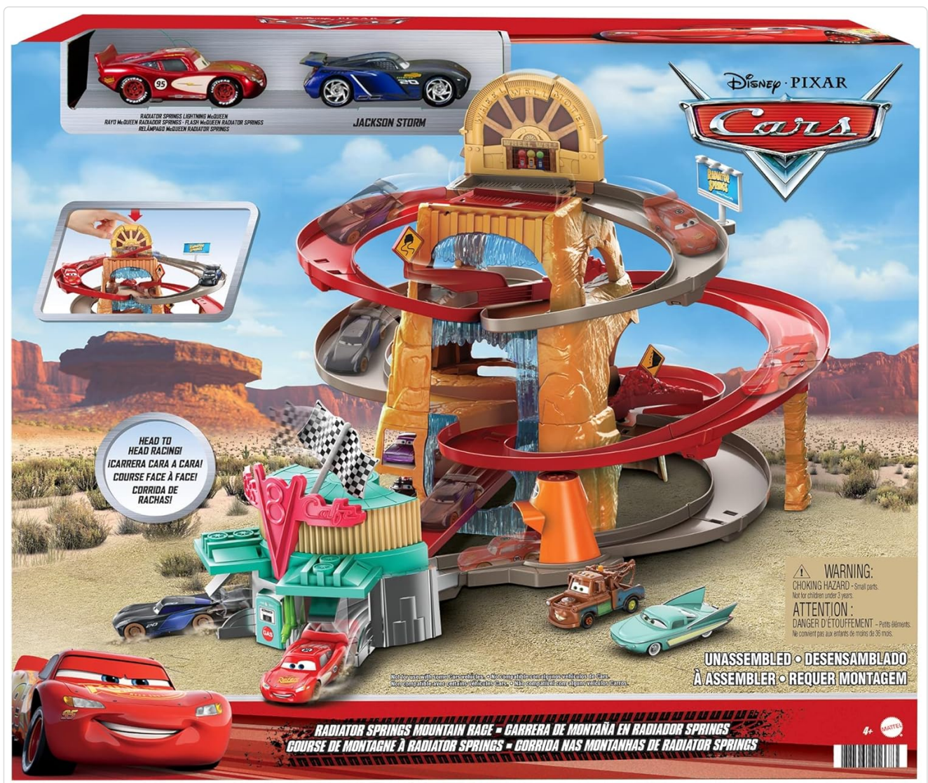
Image: The complete playset, including the Wheel Well Motel, racing tracks, Flo's V8 Cafe, and the two included vehicles, shown with its retail packaging.