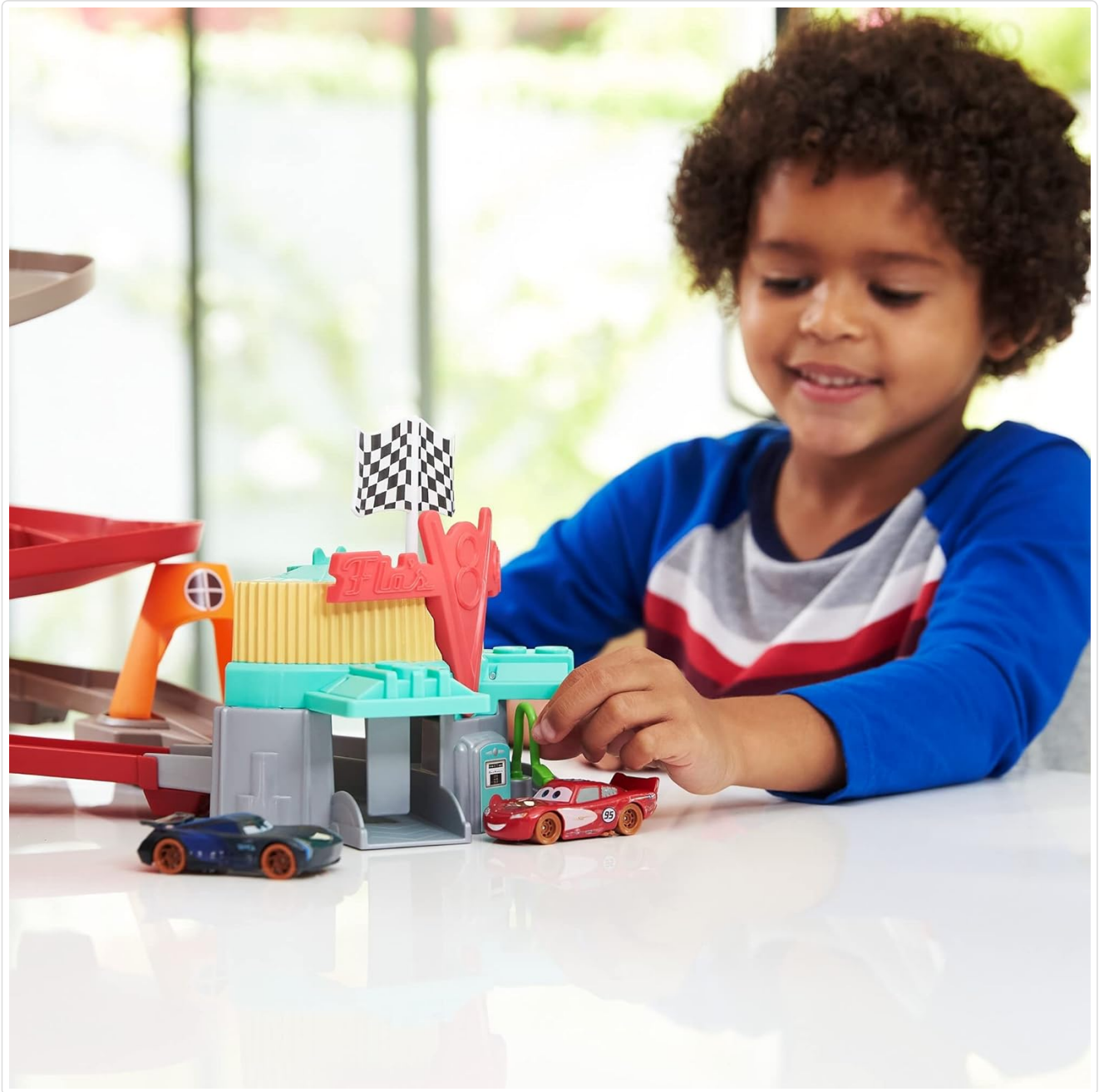
Image: A child interacting with the playset, pushing Lightning McQueen towards the gas pump at Flo's V8 Cafe, with Jackson Storm positioned on the track.