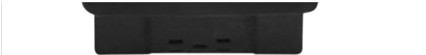
Figure 2: Side view of the watch, highlighting the crown and function buttons.