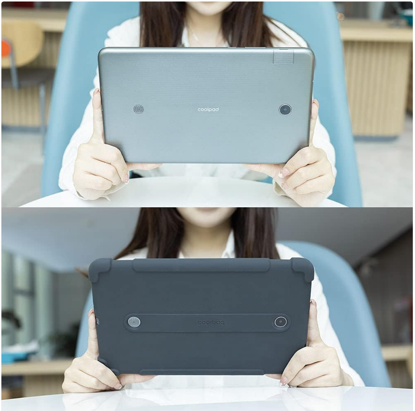
Figure 2: Coolpad Tasker Tablet and its Shock Protection Case. The image displays the tablet alongside its durable protective case, highlighting the included accessory.