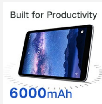
Figure 7: 6000mAh Battery Capacity. This image highlights the tablet's large battery, designed for extended productivity.

The 6000mAh battery provides extended usage time. To optimize battery life, reduce screen brightness, close unused applications, and disable Wi-Fi or Bluetooth when not in use. Utilize the Quick Charge 3.0 feature for rapid recharging.