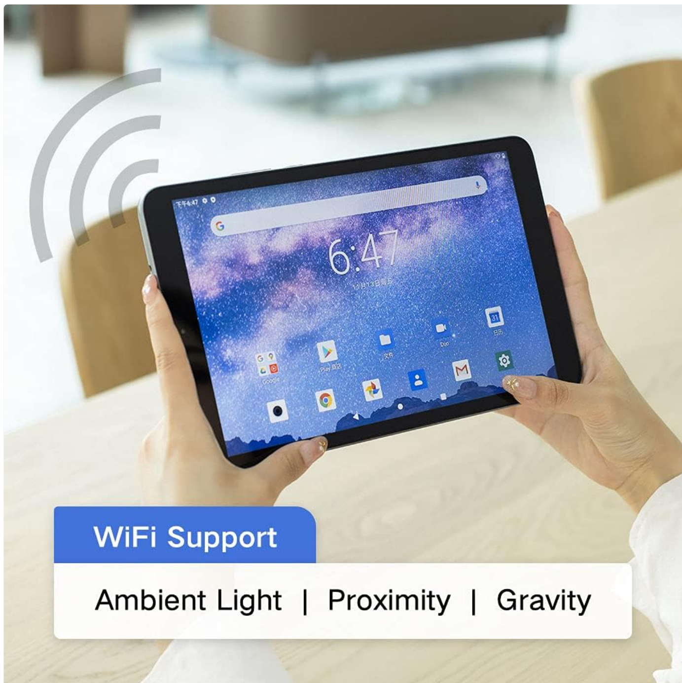
Figure 5: Wi-Fi Connectivity. The tablet is shown with a Wi-Fi signal icon, indicating active wireless internet connection.