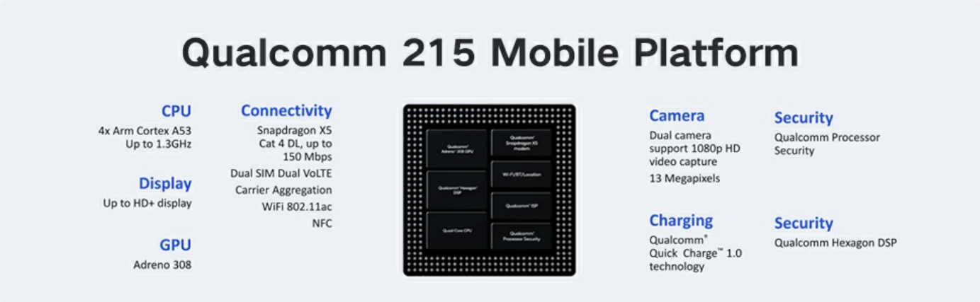
Figure 8: Qualcomm 215 Mobile Platform. This diagram details the capabilities of the Qualcomm 215 processor, including CPU, GPU, connectivity, camera, charging, and security features.

Below are the key technical specifications for the Coolpad Tasker Tablet 3667AT 10IN WiFi: