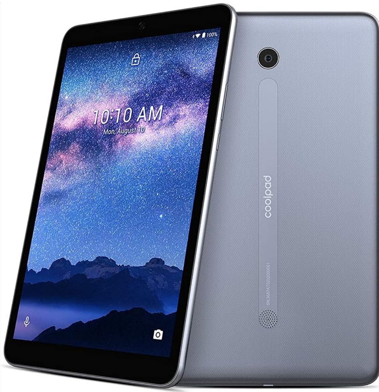
Figure 1: Front and Rear View of the Coolpad Tasker Tablet. The tablet features a sleek design with a camera on the rear and a large display on the front.