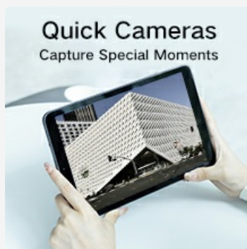
Figure 6: Capturing Moments with the Camera. The image shows the tablet's camera in use, ready to capture special moments.

Your tablet is equipped with a 5MP HDR rear-facing camera and a 2MP front-facing camera. Open the Camera app to capture photos, selfies, or record videos. Tap the screen to focus and press the shutter button to take a picture.