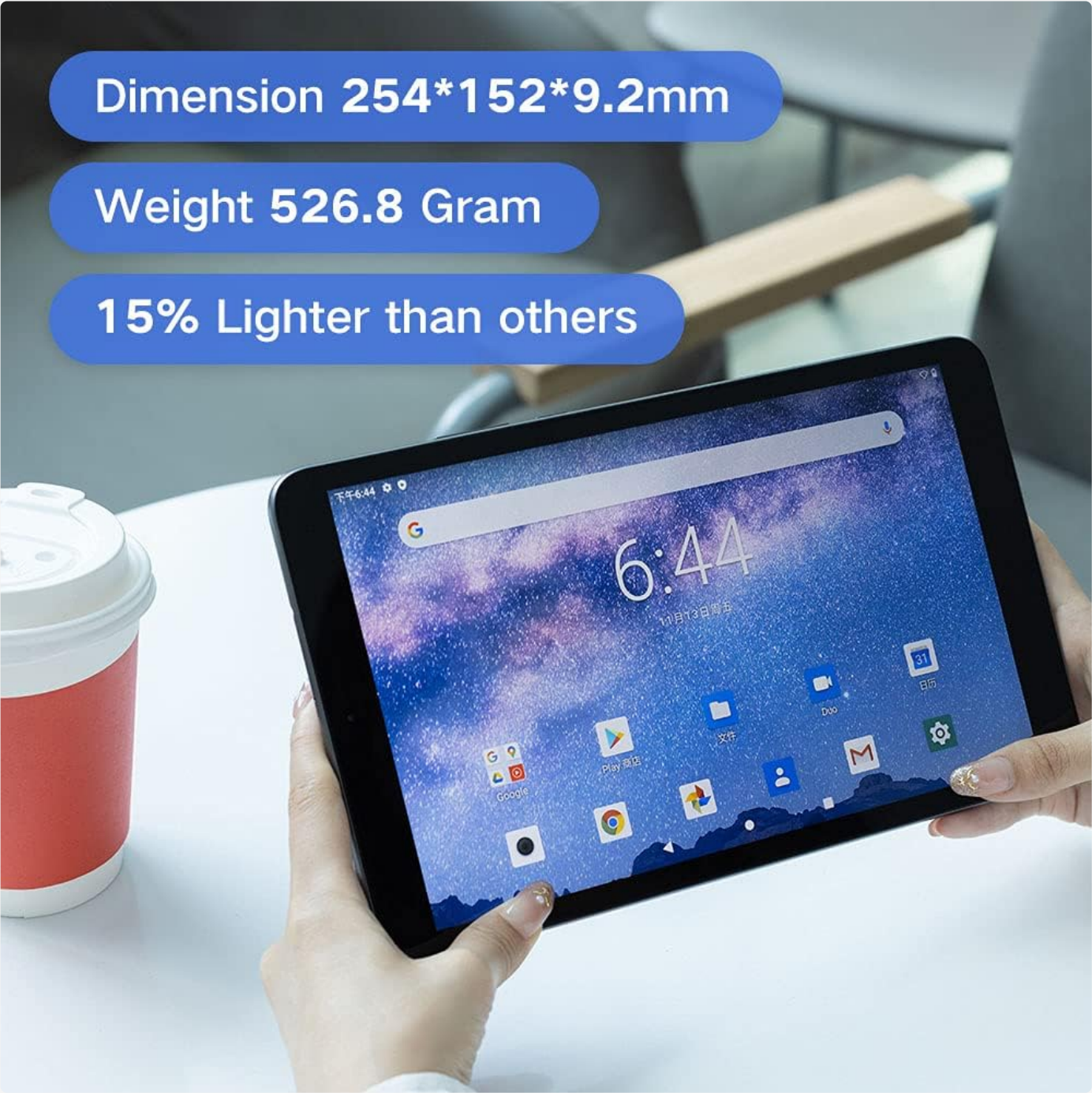
Figure 9: Tablet Dimensions and Weight. This image illustrates the physical dimensions (254*152*9.2mm) and weight (526.8 Gram) of the tablet, noting it is 15% lighter than comparable devices.