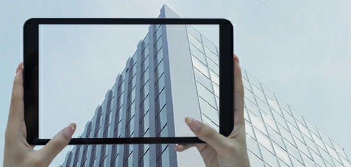
Figure 10: 10" IPS TFT WXGA 1280*800 Display. The image showcases the tablet's high-definition display, emphasizing its vibrant and clear visual quality.