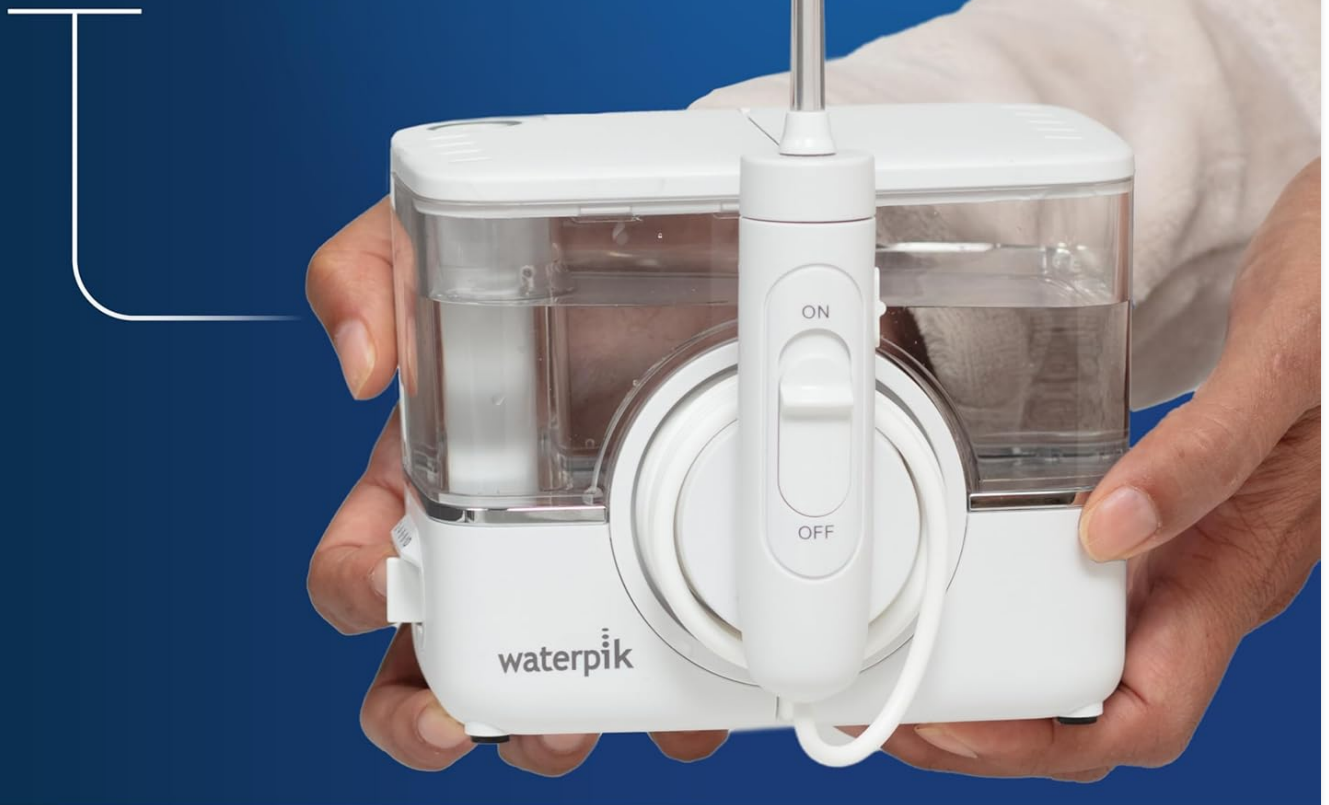
Image: The Waterpik ION unit demonstrating its compact, cordless design, ideal for small spaces.

Compact & rechargeable – no outlet needed