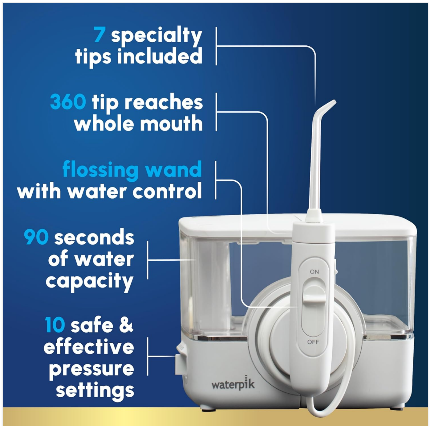
Image: Key features of the Waterpik ION, illustrating the various tips, water capacity, and pressure settings.