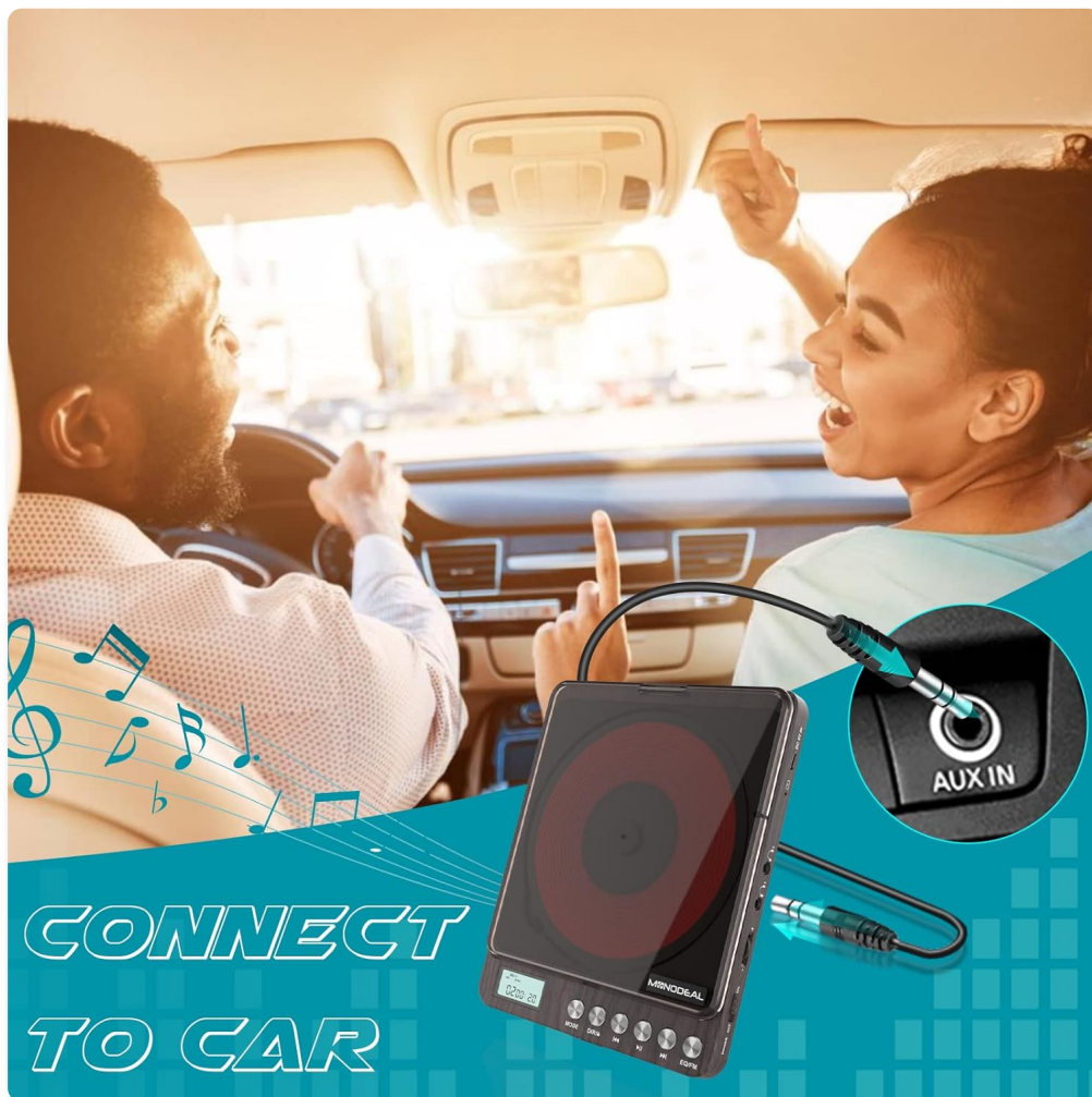
Figure 5: Connecting the CD player to a car's AUX input.