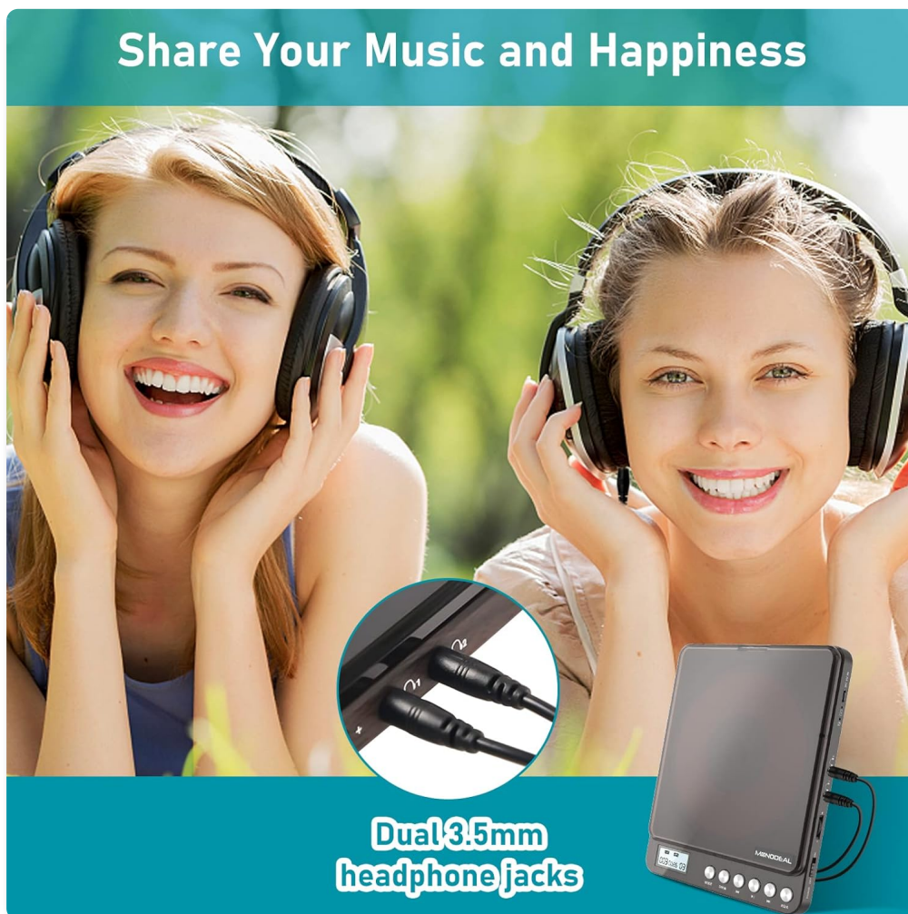
Figure 7: The dual headphone jacks allow for shared listening.