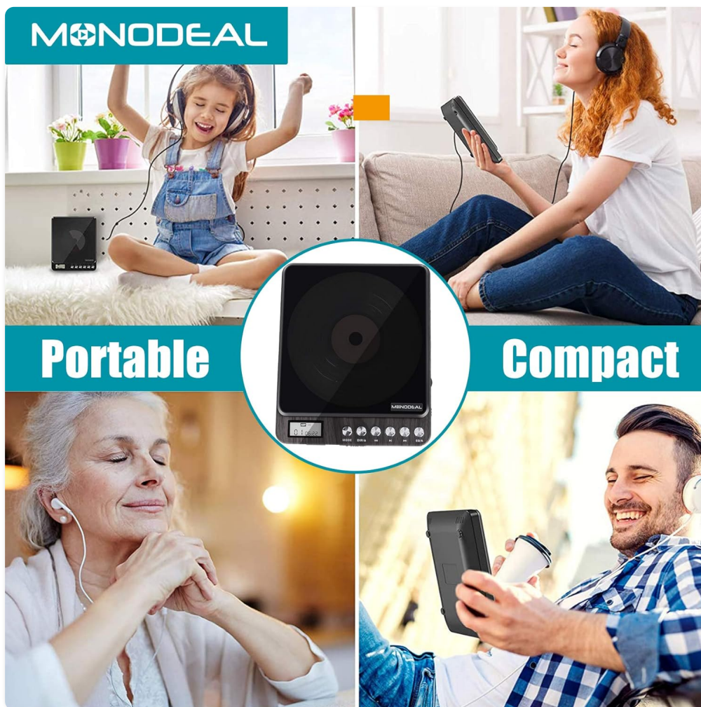
Figure 9: The CD player's portable and compact design for various uses.