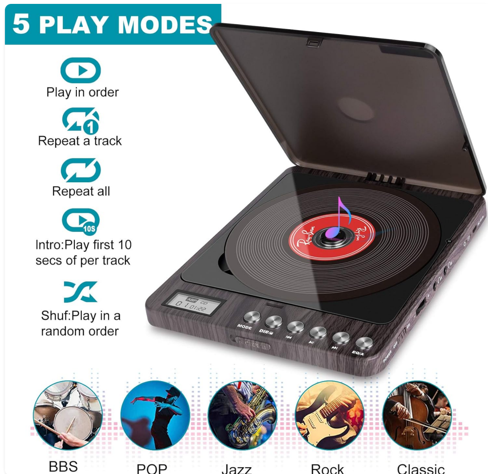
Figure 4: Available playback modes for your CD player.

Press the Play Mode Button (3) repeatedly to cycle through different playback modes: