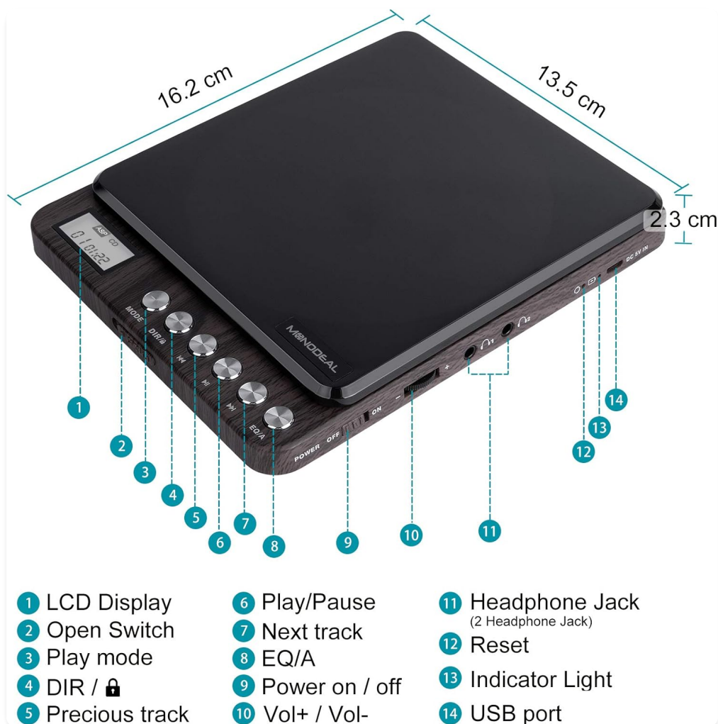
Figure 2: Labeled diagram of the CD player's controls and ports.

Familiarize yourself with the various parts and controls of your MONODEAL Portable CD Player.