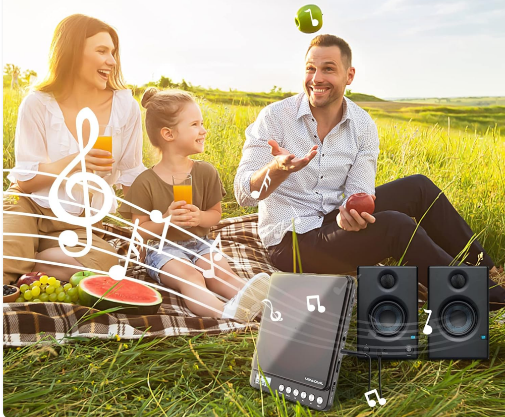
Figure 6: Connecting the CD player to external speakers.