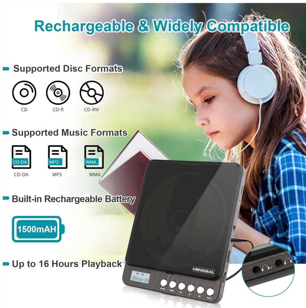
Figure 3: The CD player is portable and rechargeable, offering extended playback.