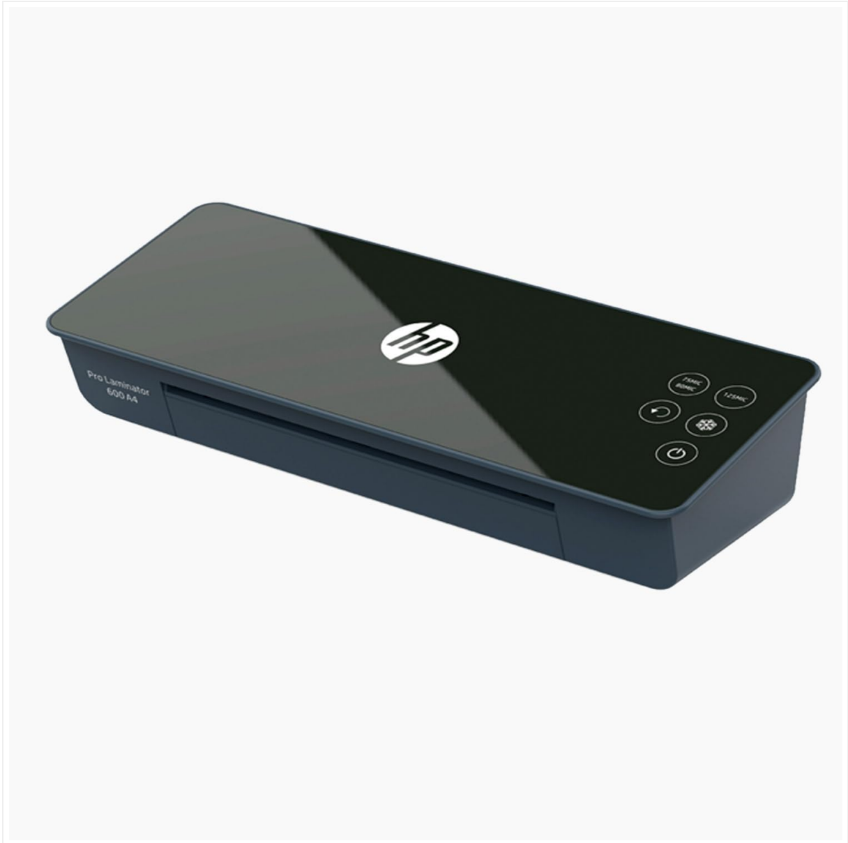
Figure 4.1: Front angled view of the HP Pro Laminator 600 A4, showcasing its sleek design and control panel.

Familiarize yourself with the components of your HP Pro Laminator 600 A4.