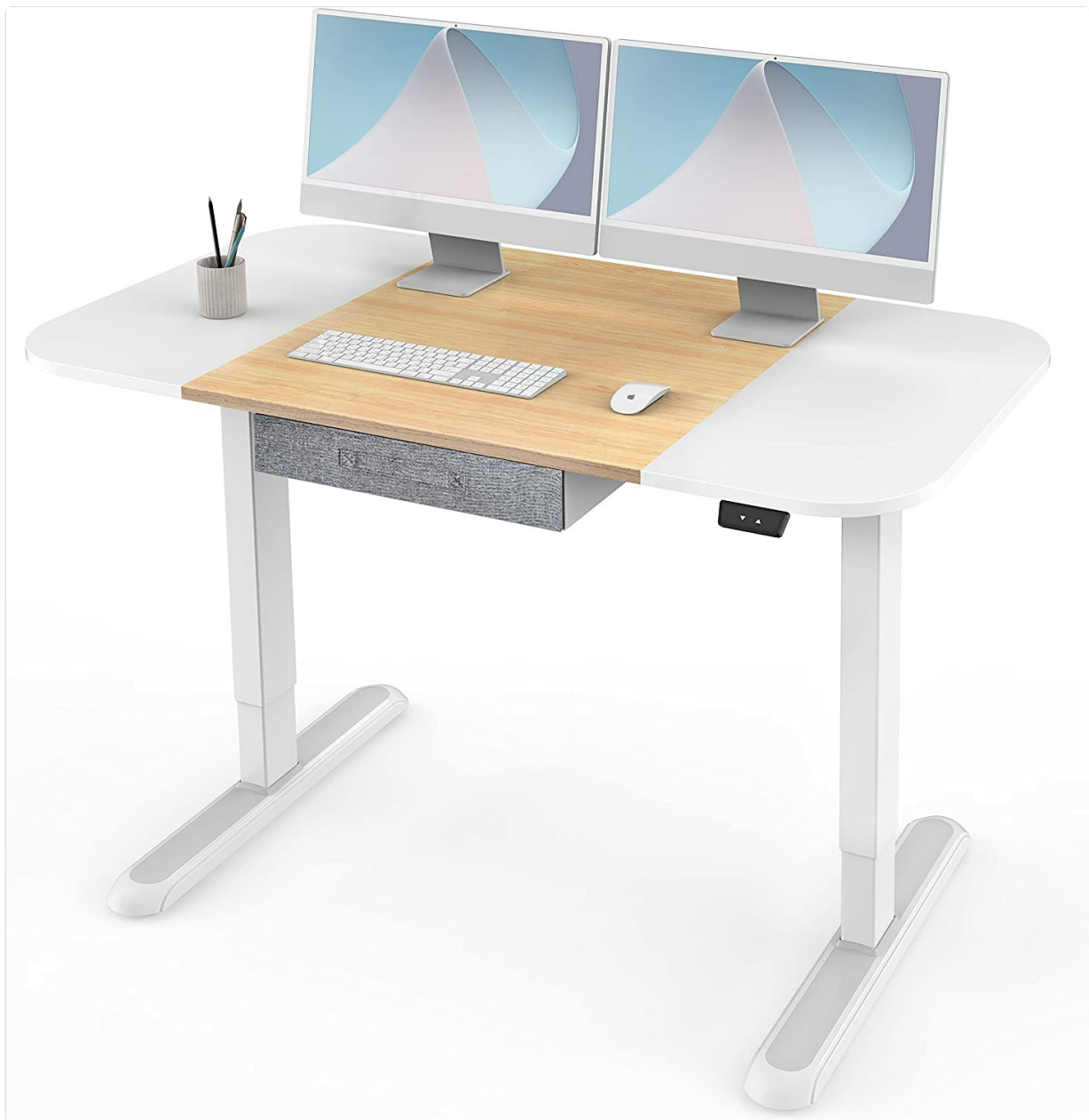
Image: Fenge Electric Standing Desk in a modern office setting, showcasing its design and functionality.