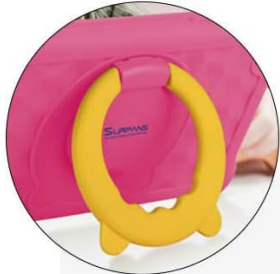
Soft Silicone Cover