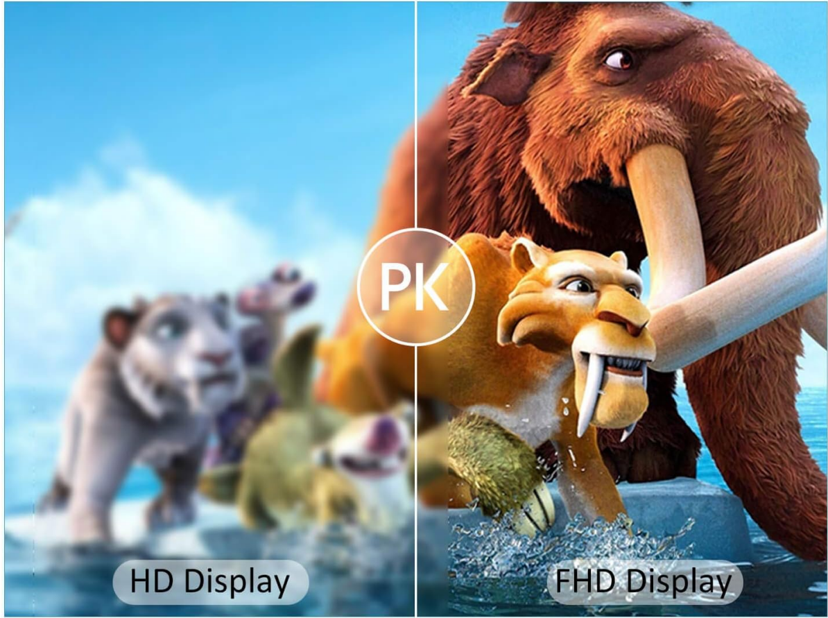
Image: Visual comparison highlighting the superior clarity of the 1920x1200 FHD IPS display with a 178-degree wide viewing angle on the Surfans K7 Kids Tablet.