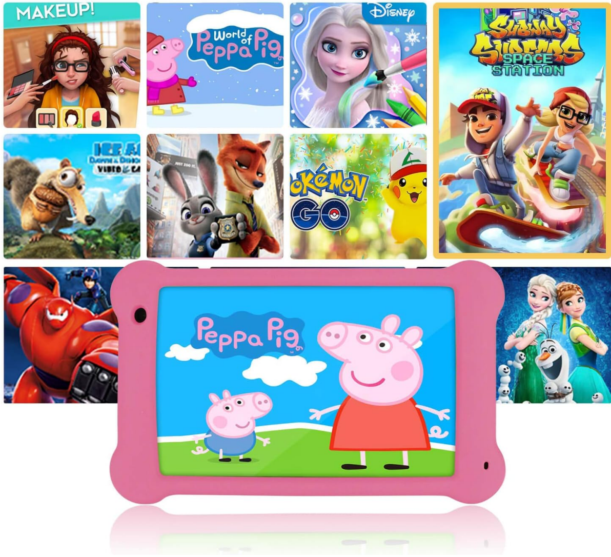
Image: The Surfans K7 Kids Tablet showcasing a variety of popular kid-friendly content, accessible through pre-installed apps and Google Play Store.