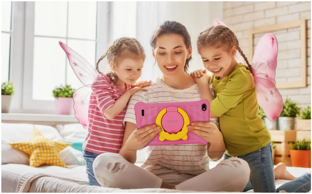
Image: The Surfans K7 Kids Tablet showcasing its GMS Certified Android 10.0 operating system and access to various applications via Google Play Store.