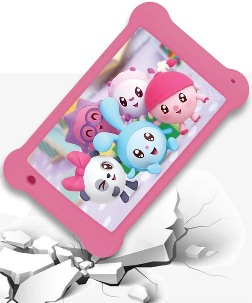
Image: A detailed view of the Surfans K7 Kids Tablet's durable kid-proof case, highlighting its soft silicone material and anti-drop corner design for enhanced protection.