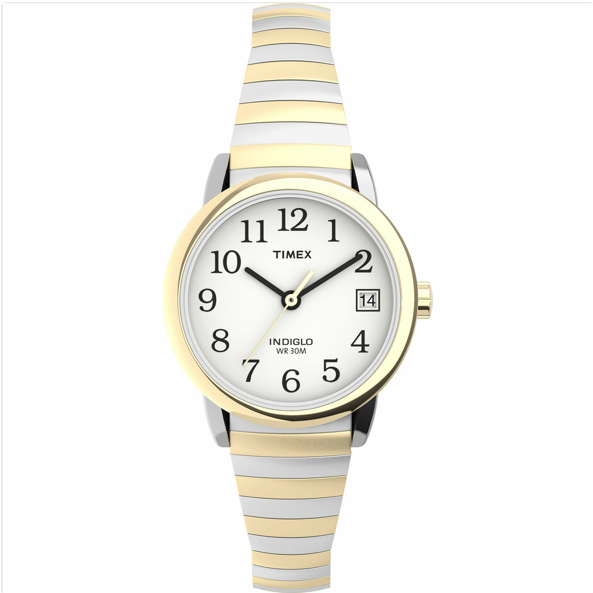
Figure 1: Front view of the Timex Women's Easy Reader 25mm Watch with two-tone expansion band and white dial.