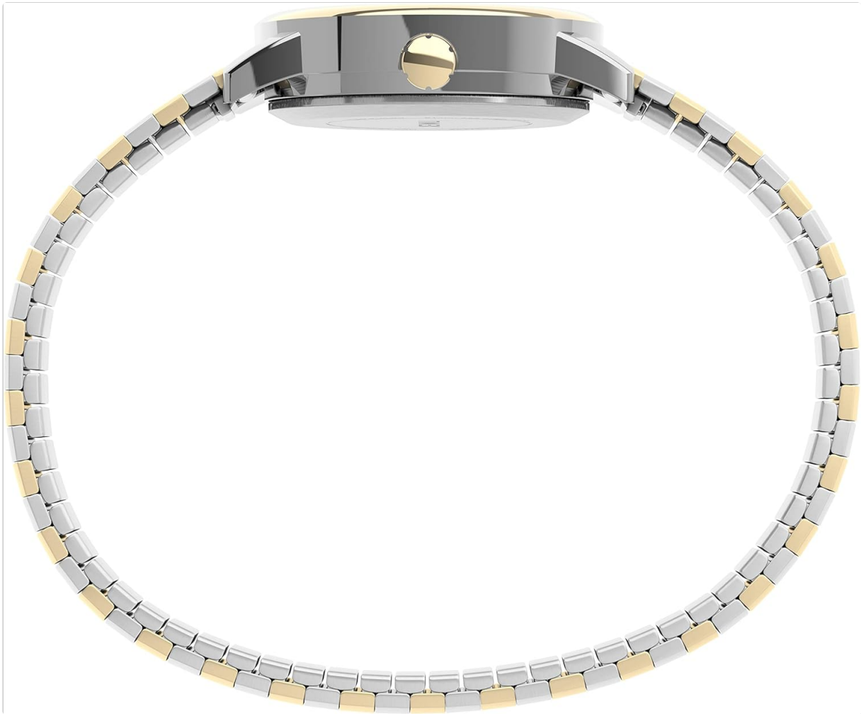
Figure 2: Side view of the watch, highlighting the crown used for setting time and date.