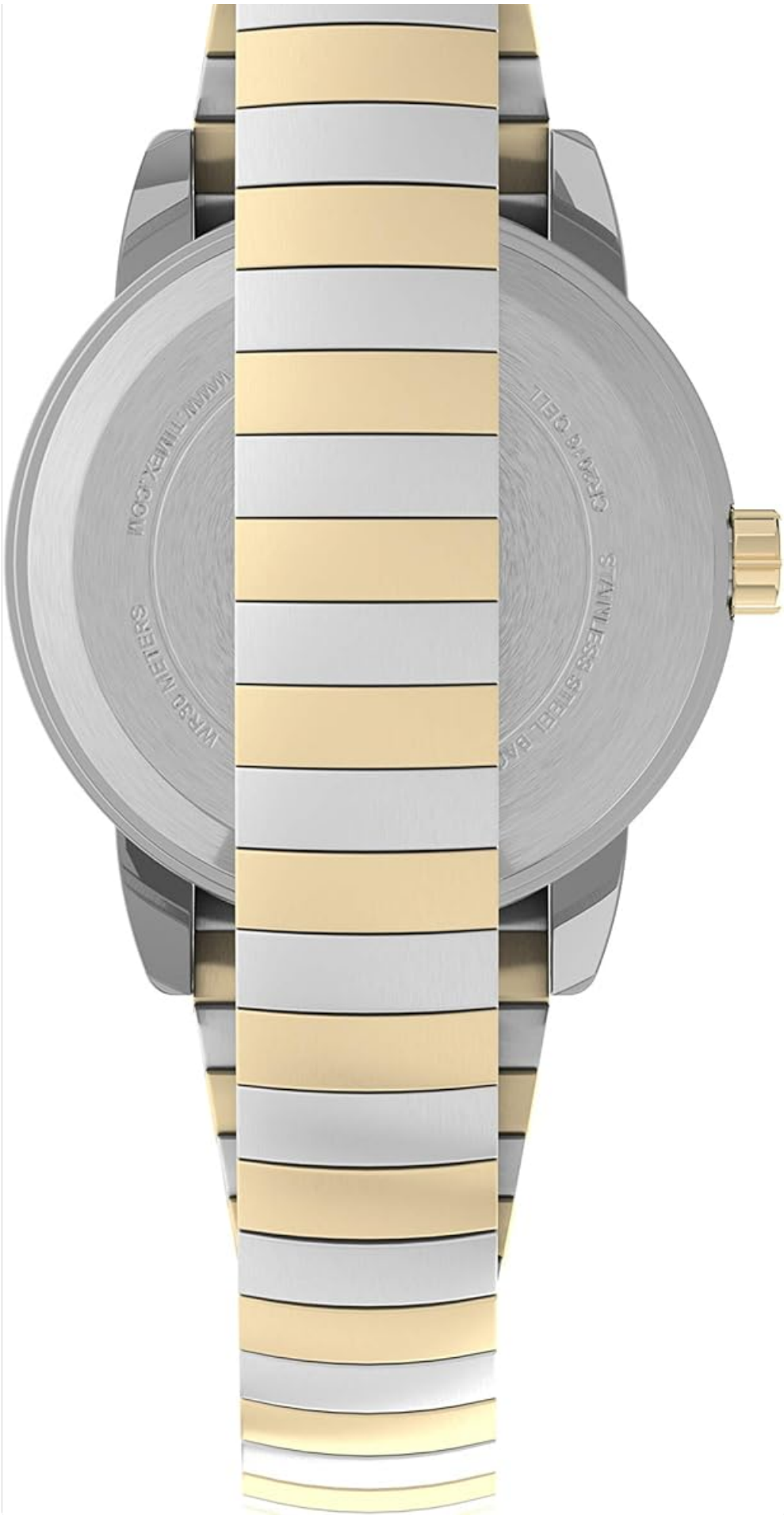
Figure 4: Back view of the watch, showing the stainless steel case back where the battery is accessed.