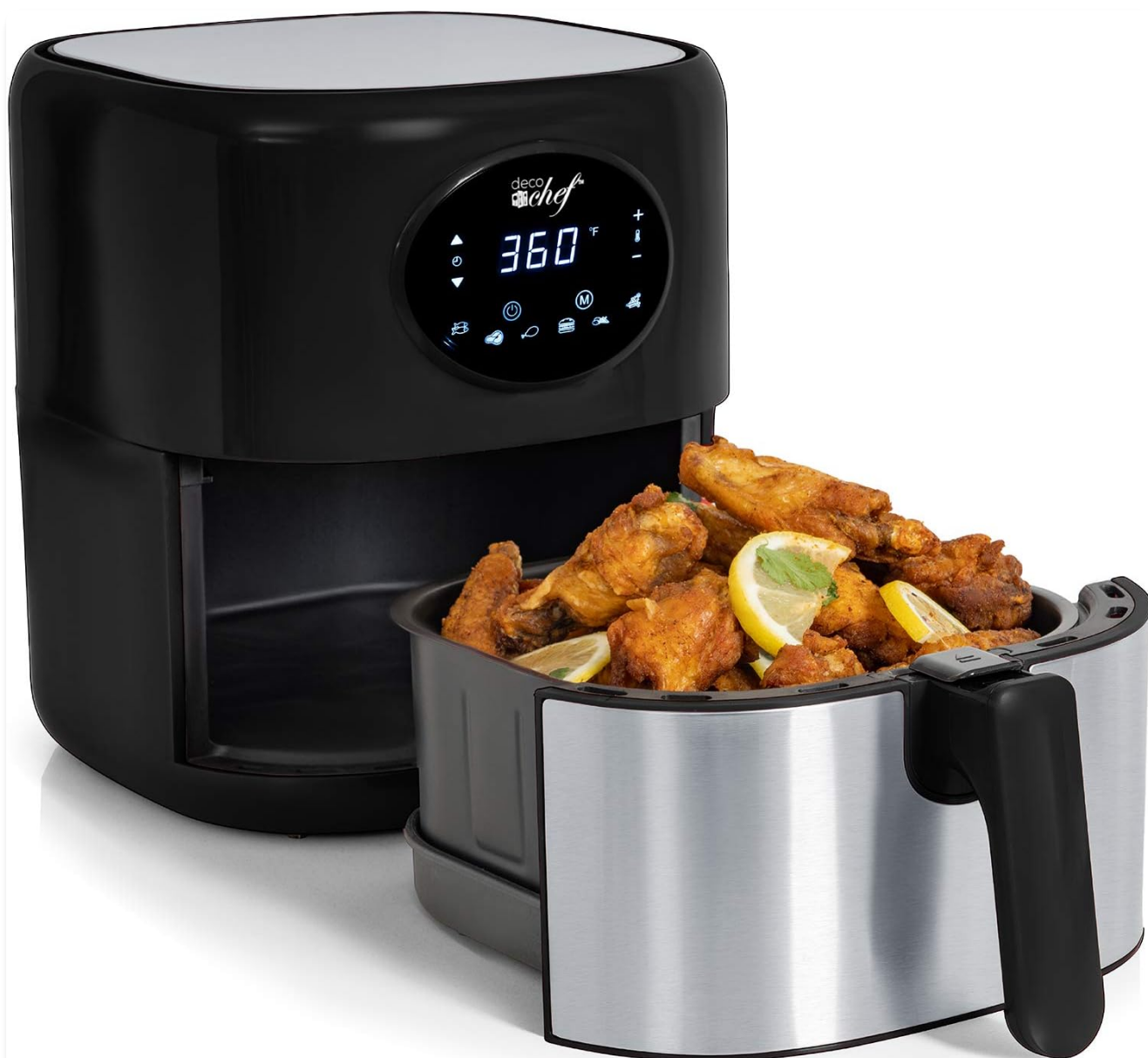
The Deco Chef 3.7QT Digital Air Fryer, showcasing its sleek design and a basket filled with perfectly air-fried chicken wings.