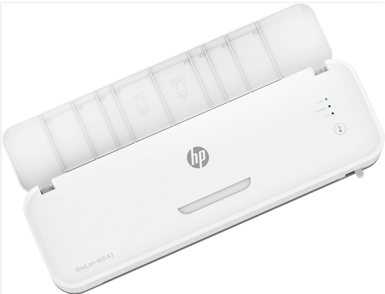
Image 4.1: Top view of the laminator showing controls and feed tray.