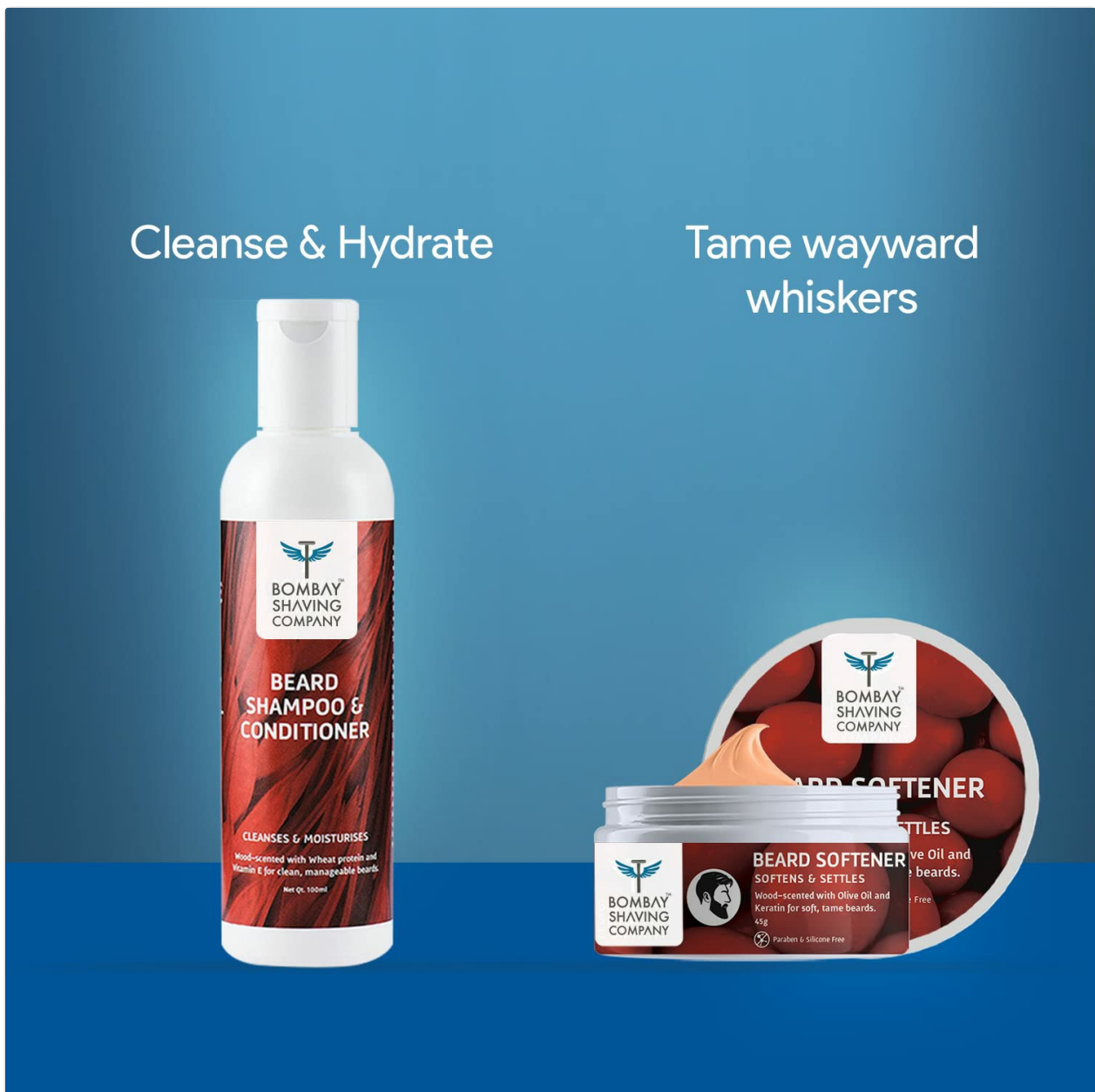
Image: Beard Shampoo & Conditioner for cleansing and hydrating, and Beard Softener for taming whiskers.