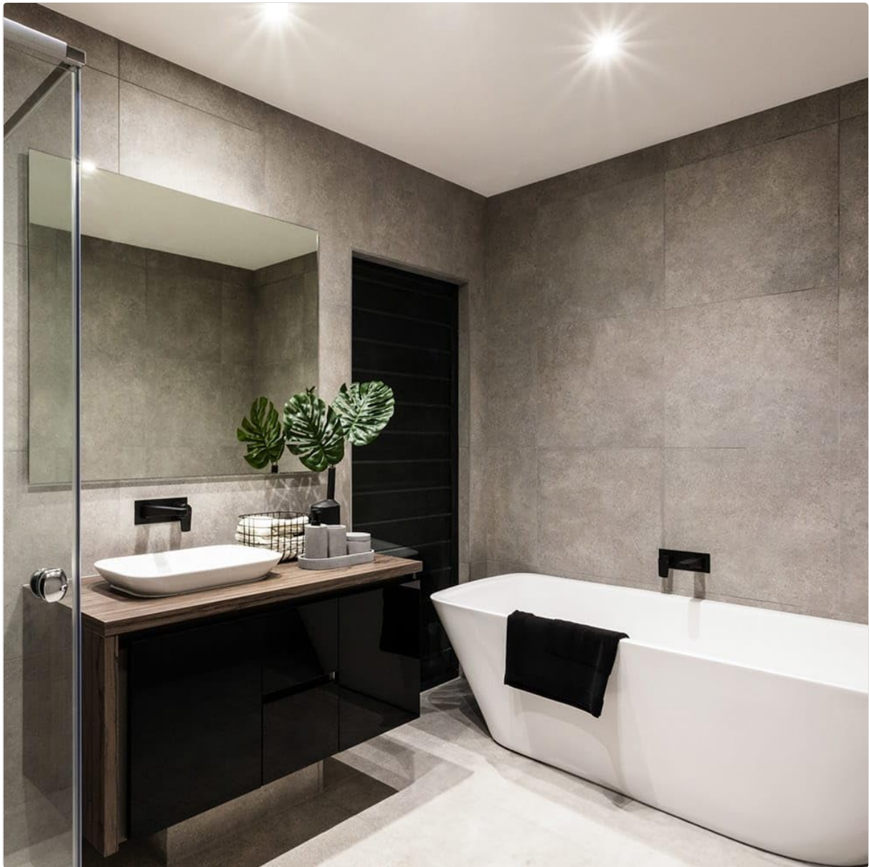
Image 1.1: HOFTRONIC Bari Dimmable LED Recessed Spotlights in a modern bathroom setting.