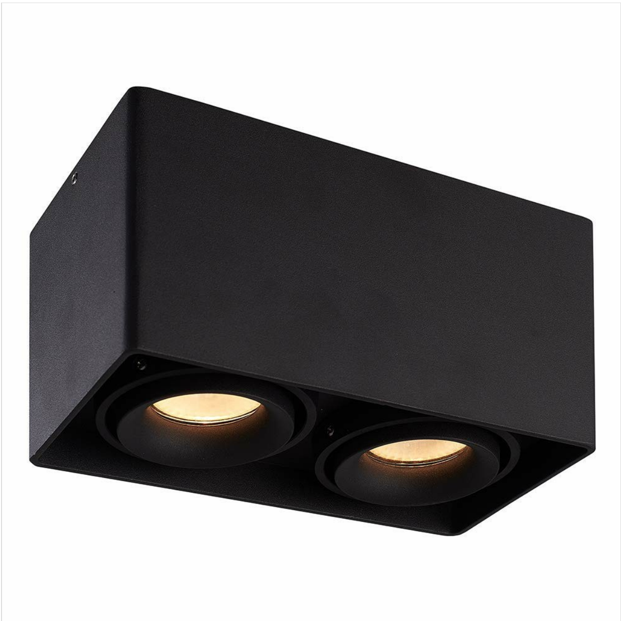
Image: The HOFTRONIC Esto 2-Light GU10 Black LED Spotlight installed on a ceiling, providing illumination in a modern interior setting.