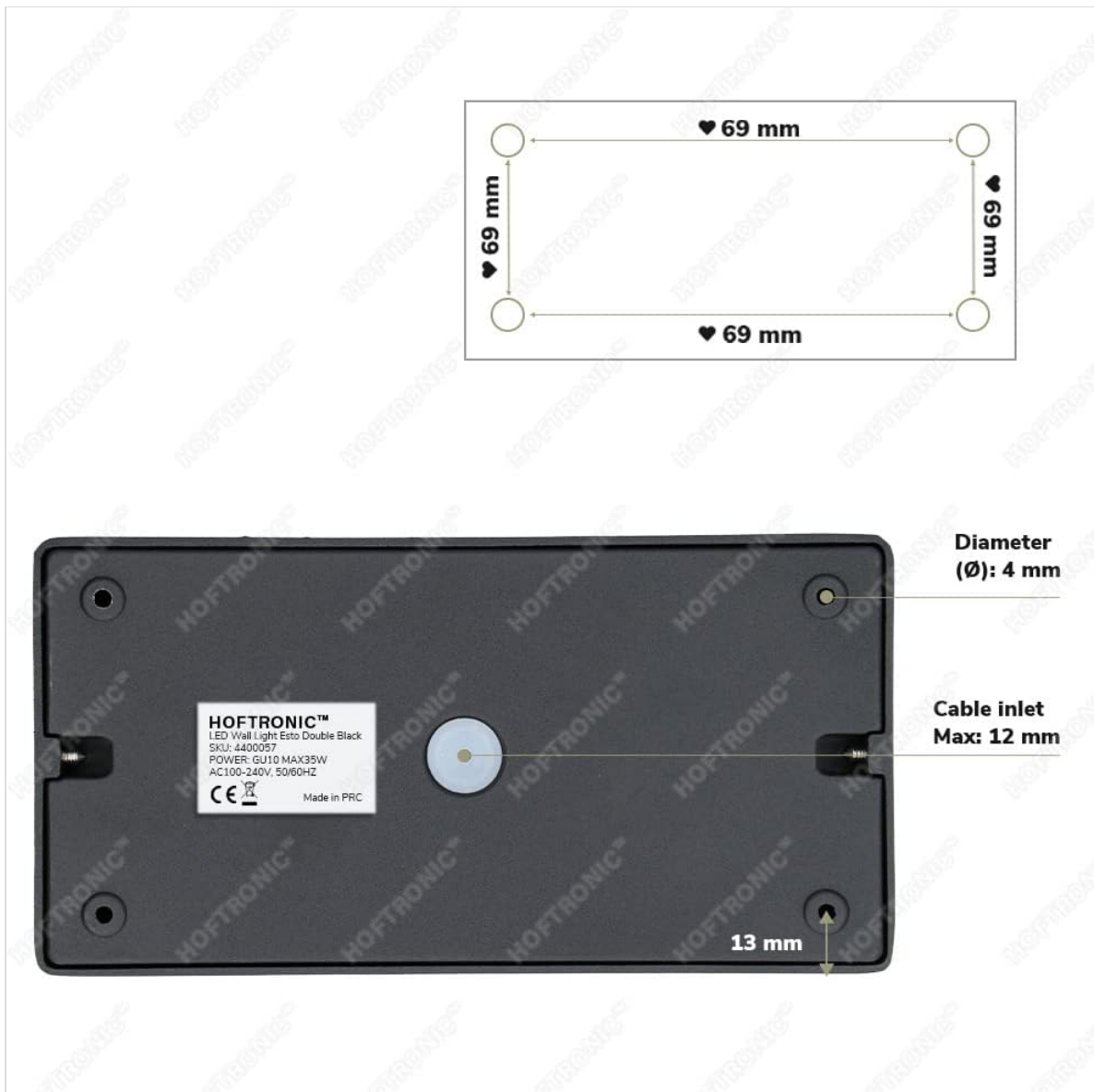
Image: Detailed diagram of the spotlight's base with mounting hole dimensions (69mm x 69mm spacing, 4mm diameter holes, 13mm edge distance, max 12mm cable inlet).