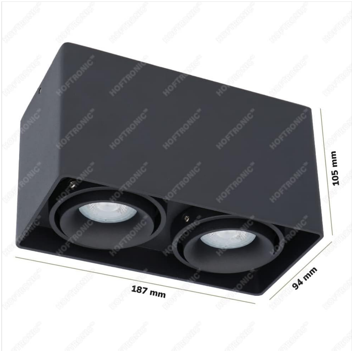
Image: Overall dimensions of the HOFTRONIC Esto 2-Light GU10 Black LED Spotlight.