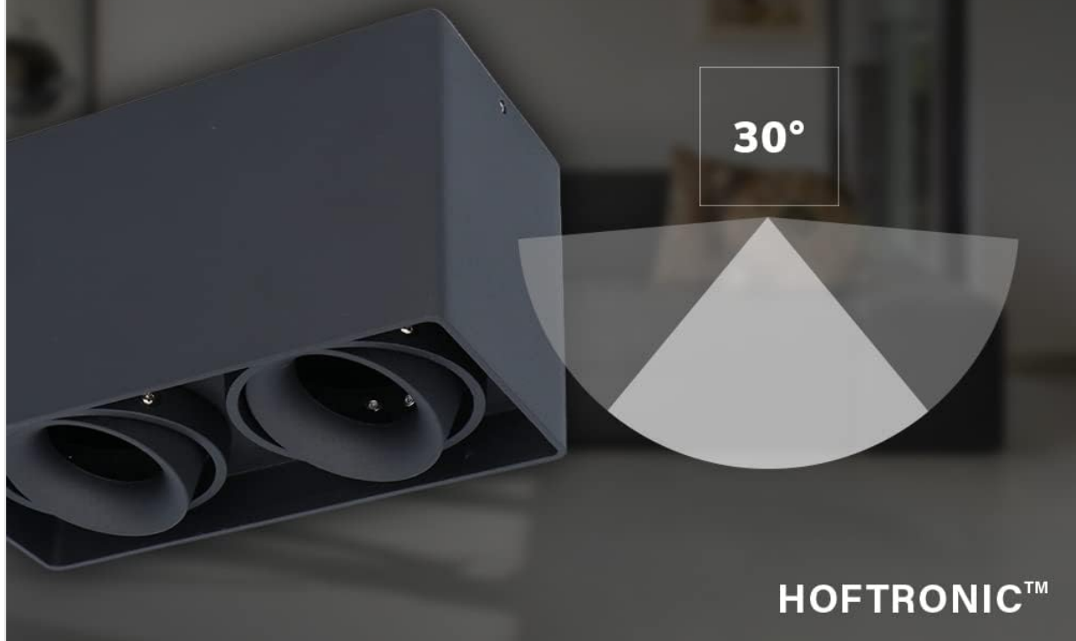
Image: Illustration of the adjustable light direction, demonstrating the 30-degree tilt capability of the GU10 fittings.

the tiltable GU10 fitting allows you to direct the light the way you want. Achieve your ideal design.