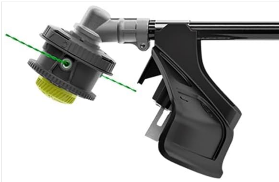
Figure 2: Trimmer head and guard assembly. This image illustrates the trimmer head with the guard attached, showing the cutting line exiting the head.