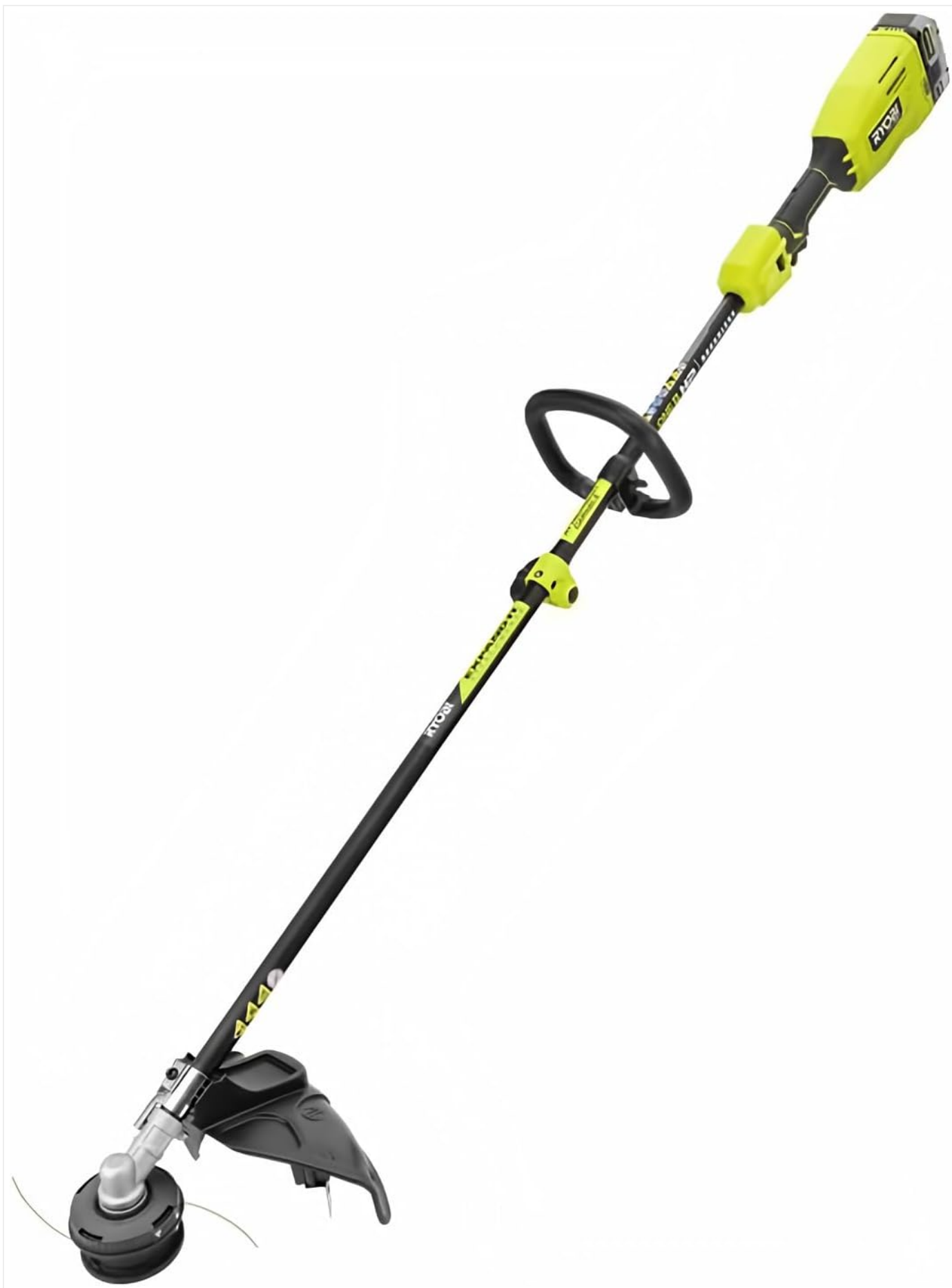
Figure 1: RYOBI 40-Volt HP Brushless String Trimmer. This image shows the complete string trimmer unit, highlighting its carbon fiber shaft and overall design.