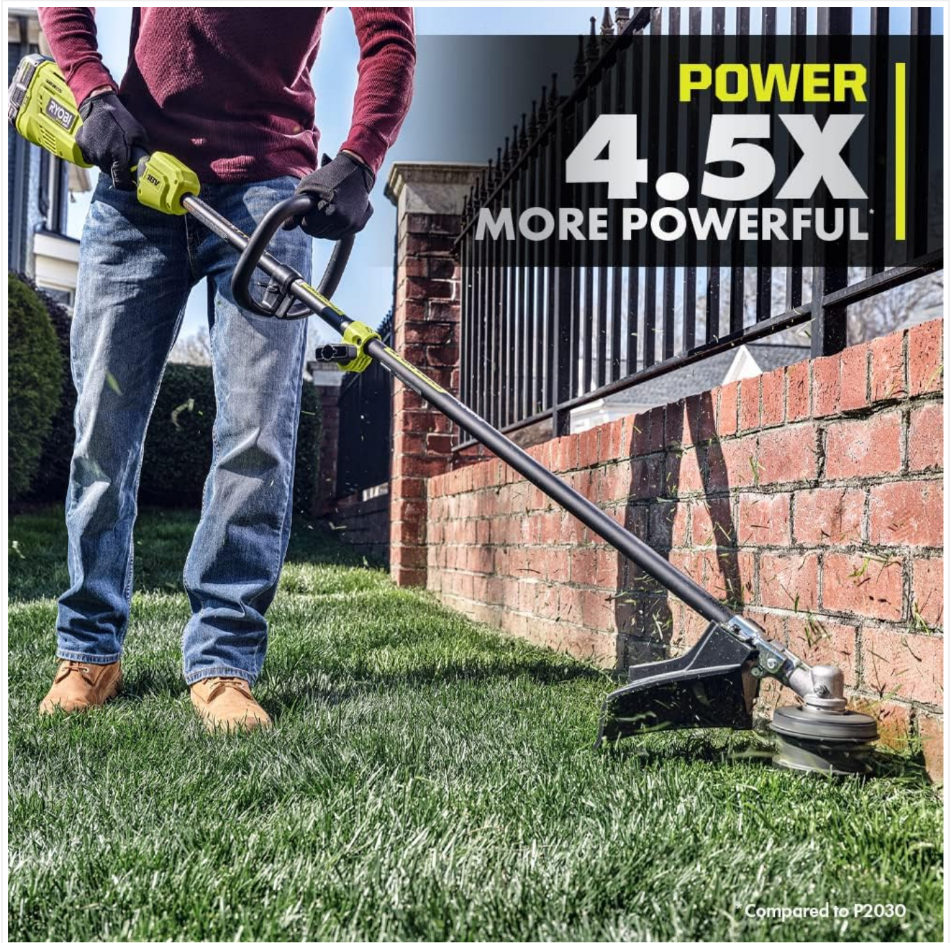
Figure 5: Person using RYOBI string trimmer for edging. This image shows a user operating the trimmer to create a clean edge along a brick wall, demonstrating its power and maneuverability.