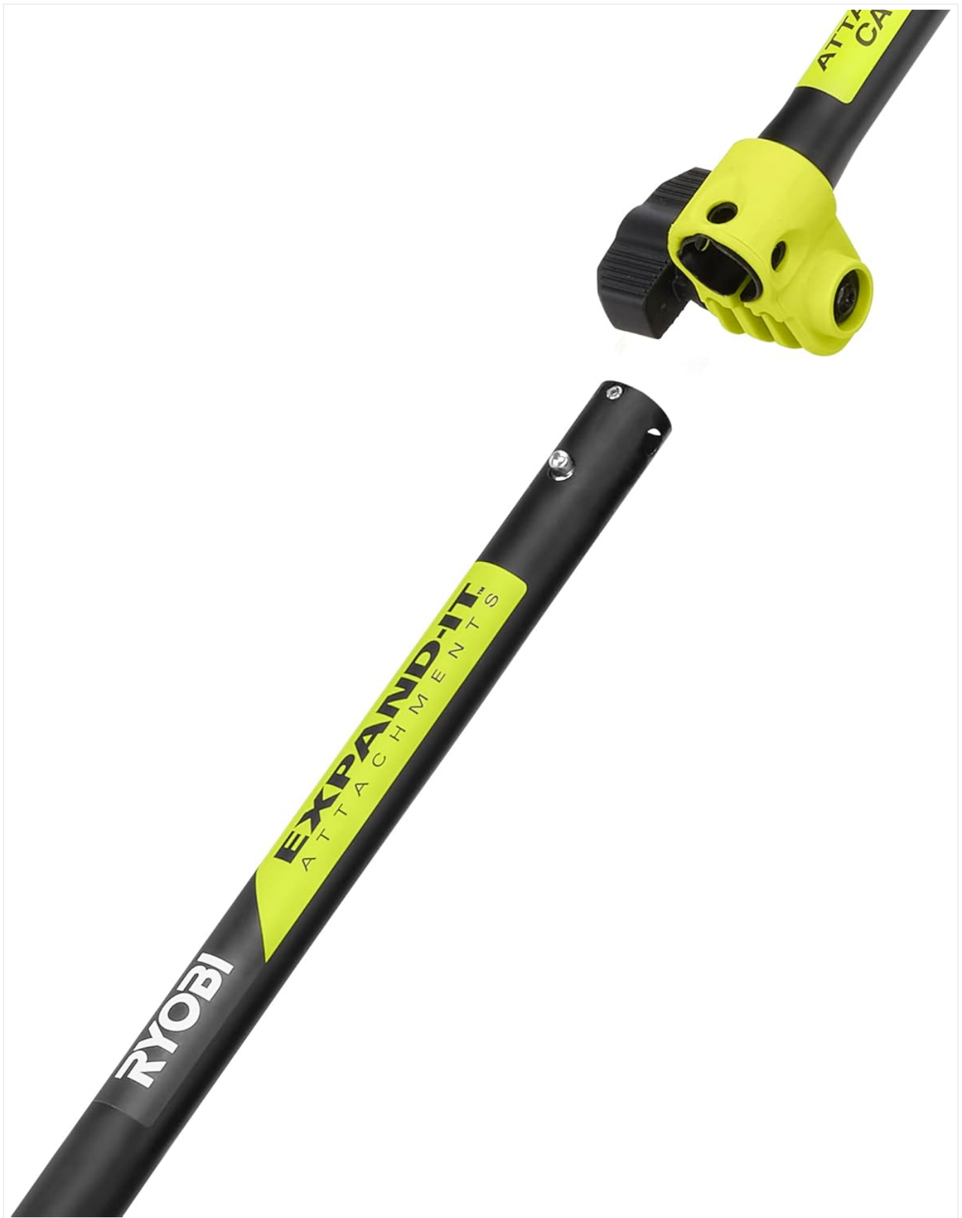
Figure 3: RYOBI Expand-It attachment connection. This image shows the mechanism for connecting and disconnecting Expand-It attachments to the trimmer's carbon fiber shaft.