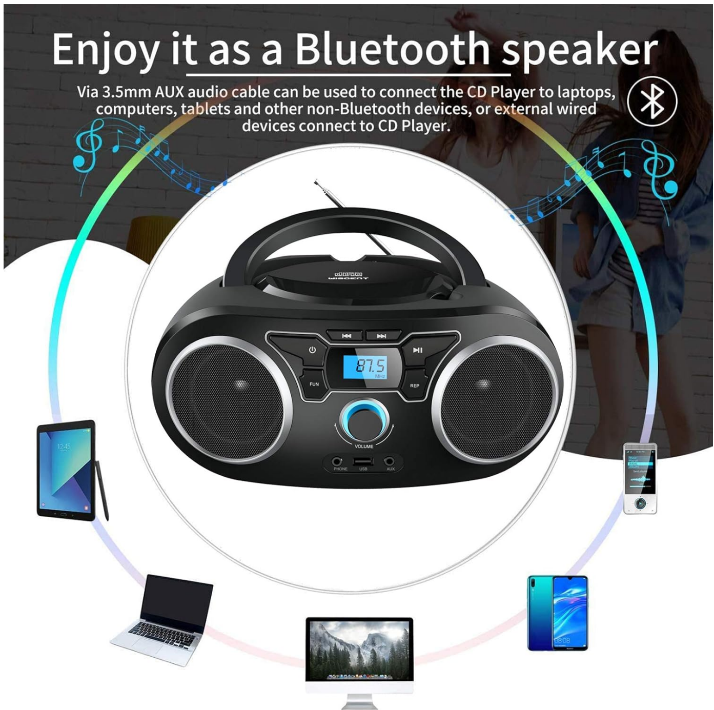
Image: Close-up of the front panel, showing the USB port, AUX input, and headphone jack.