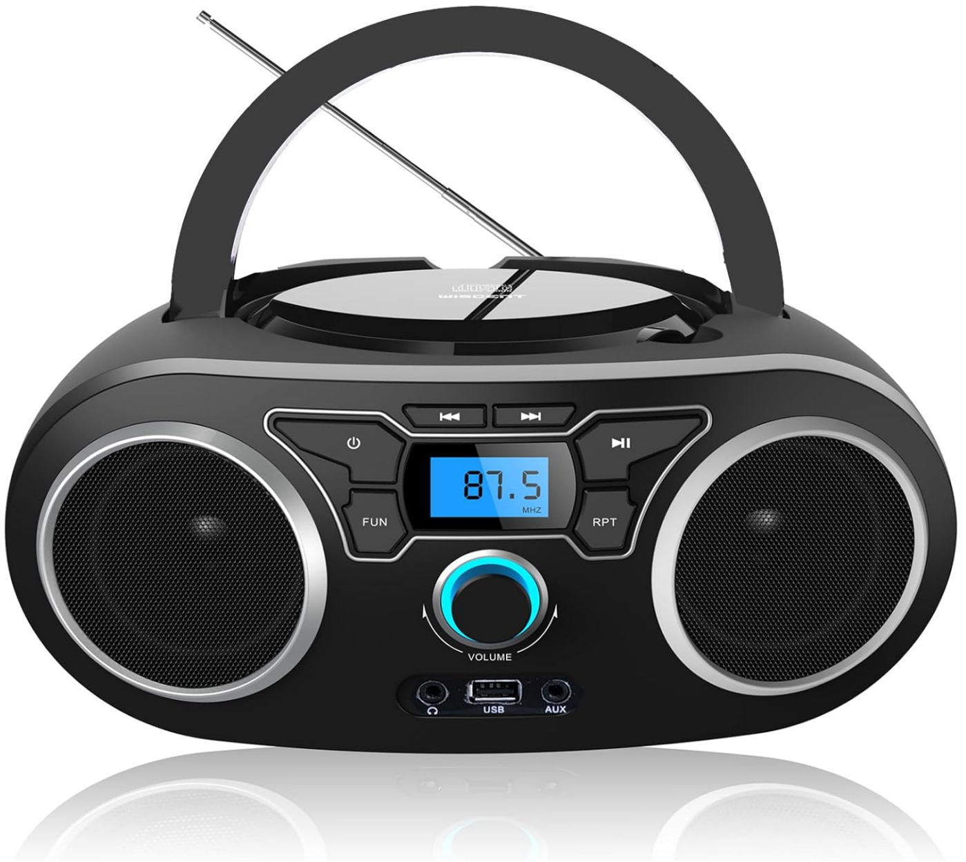
Image: Front view of the WIITHINK Portable CD Boombox WTB771, black color, showing the display, control buttons, speakers, and handle.