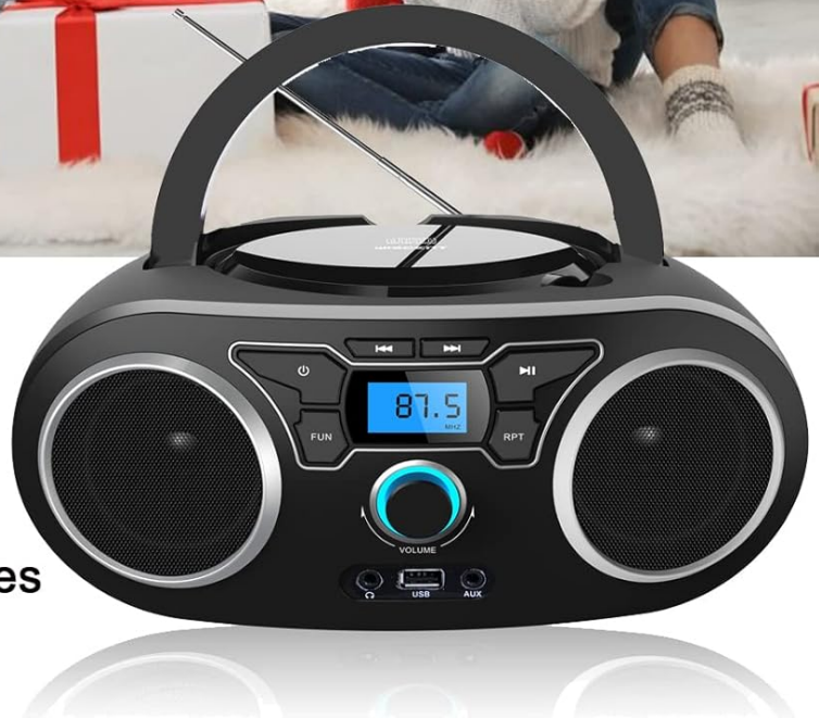
Image: Top-down view of the boombox, showing the CD compartment, control buttons, and volume knob.