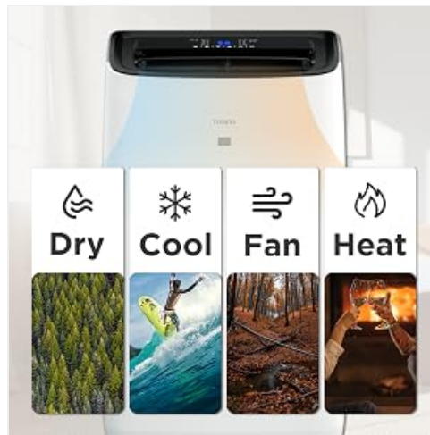
Image: The TURBRO Greenland Portable AC highlighting its 4 modes for year-round comfort and convenient features like auto swing air vent and backlit remote.