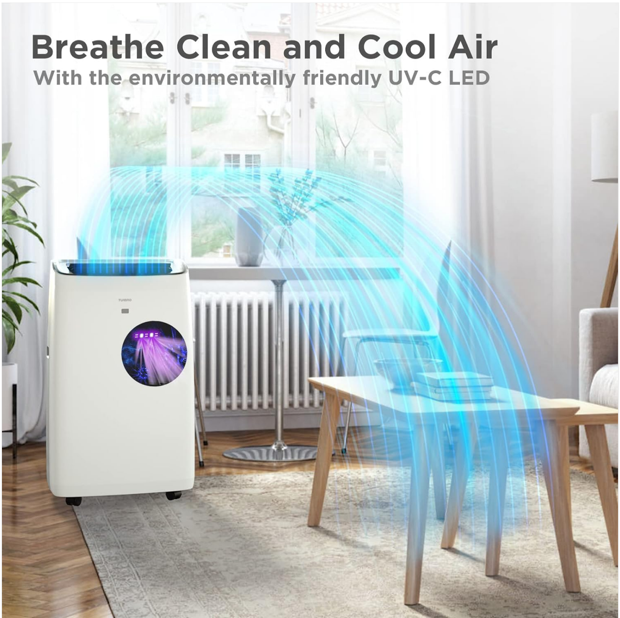
Image: The portable AC unit actively cleaning the air with its UV-C light function, promoting a healthier indoor environment.