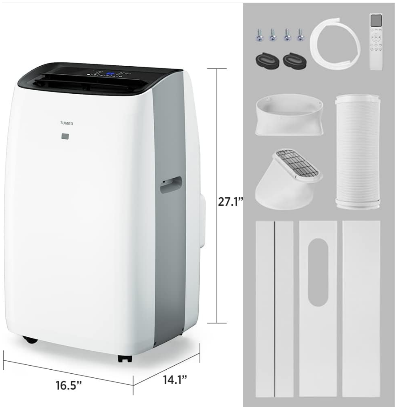
Image: A visual representation of the portable AC unit and its complete set of accessories for installation and operation.