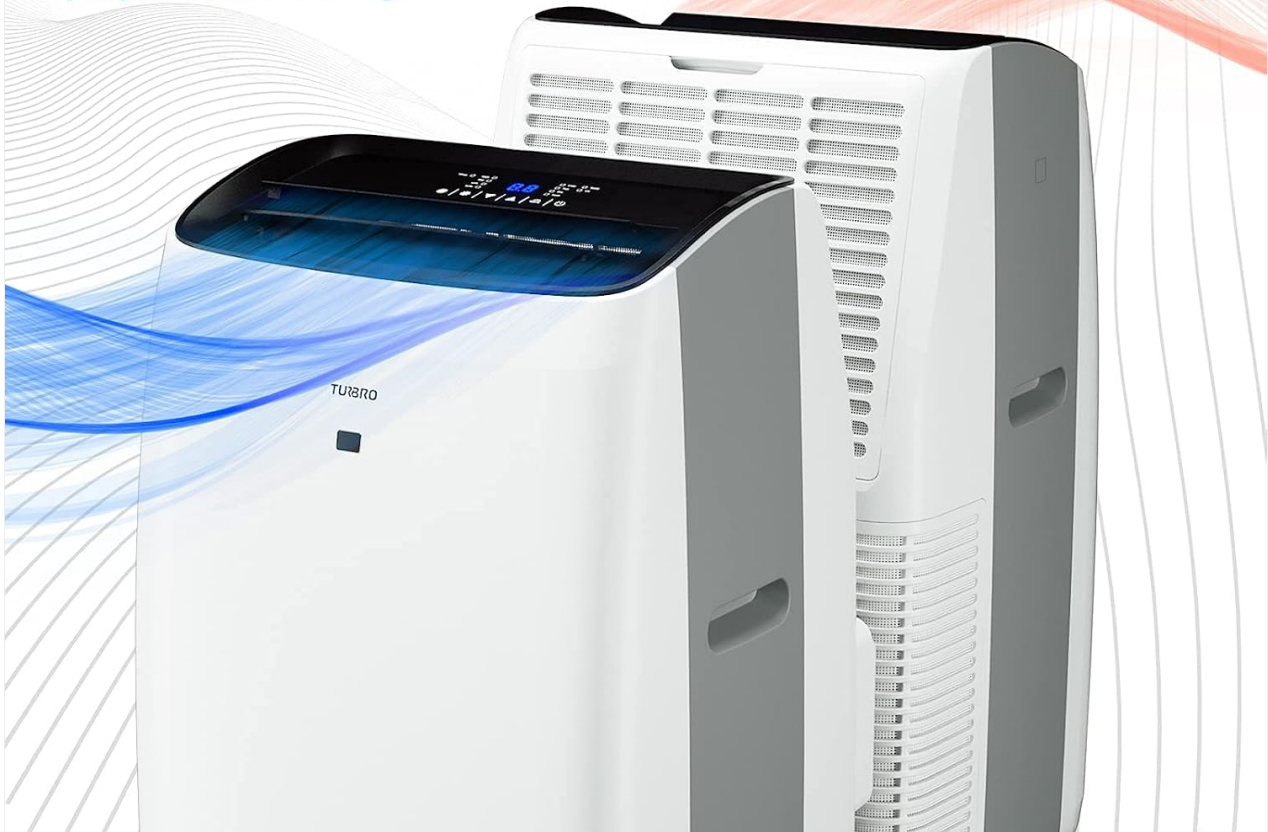
Image: The TURBRO Greenland Portable AC demonstrating its impressive climate control with 14,000 BTU cooling and 13,300 BTU heating capabilities.