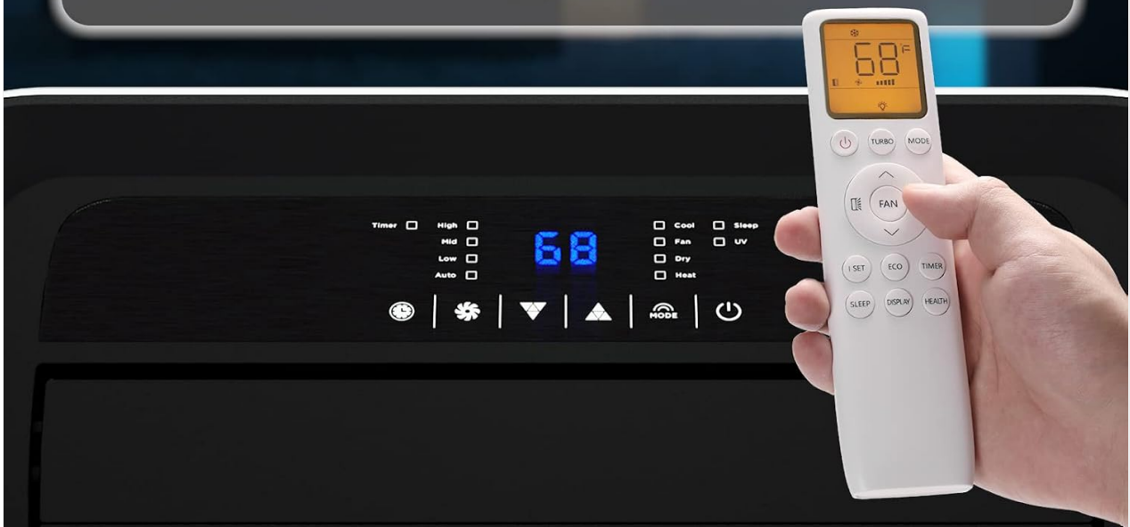
Image: The unit's control panel and remote control, illustrating the various functions and settings.