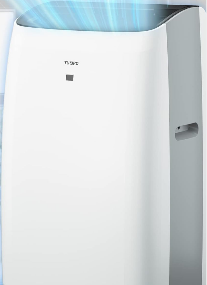
Image: Front view of the TURBRO Greenland Portable Air Conditioner.