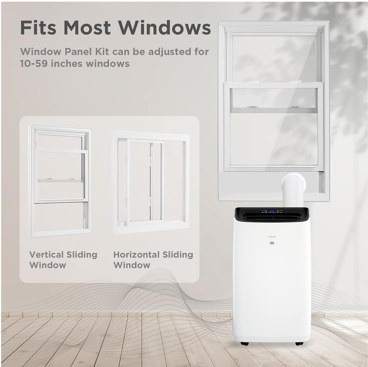
Vertical Sliding Window

Window Panel Kit can be adjusted for 10-59 inches windows