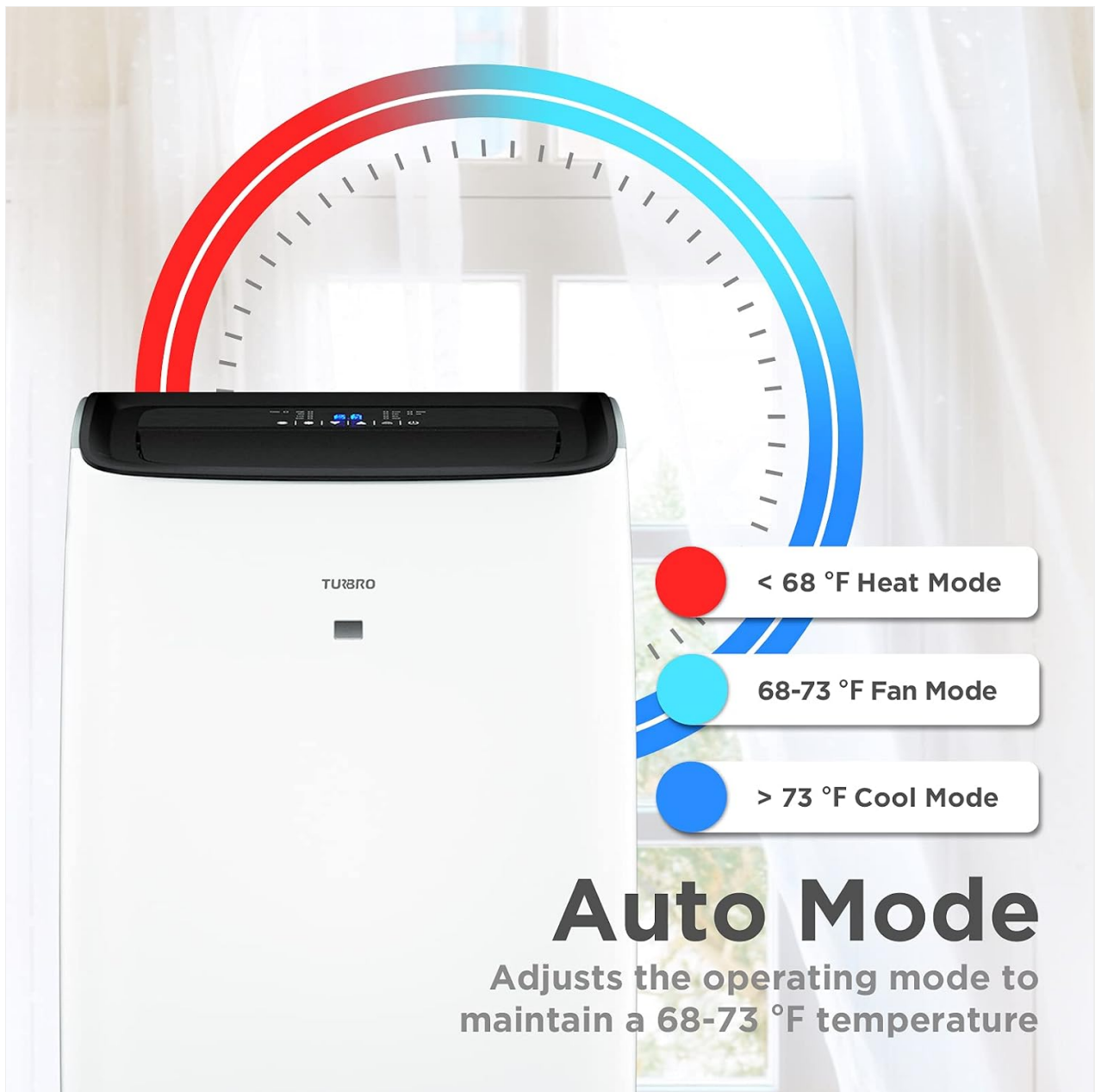
Image: Explanation of the Auto Mode, which adjusts the operating mode to maintain a stable temperature between 68-73°F.