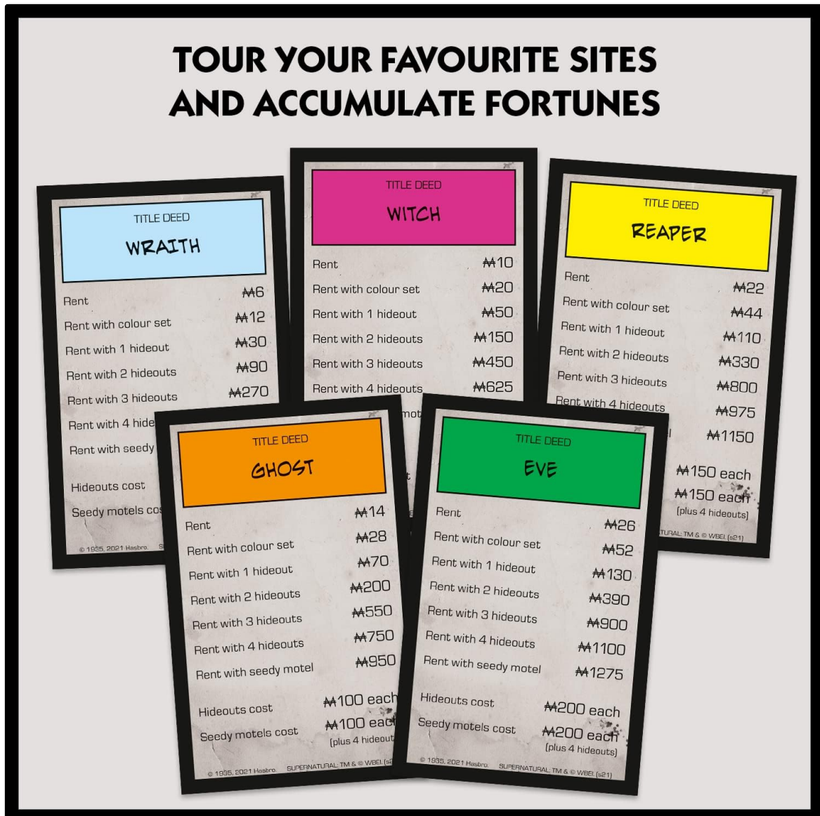
Image 3.1: Example Title Deed cards, featuring properties themed to creatures and characters from Supernatural.