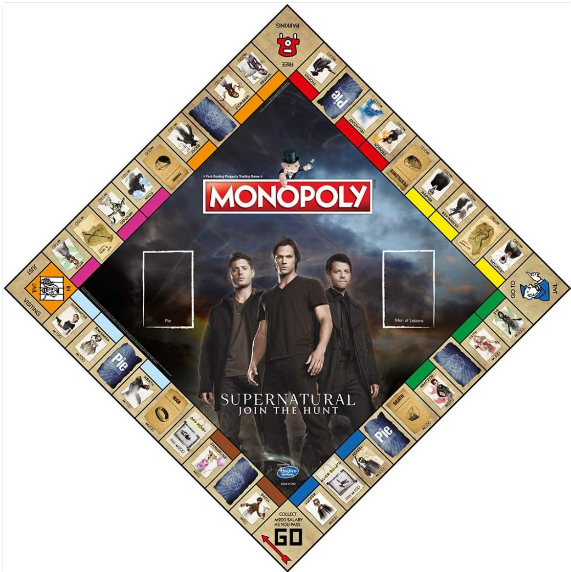
Image 2.1: The Supernatural Monopoly game board, ready for play with spaces themed to the show.