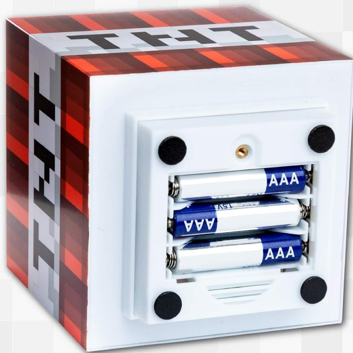
Figure 2: Battery compartment located on the underside of the light. Requires 3 AAA batteries.