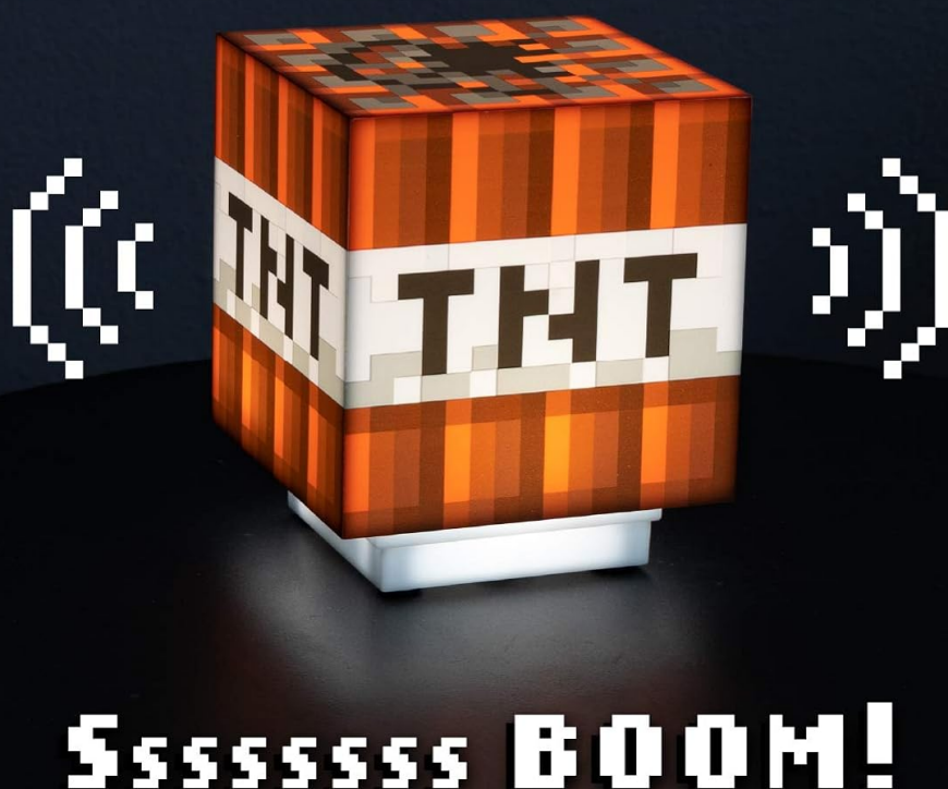
Figure 3: The TNT Light illuminates and produces sound when pressed.