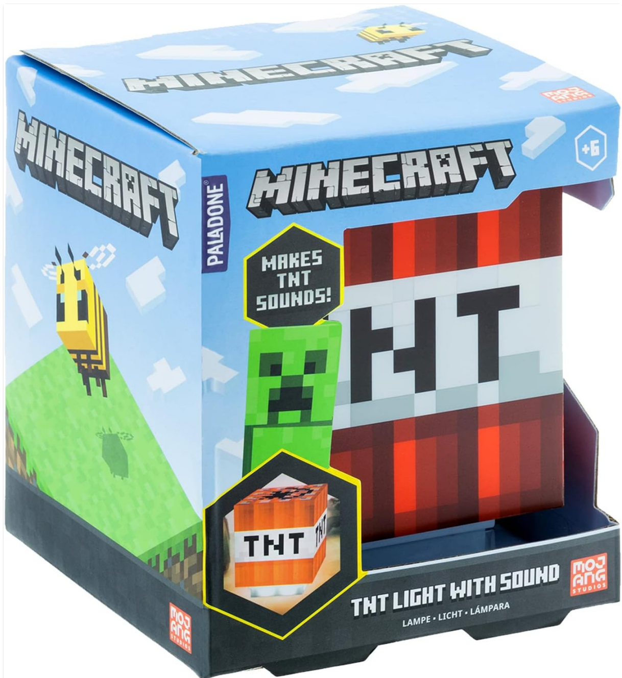
Figure 1: The Minecraft TNT Light in its retail packaging.