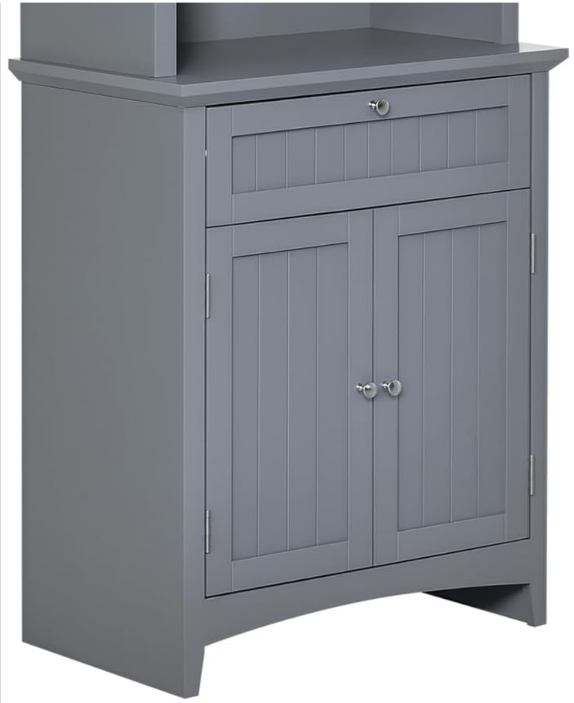
Image: The HOMCOM Elegant Buffet with Hutch, a grey storage cabinet featuring an upper hutch with framed glass doors, a central drawer, and lower cabinet doors.