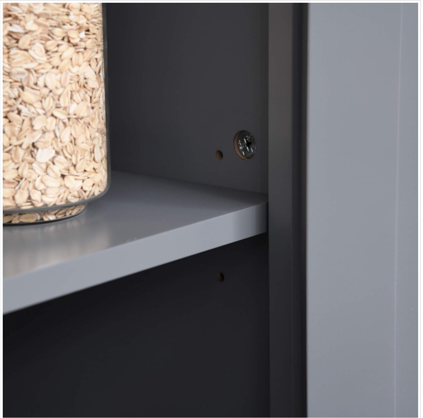
Image: A detailed view of the adjustable shelf mechanism inside the cabinet, showing the peg holes for height customization.