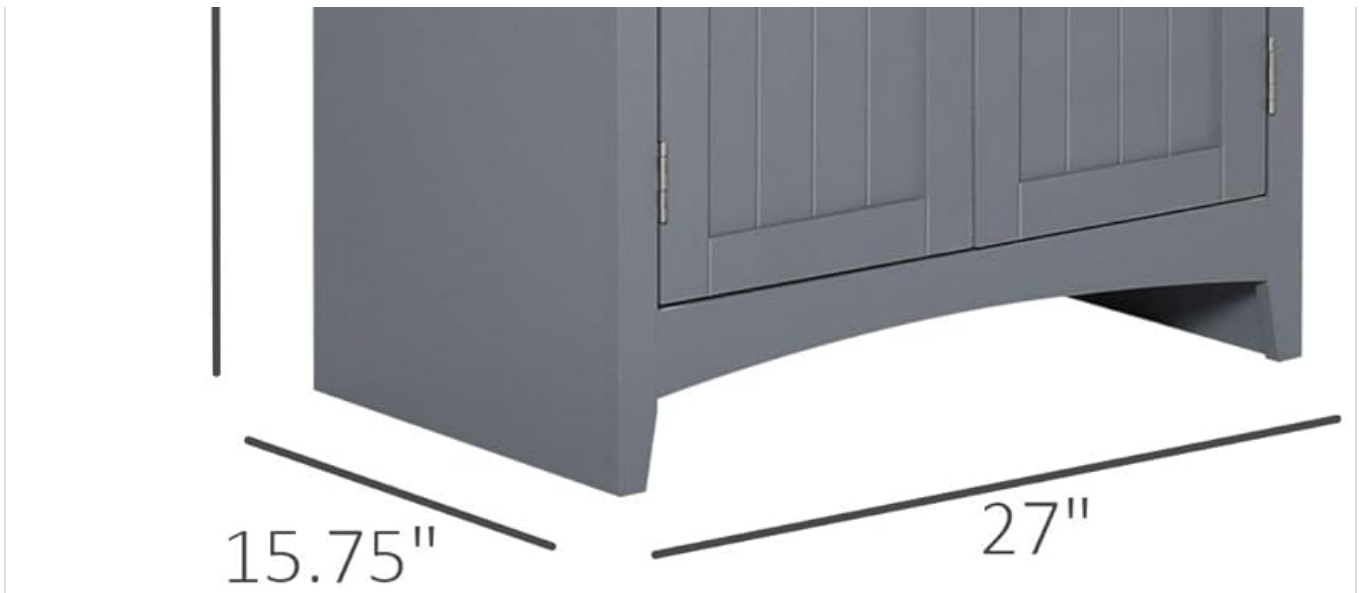
Image: A diagram illustrating the overall dimensions of the cabinet: 27 inches wide, 15.75 inches deep, and 64.5 inches high.