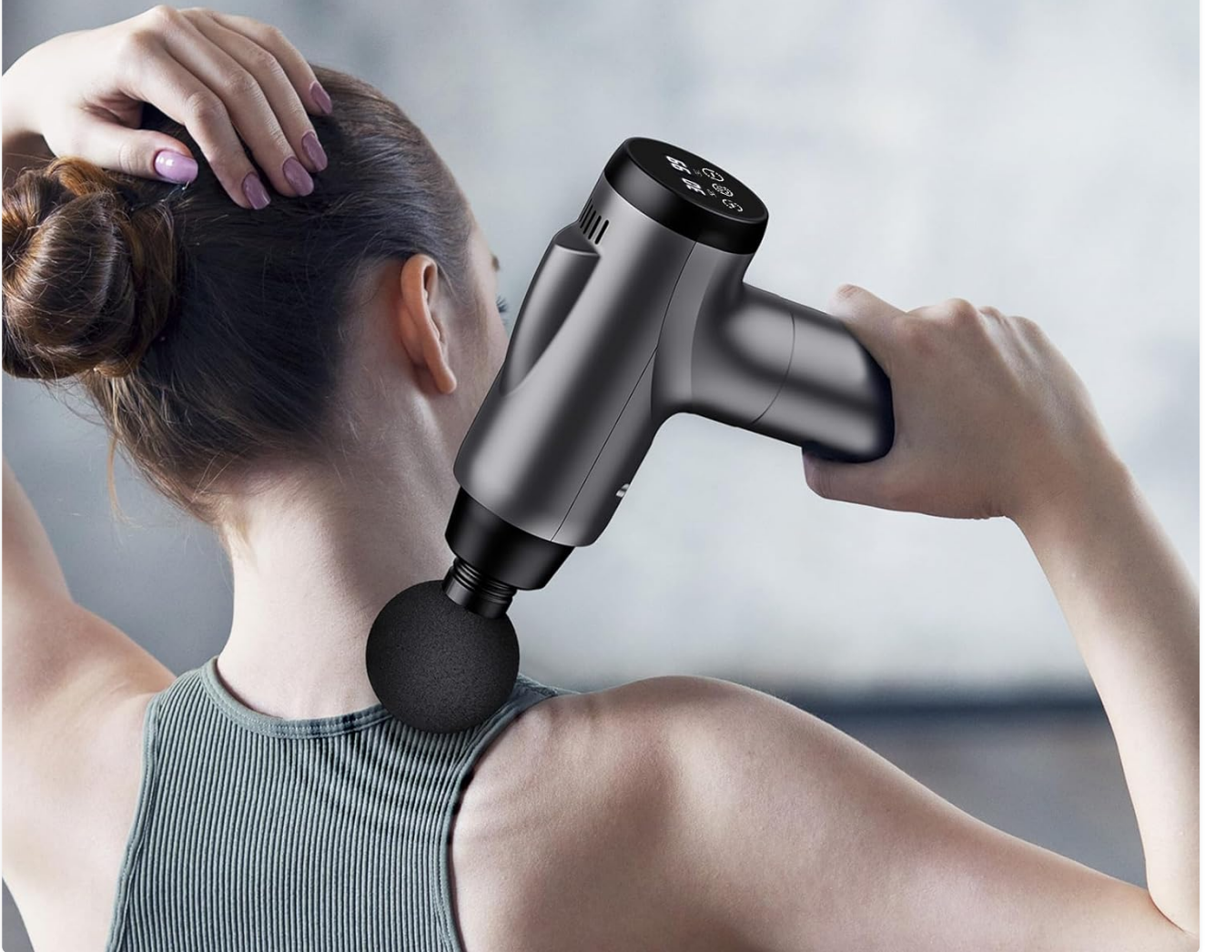
Image: A woman using the massage gun on her shoulder, illustrating the 12mm deep amplitude for muscle soreness relief.

Quickly Relieve Muscle Soreness and Relax Full Body