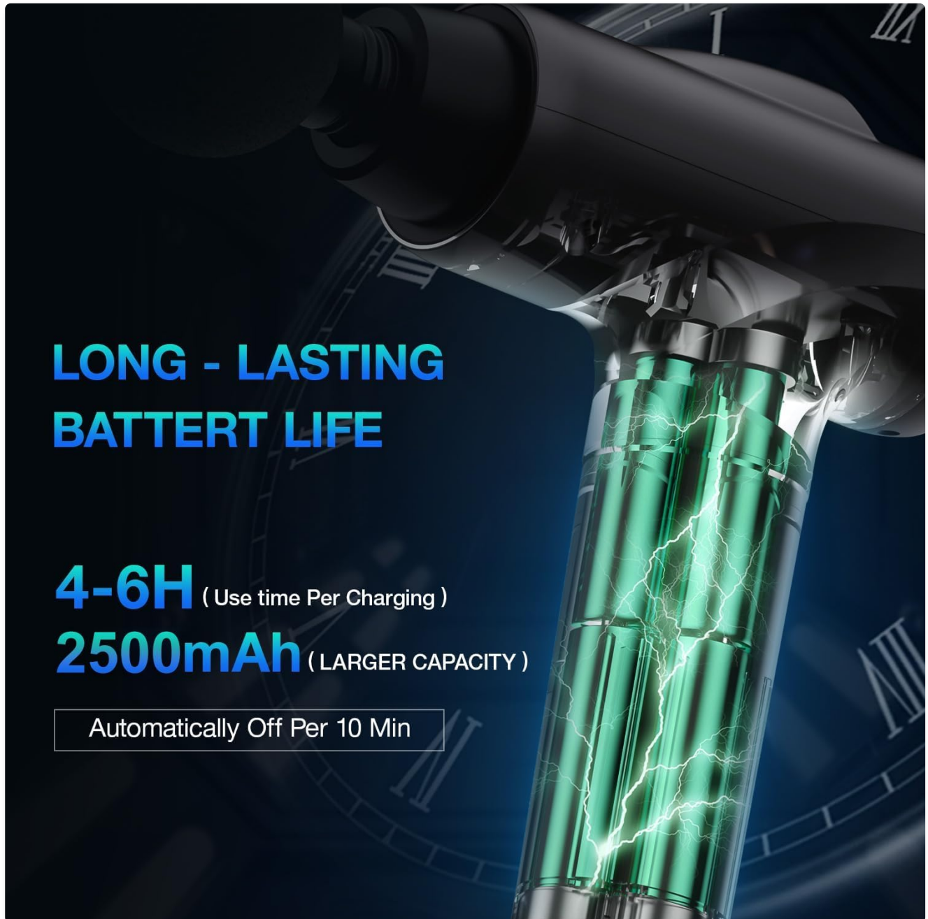
Image: Illustration of the massage gun's long-lasting 2500mAh battery, providing 4-6 hours of use per charge.

Before initial use, ensure the device is fully charged. The massage gun is equipped with a rechargeable Lithium Ion battery. Connect the provided charging cable to the USB-C port located at the bottom of the handle. The smart LED display will indicate the current battery percentage, allowing you to monitor charging progress.