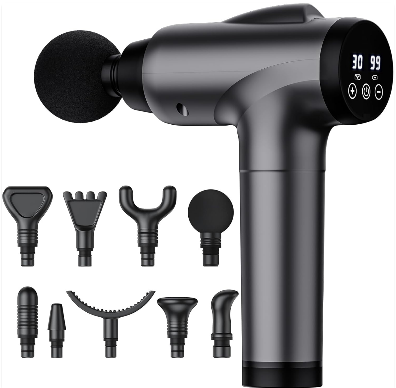
Image: The OLsky Deep Tissue Massage Gun shown with its full set of 9 interchangeable massage heads.