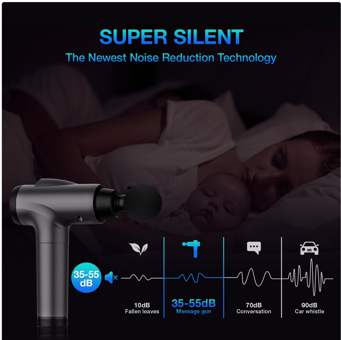
Image: A visual representation of the massage gun's low noise level compared to other common sounds.

The OLsky Massage Gun is designed for quiet operation, ensuring a relaxing experience without excessive noise. Its noise reduction technology keeps sound levels between 35-55dB, comparable to a quiet conversation.