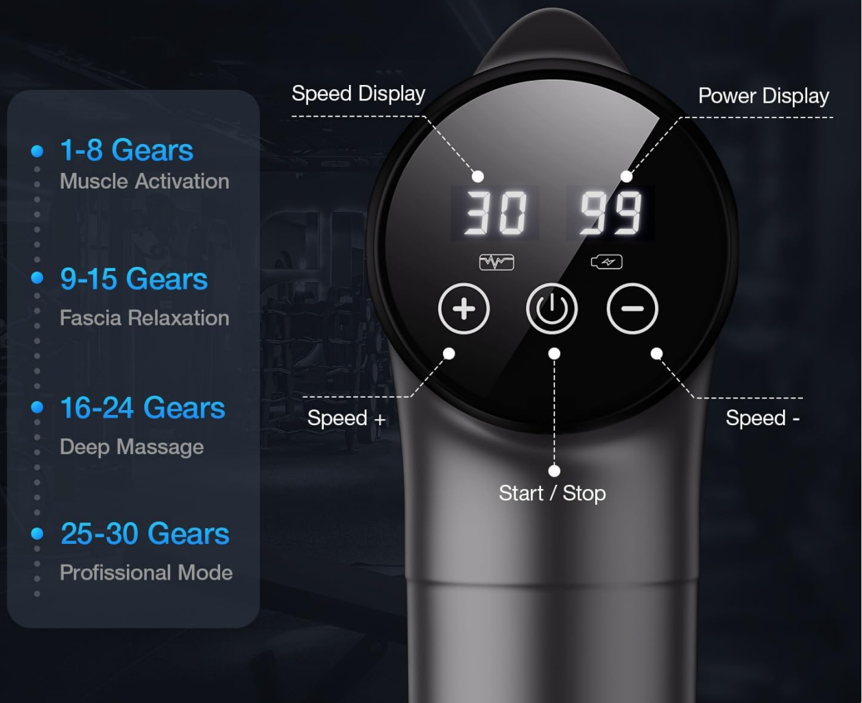
Image: Close-up of the massage gun's LCD touch screen display, detailing speed and power indicators.