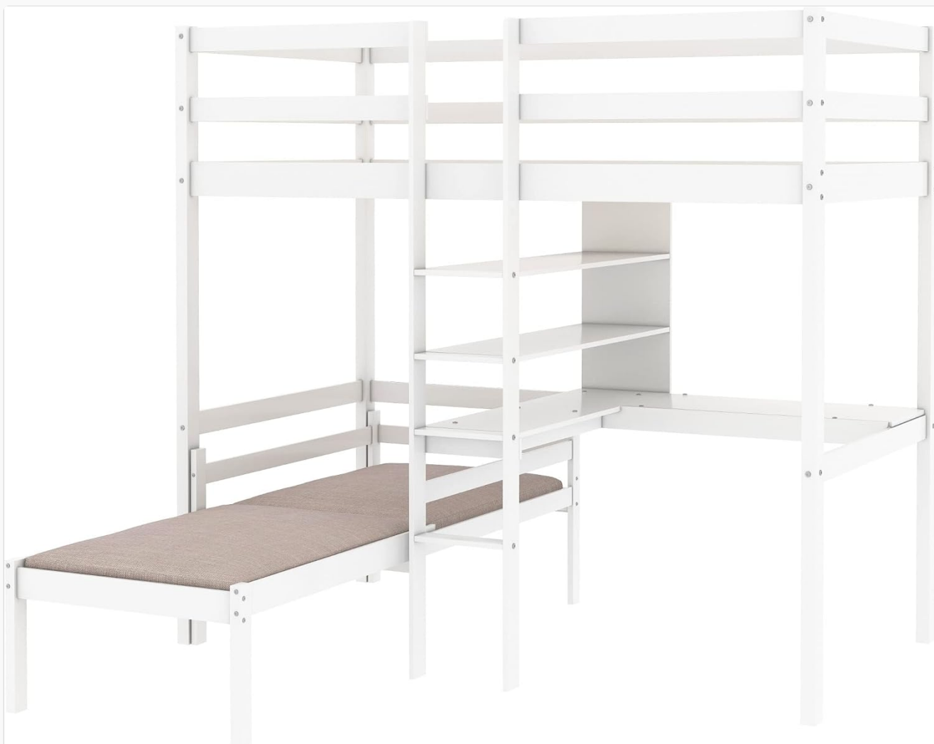
Image: Angled view of the Flieks bunk bed, illustrating the integrated desk, shelves, and the trundle bed in its extended position. This view highlights the multi-functional design of the furniture.