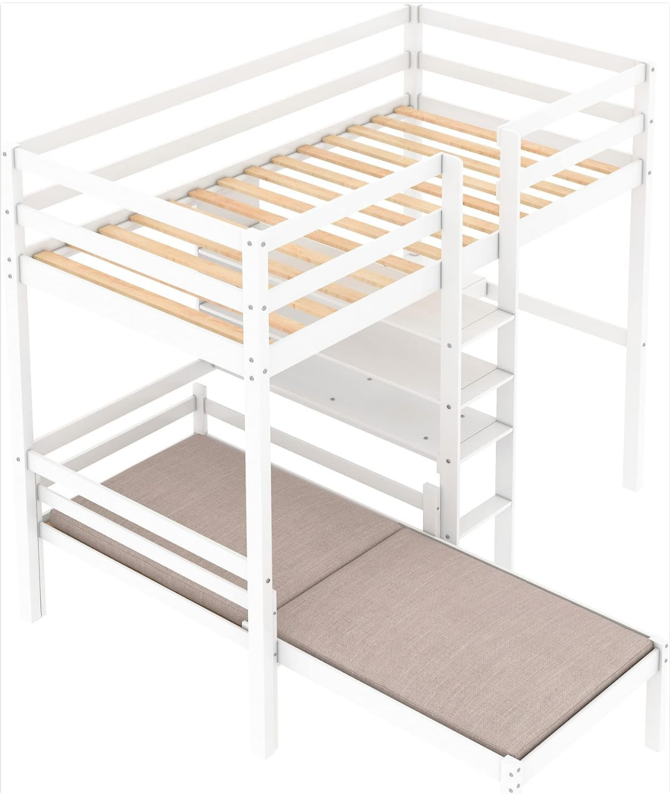
Image: The Fliex bunk bed with the trundle bed fully extended, showcasing the wooden slats that support the mattresses on both the upper and lower bunks. This image demonstrates the bed's readiness for use.