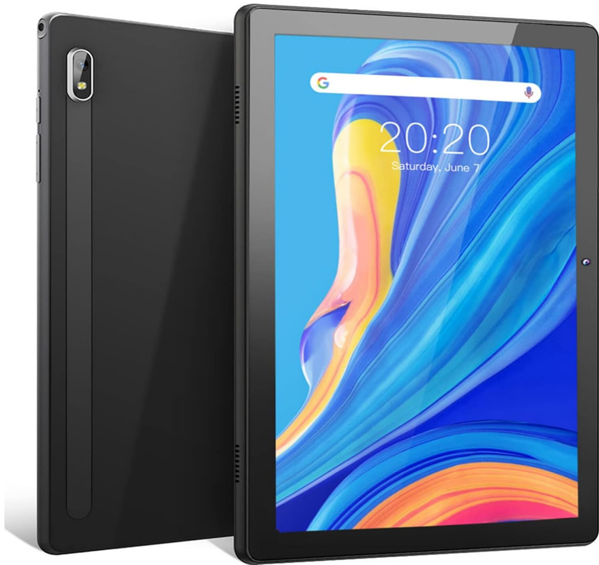
Image: Front and back view of the MARVUE Pad M10 Tablet, showcasing its sleek design.

Your browser does not support the video tag.