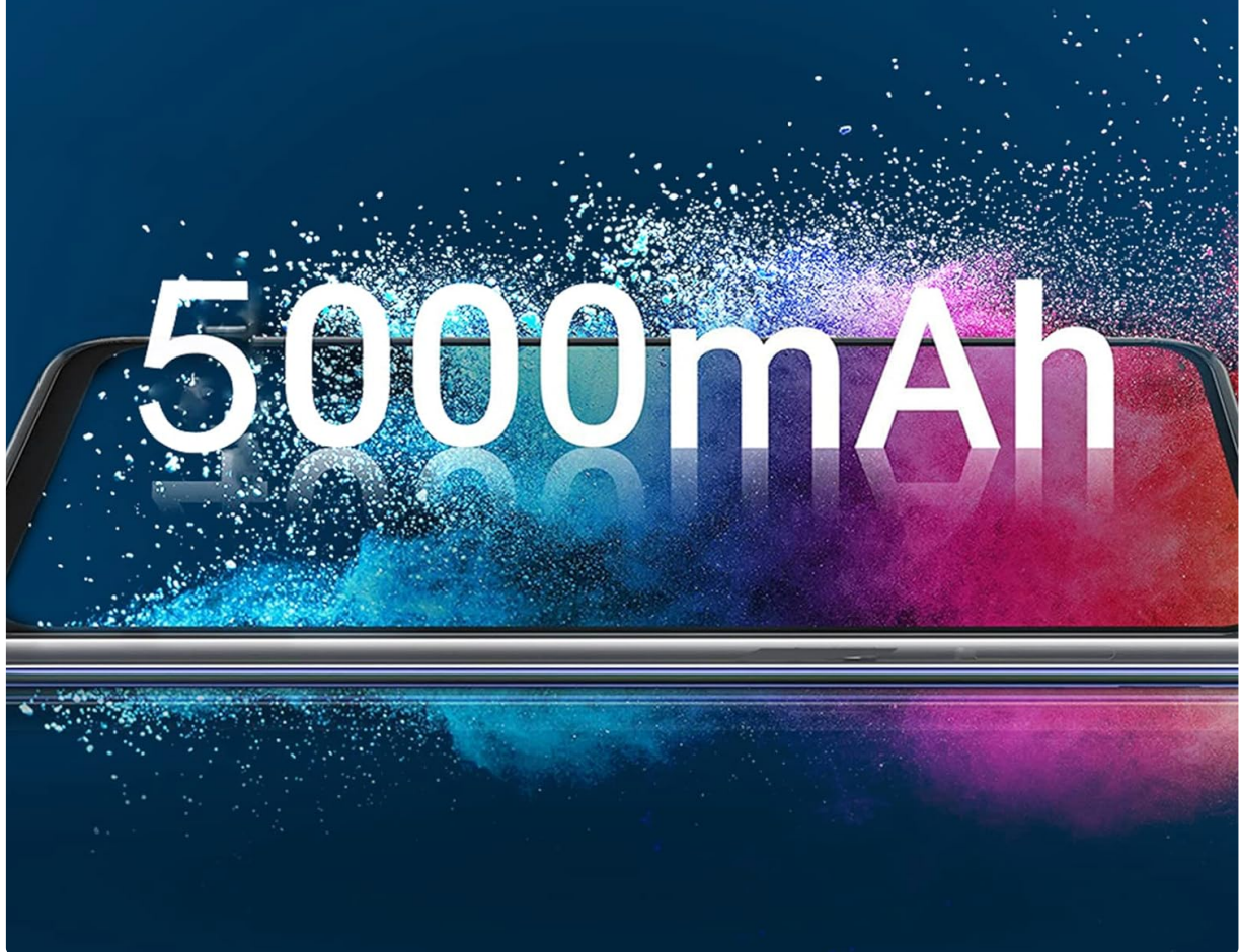
Image: The MARVUE Pad M10 Tablet screen prominently displaying "5000mAh" to highlight its battery capacity, along with text indicating up to 6 hours of entertainment.