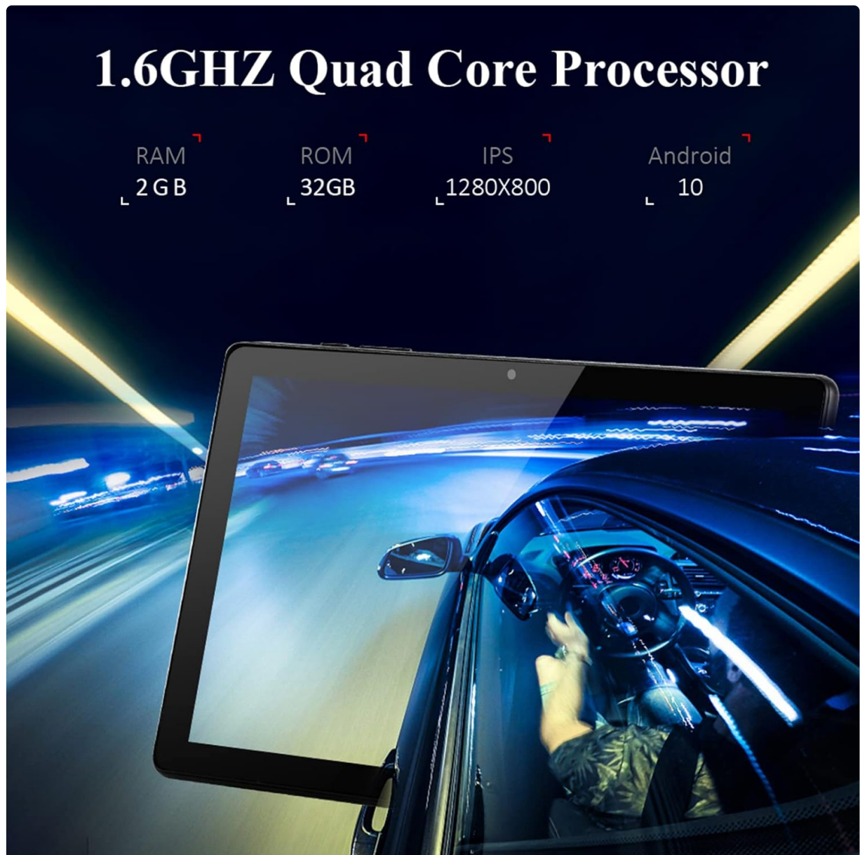
Image: The MARVUE Pad M10 Tablet displaying a racing game, emphasizing its 1.6GHz Quad-Core Processor, 2GB RAM, 32GB ROM, and IPS display for an enhanced user experience.