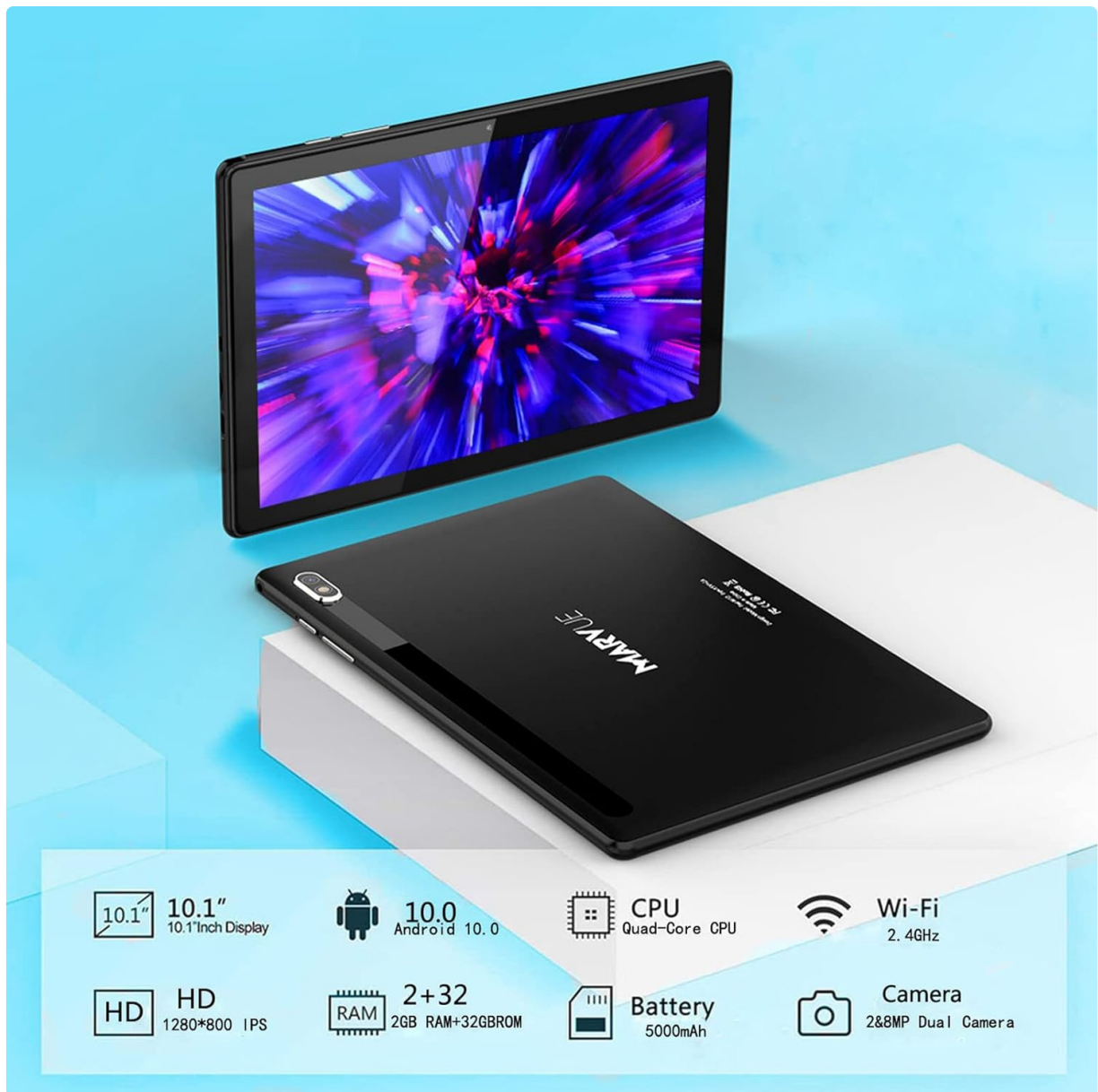
Image: The MARVUE Pad M10 Tablet with an overlay of its main specifications, including screen size, operating system, processor, Wi-Fi, RAM, ROM, battery capacity, and camera details.