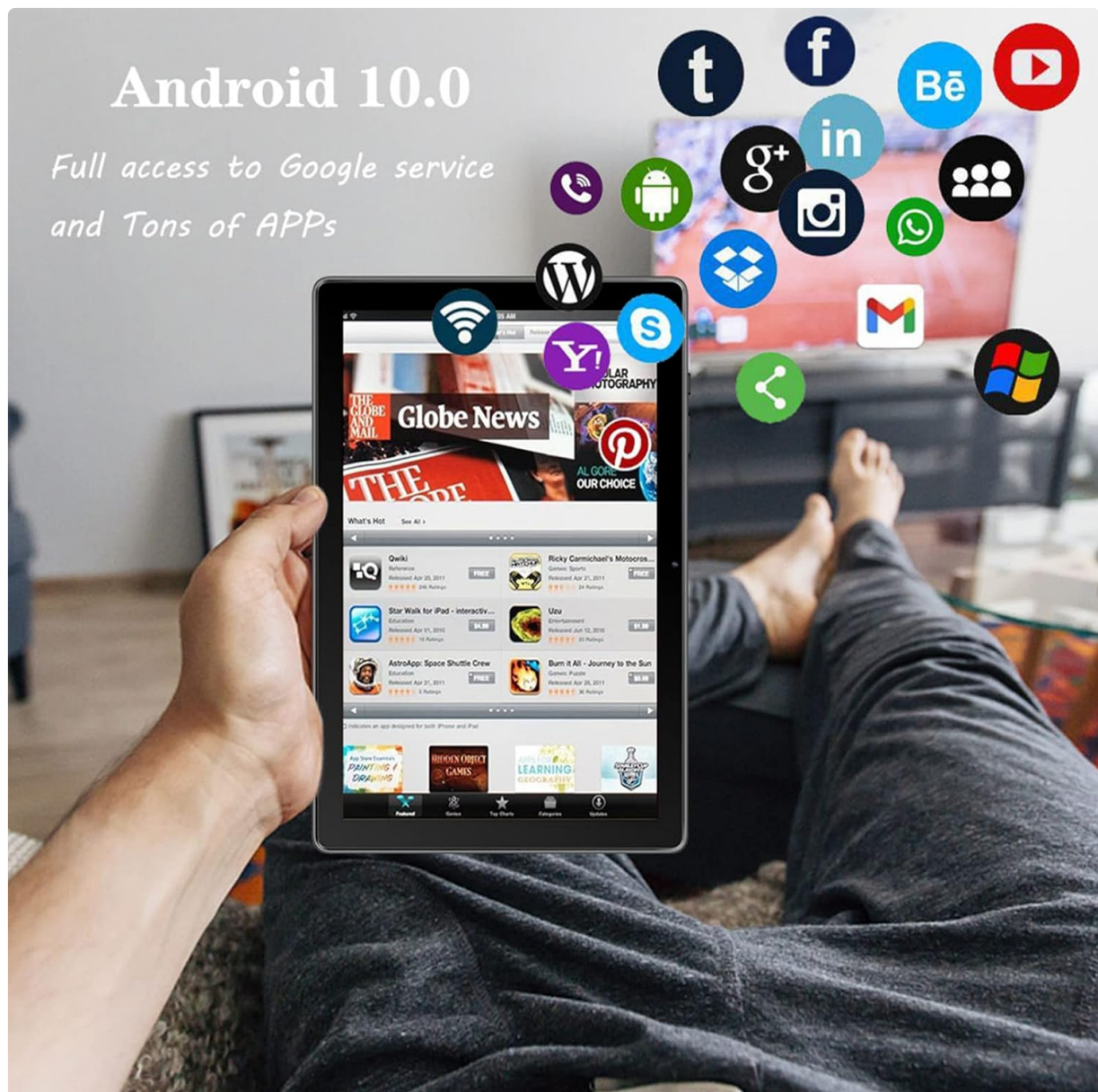
Image: The MARVUE Pad M10 Tablet screen prominently displaying the Android 10 interface with various application