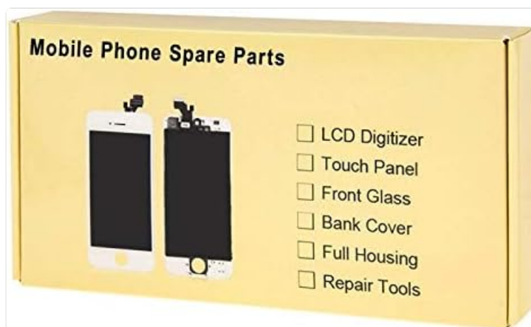
Image: The packaging box for "Mobile Phone Spare Parts," indicating the type of product and potential contents like LCD Digitizer, Touch Panel, and Repair Tools.