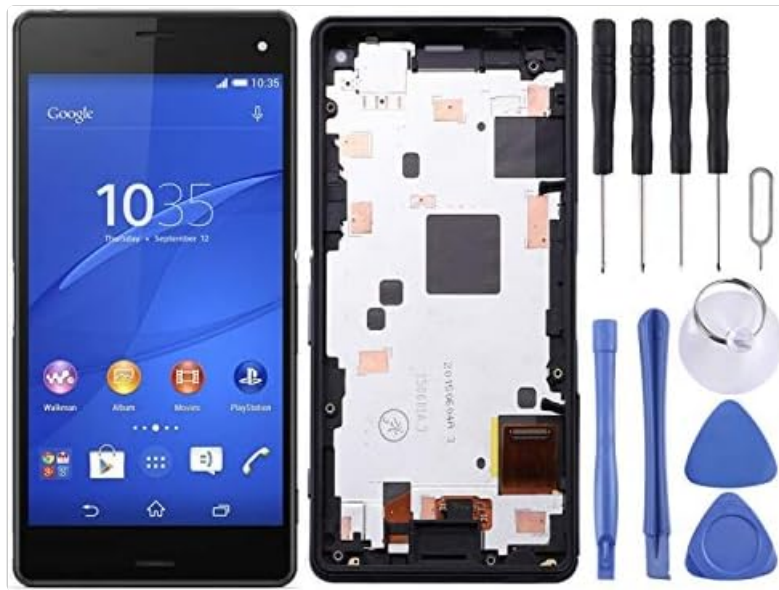
Image: A SONY Xperia Z phone with the Lysee display installed, powered on and showing the device's home screen with various application icons, demonstrating full operational capability.