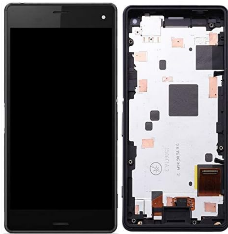
Image: The Lysee 5-inch Original Display Touch Panel (left) shown detached from its frame (right), illustrating the two main components of the replacement part.