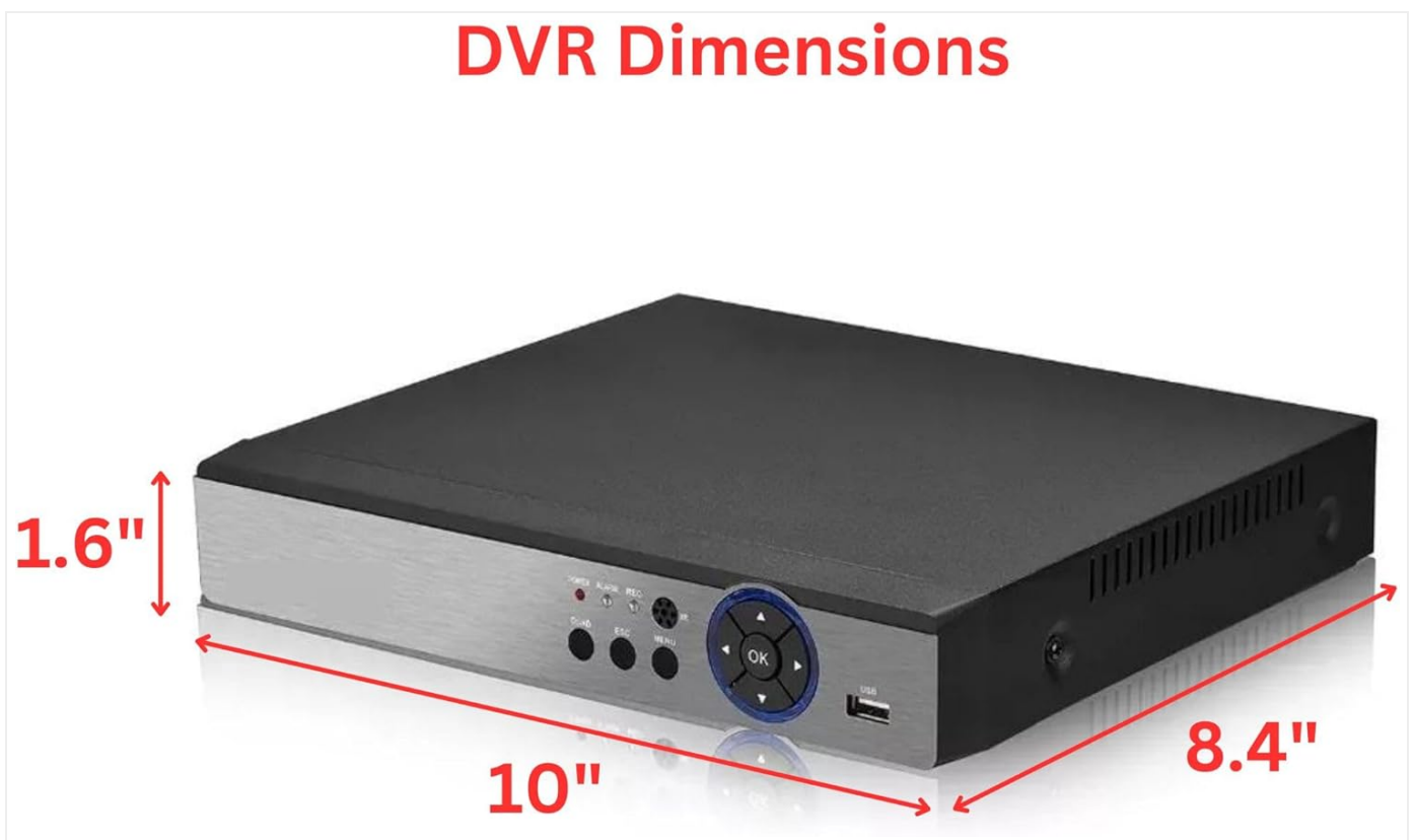
Image: Physical dimensions of the DVR unit, measuring 10" (L) x 8.4" (W) x 1.6" (H).