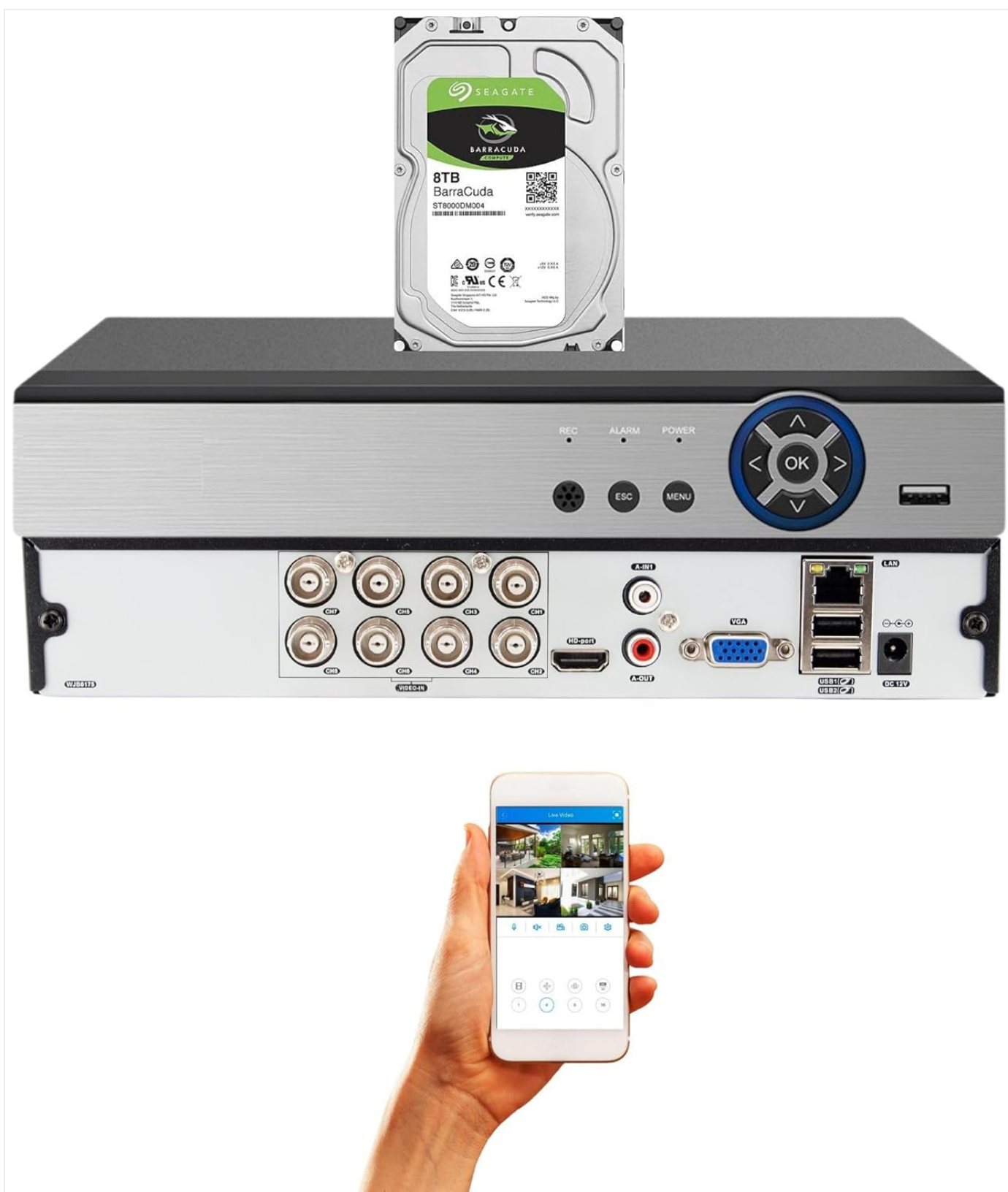
Image: Evertech 8 Channel DVR unit, an 8TB hard drive, and a smartphone showing the remote viewing application.