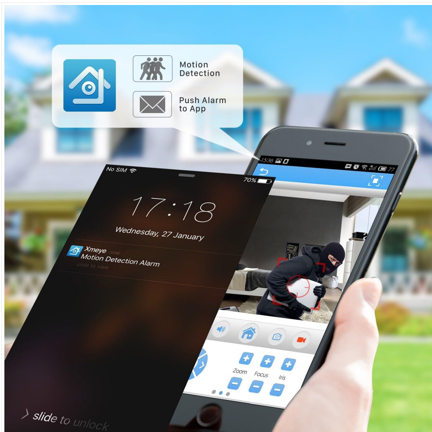
Image: A smartphone displaying a push notification and an in-app alert for motion detection, indicating a security event.