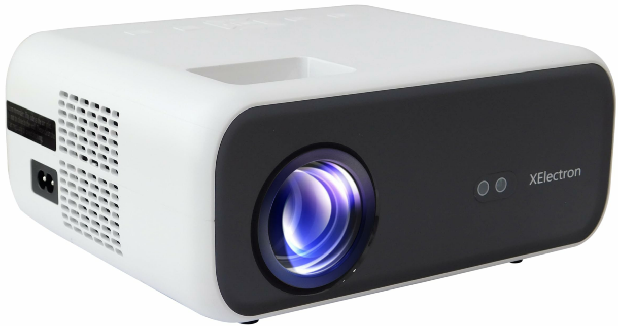
Image: Front view of the XElectron C9 Projector.