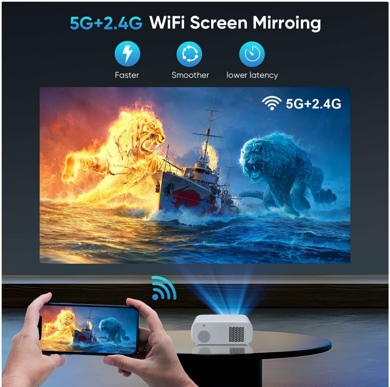
Image: Screen mirroring from a smartphone to the projector via 5G+2.4G WiFi.

Wirelessly project content from your smartphone or tablet using Miracast for Android devices or Airplay for iOS devices. The dual-band 5G+2.4G WiFi ensures faster, smoother streaming with lower latency.