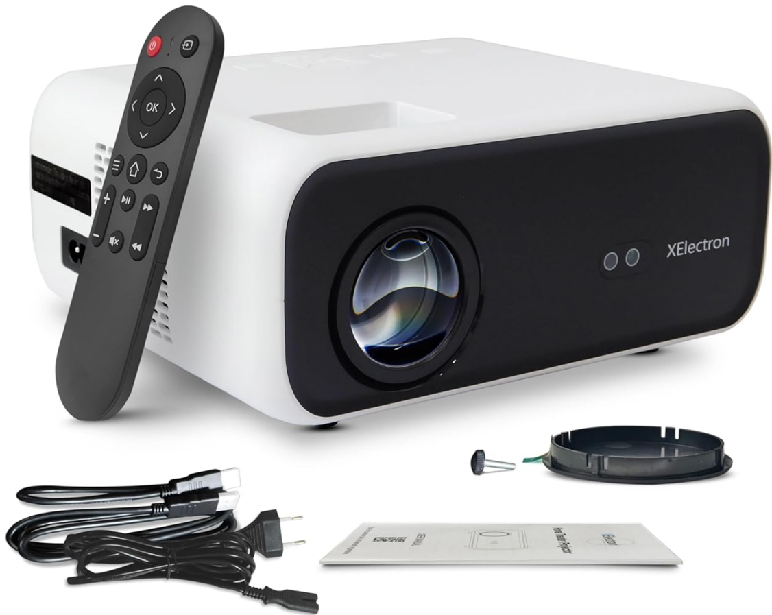
Image: Contents of the XElectron C9 Projector package.

PROJECTOR | REMOTE | POWER CABLE | HDMI CABLE | LENS COVER | USER MANUAL