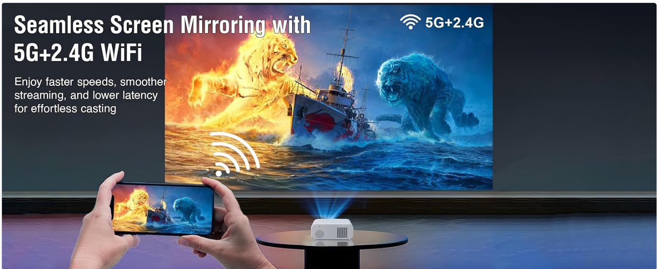
Image: Seamless screen mirroring functionality.