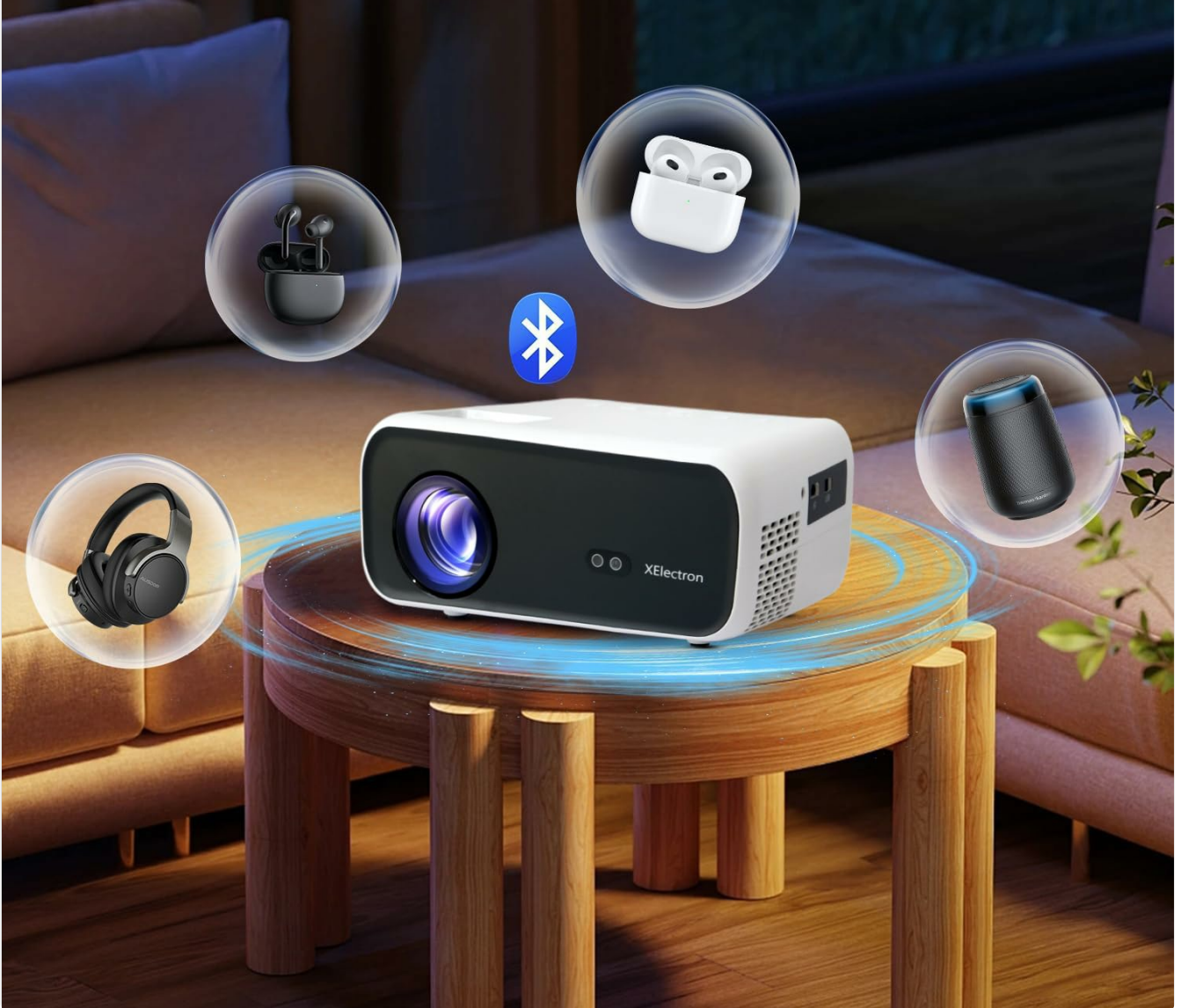
Image: Demonstrating Bluetooth connectivity for external audio devices.