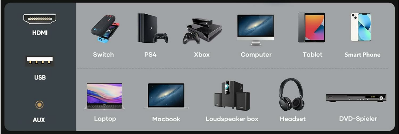
Image: Various devices compatible with the projector's connectivity options.