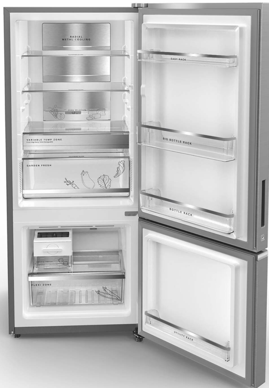
Image: Empty interior view of the refrigerator, highlighting the adjustable shelves, Variable Temperature Zone, and other storage solutions.