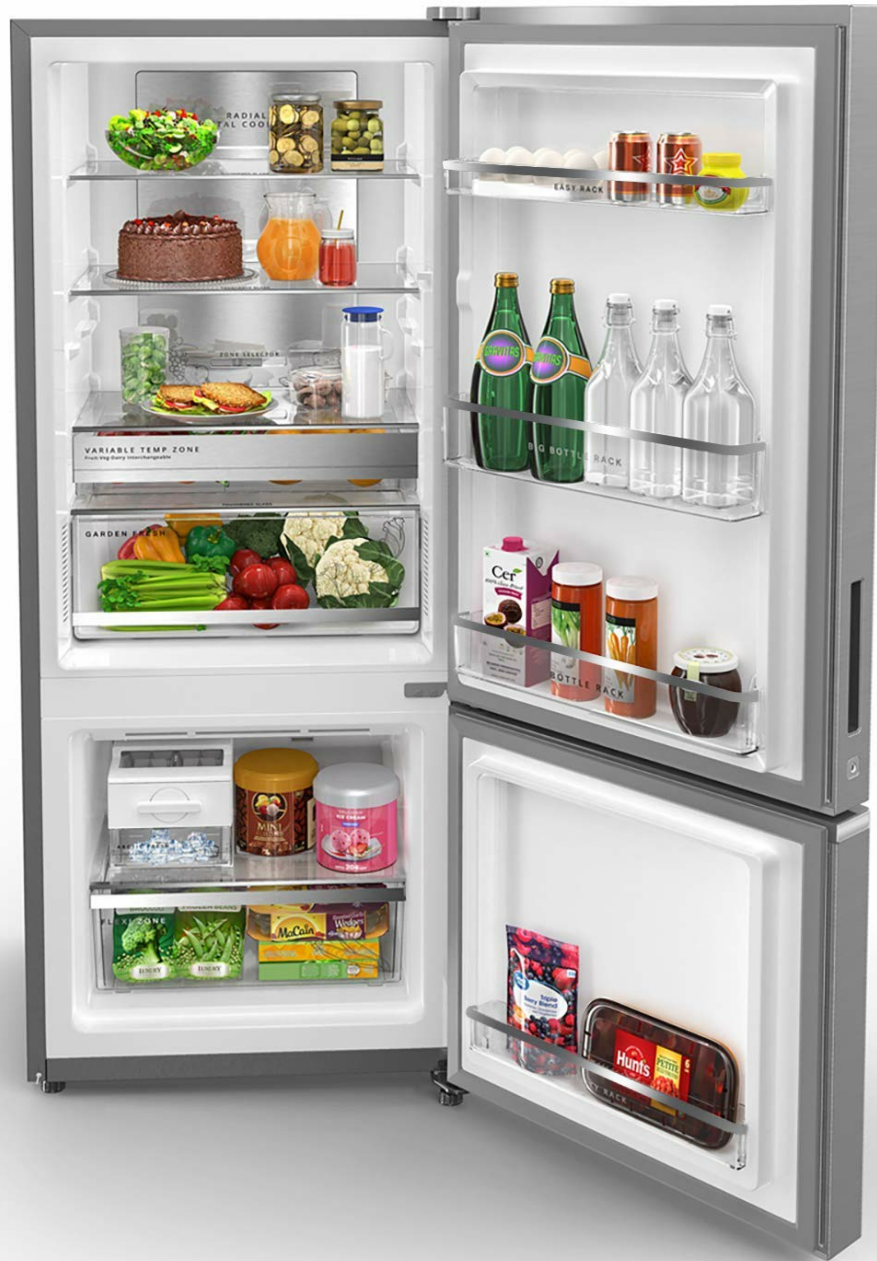
Image: Interior view of the refrigerator, showcasing various storage compartments including shelves, door bins, and crispers, with food items placed inside.