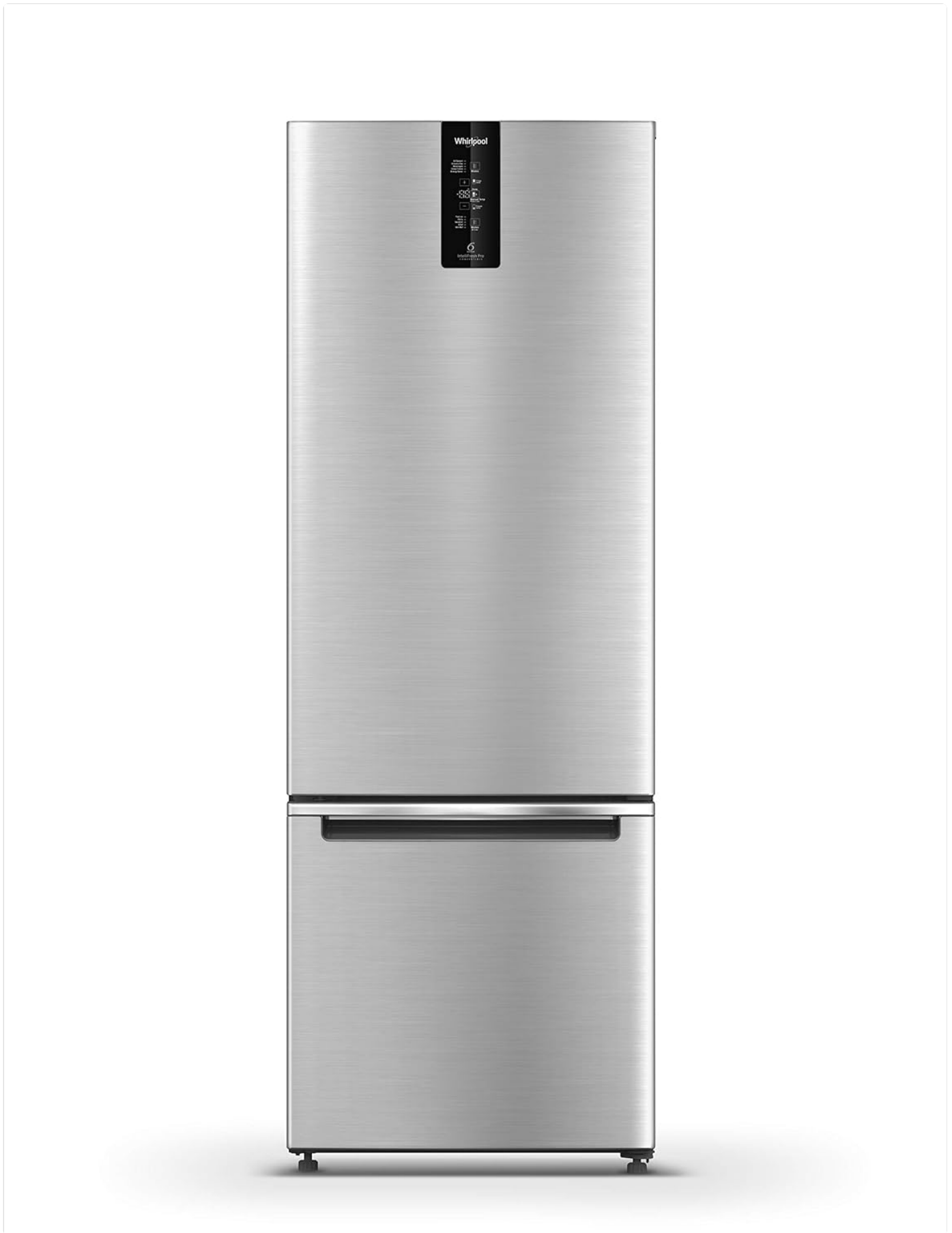
Image: Front view of the Whirlpool 325 L Frost Free Double Door Refrigerator in Omega Steel finish.