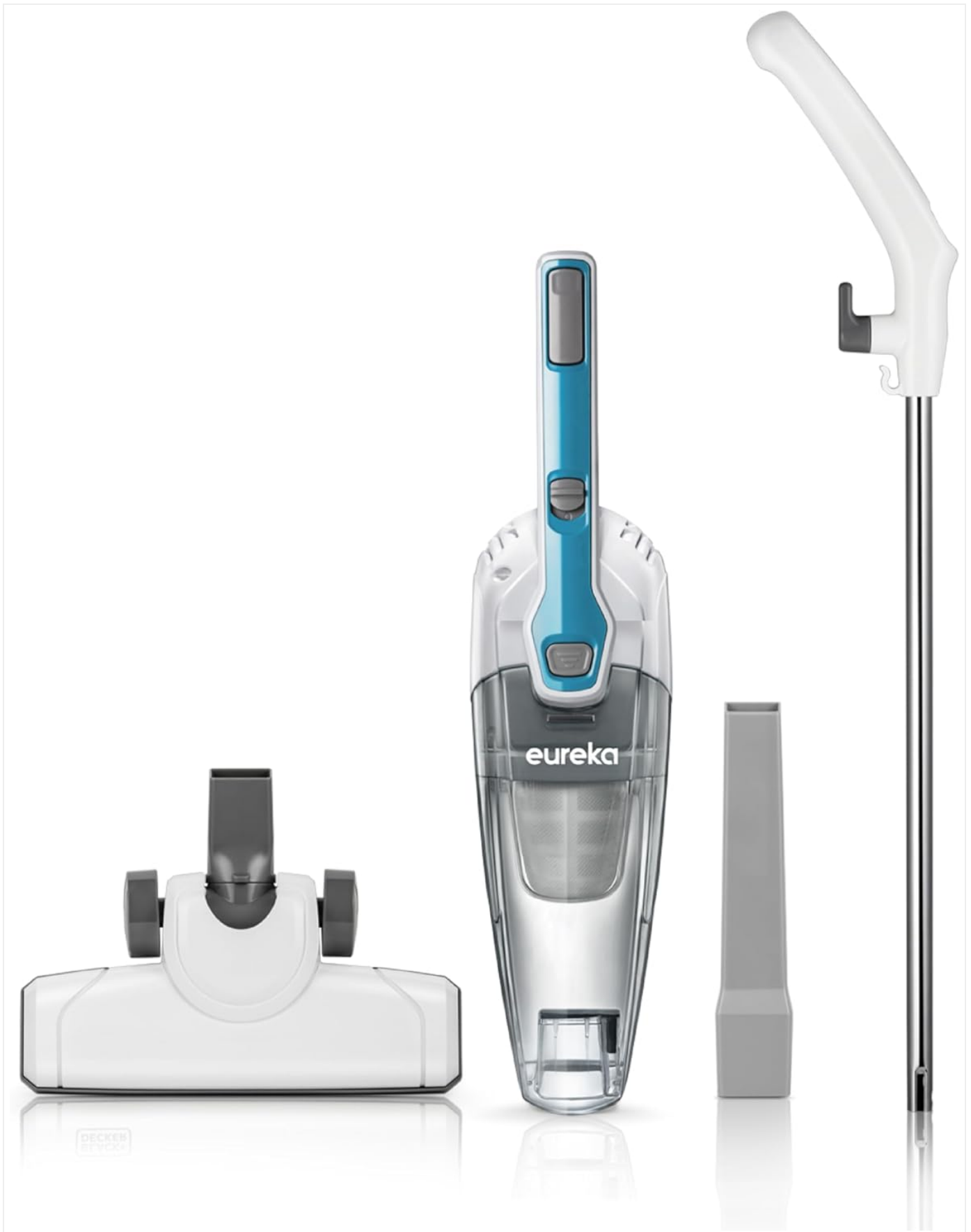
Figure 1: Eureka NES100 Components