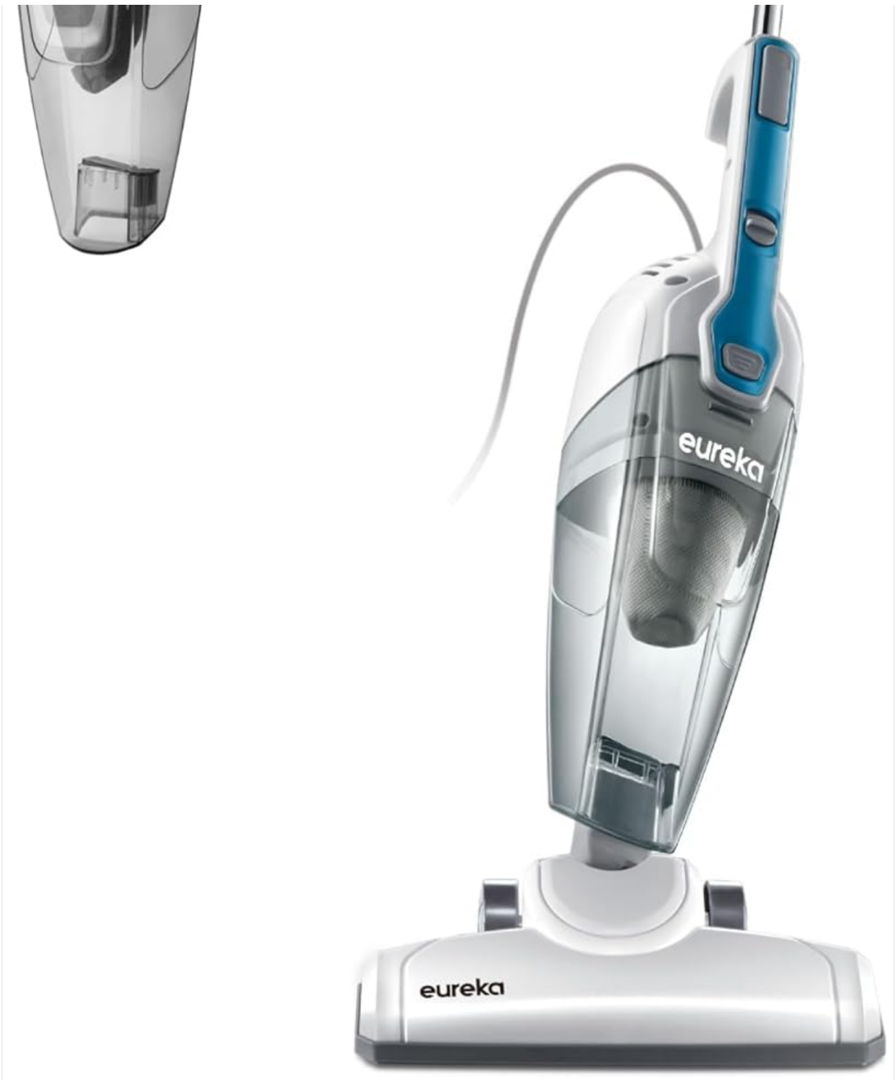
Figure 3: Fully assembled stick vacuum.