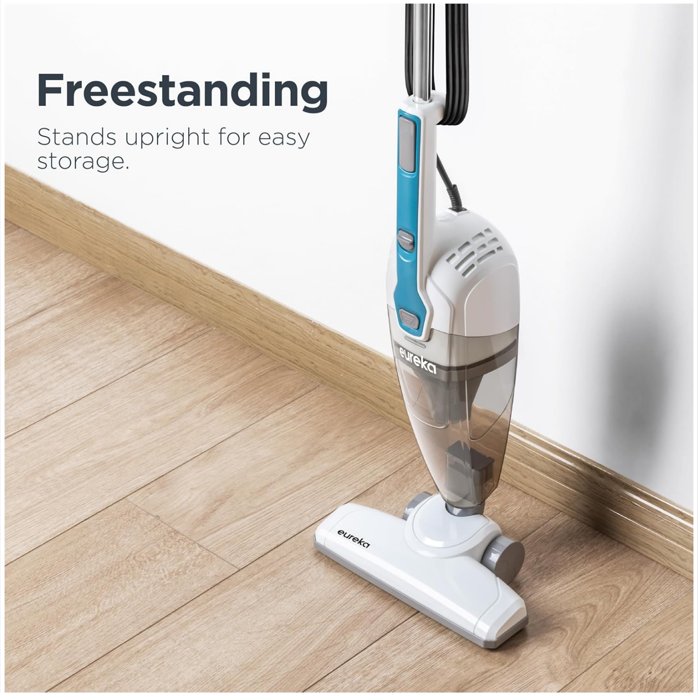
Figure 9: Freestanding design for easy storage.