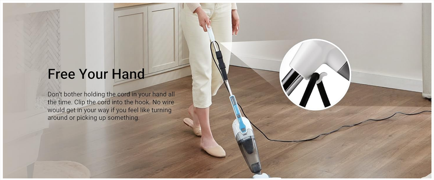
Figure 8: Organized Cord Storage.