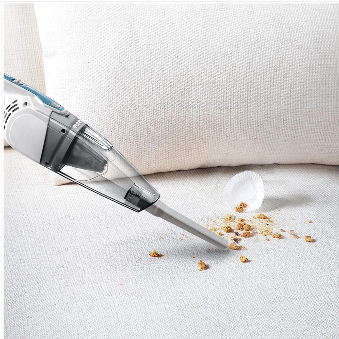
Figure 6: Using the crevice tool for detailed cleaning.