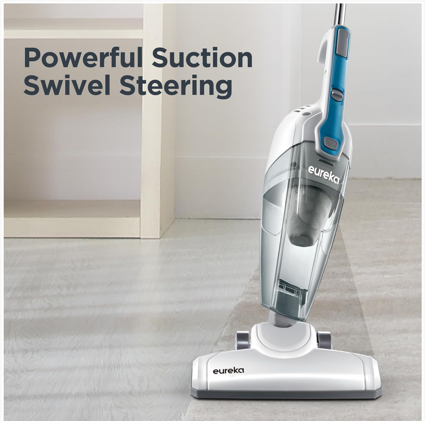
Figure 4: Powerful Suction and Swivel Steering in action.