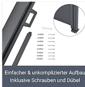
Image: Installation diagram illustrating wall mounting of the cassette and ground anchoring of the post.