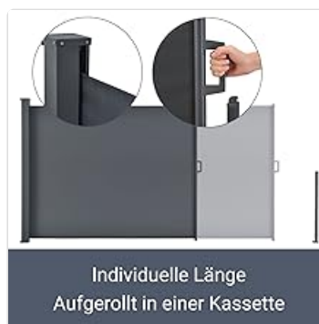
Image: Detail of the awning's retraction mechanism and handle for manual operation.