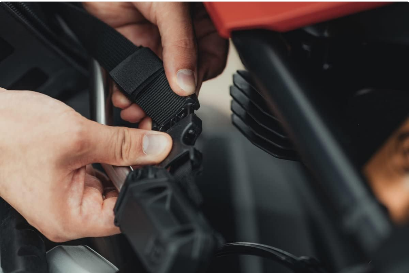
Figure 5: Fastening the safety belt buckle for added security.