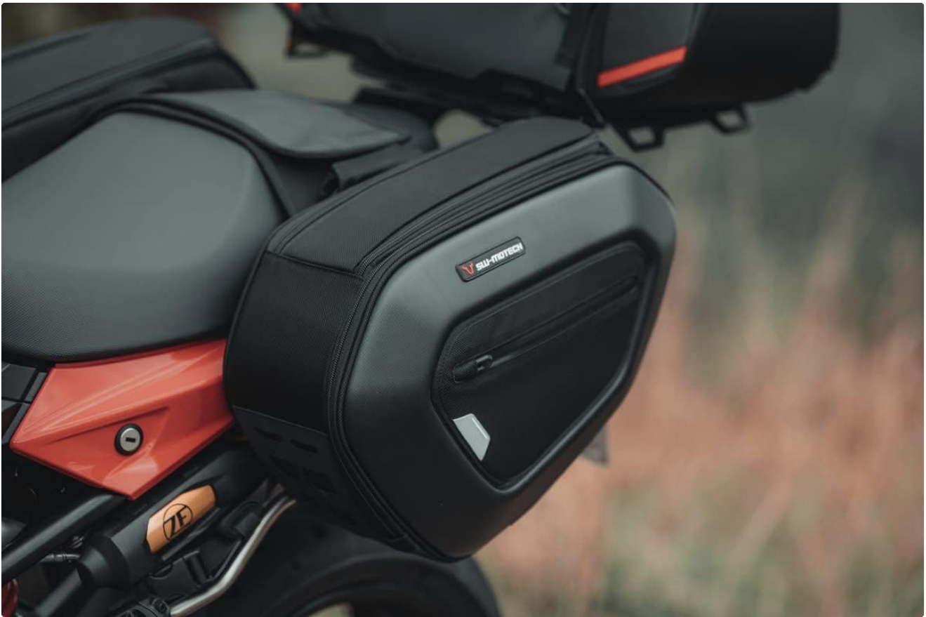
Figure 7: The PRO Blaze saddlebags fully installed on a motorcycle, ready for use.