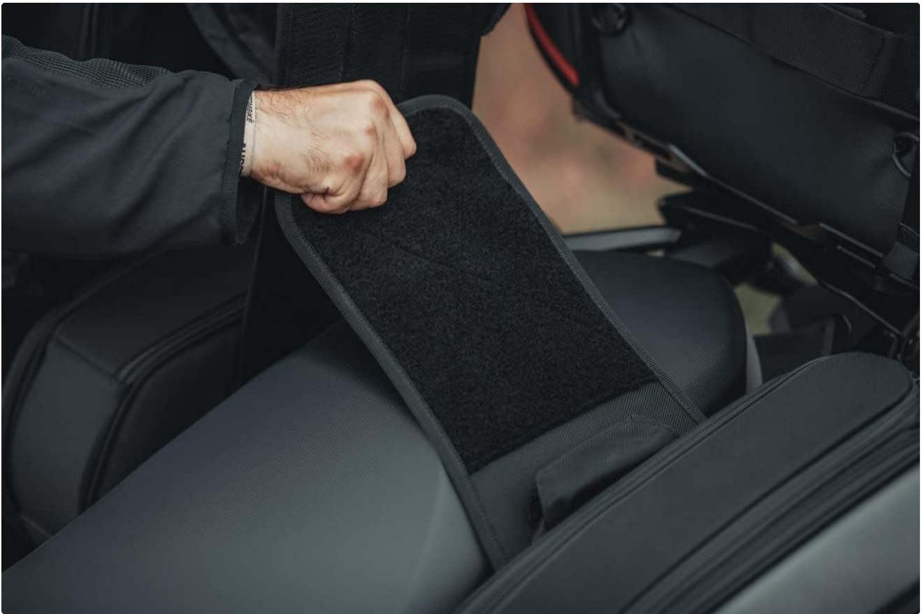
Figure 6: Adjusting the powerful Velcro strap over the passenger seat to secure both bags.