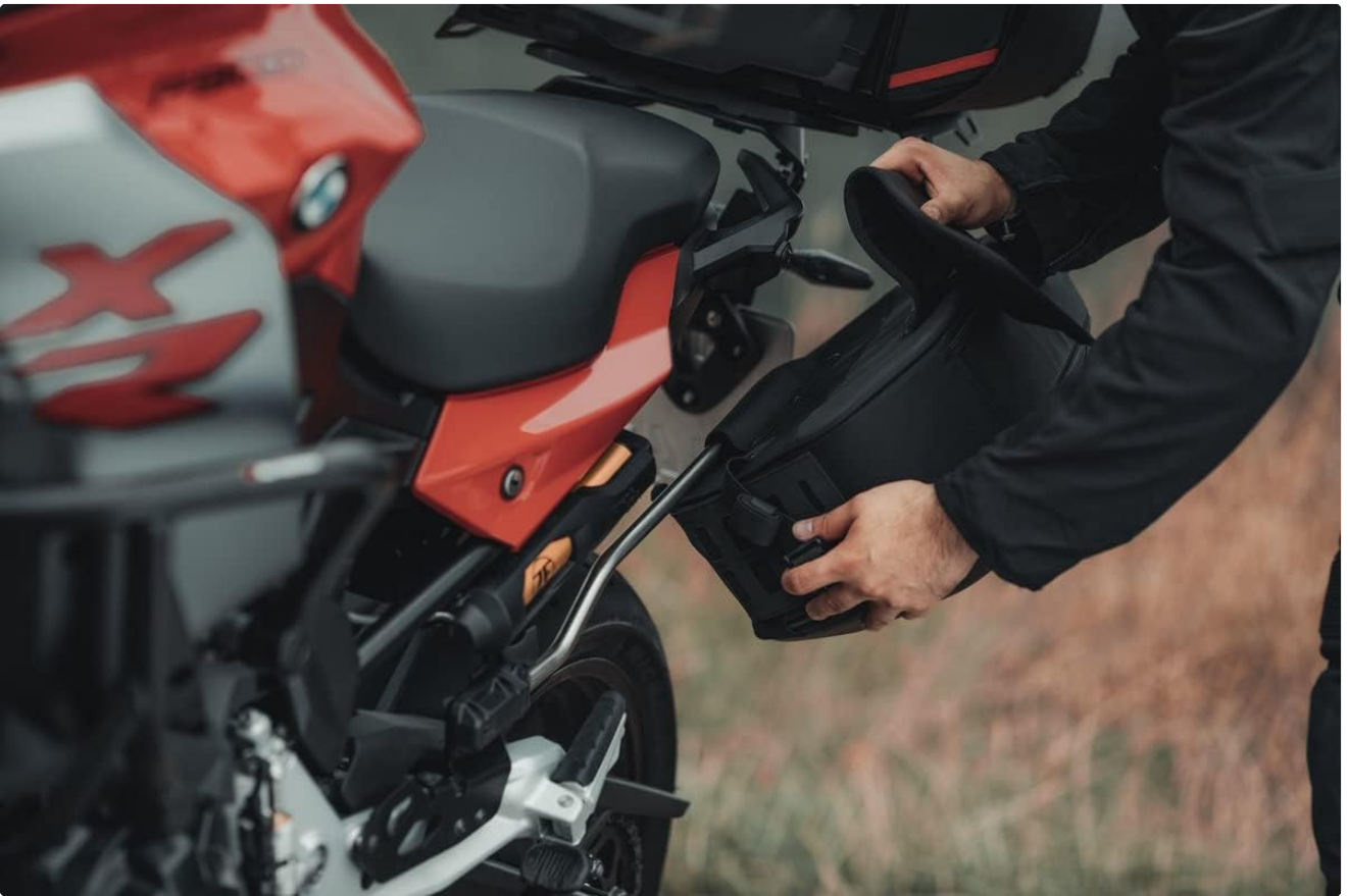
Figure 4: Sliding the saddlebag onto the installed distance bracket.