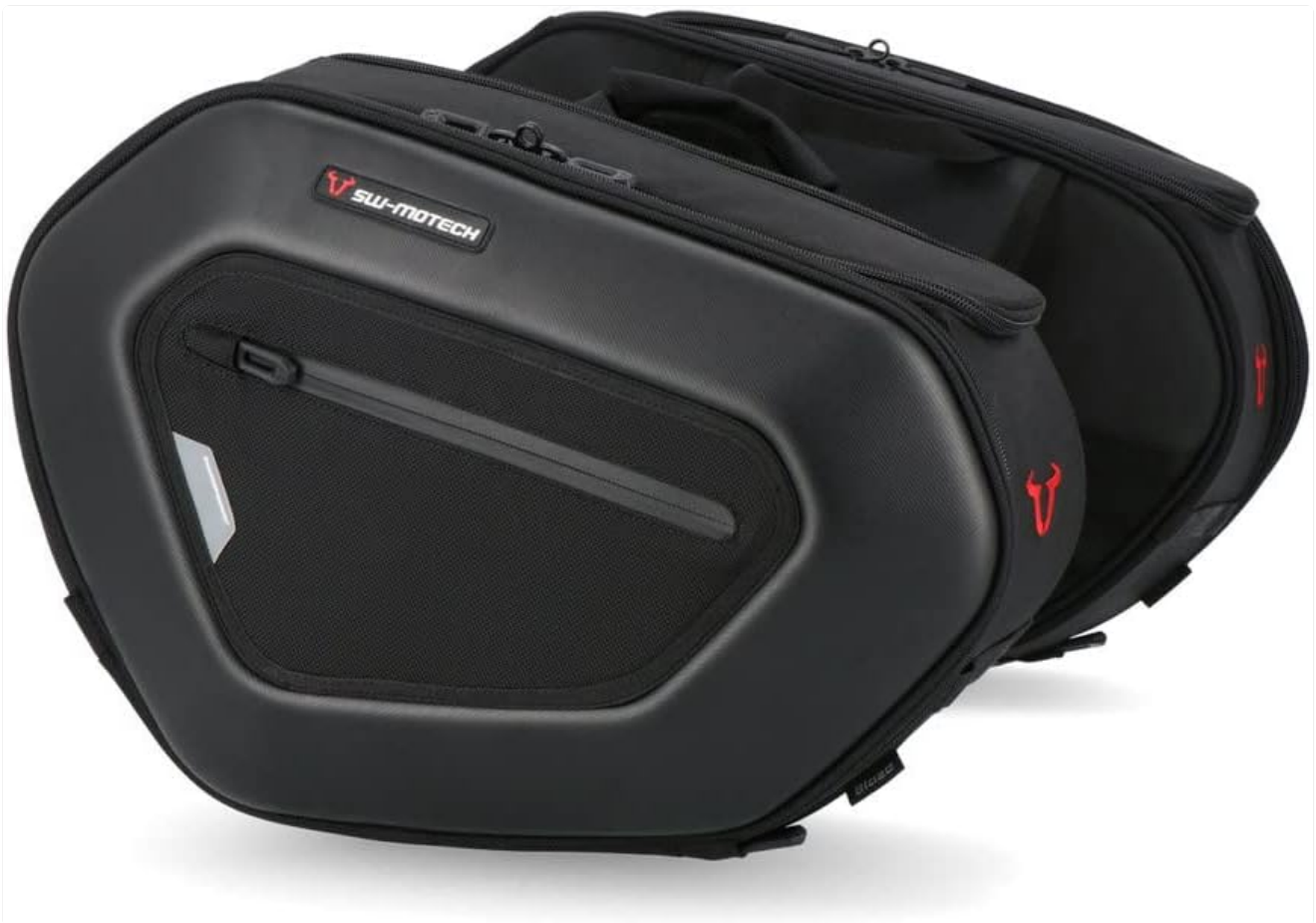
Figure 1: The SW-Motech PRO Blaze Motorcycle Saddlebag Set, showcasing both bags.