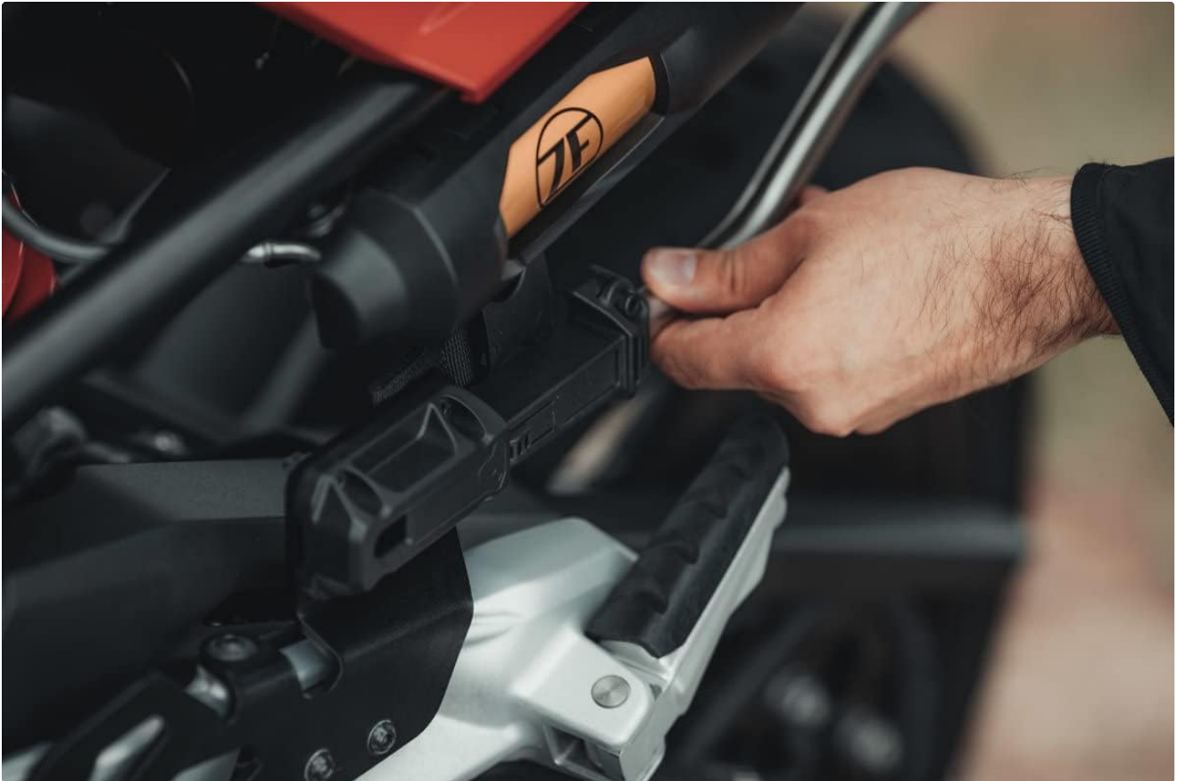
Figure 2: Securing the bracket attachment point on the motorcycle frame.