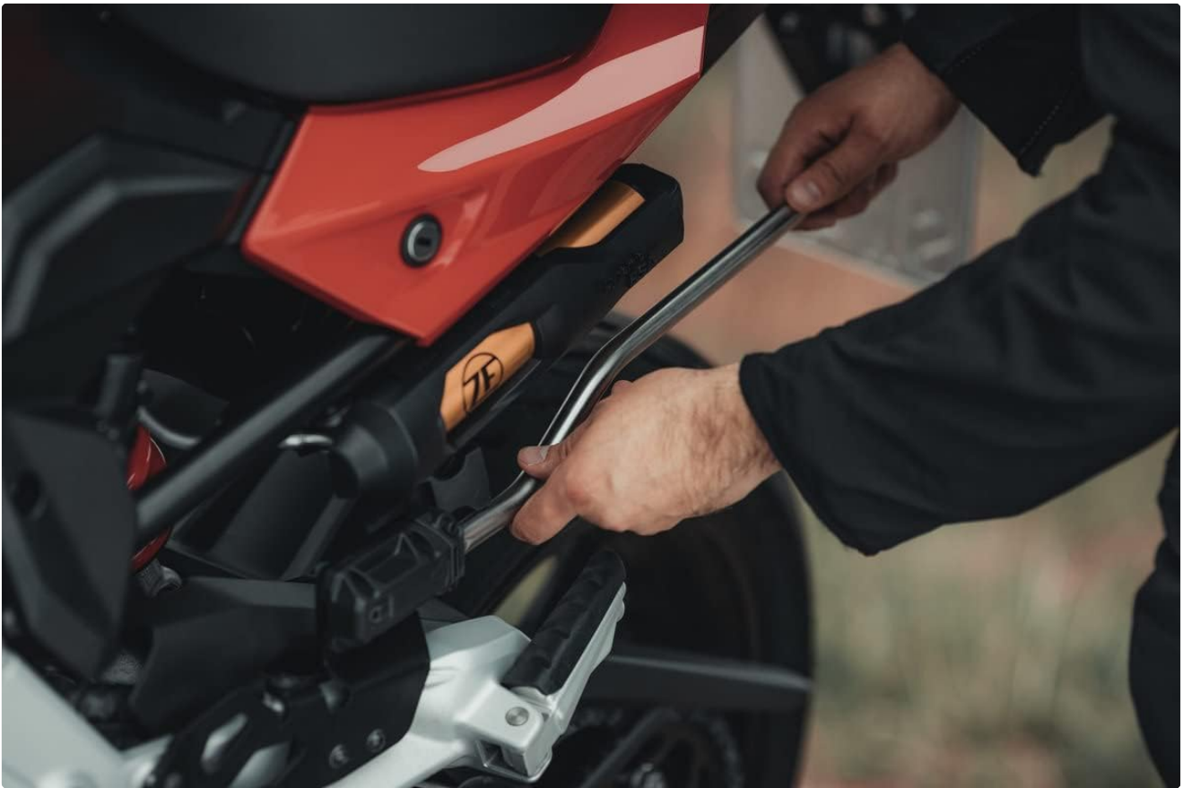
Figure 3: Inserting the PRO Blaze distance bracket into its designated holder on the motorcycle.