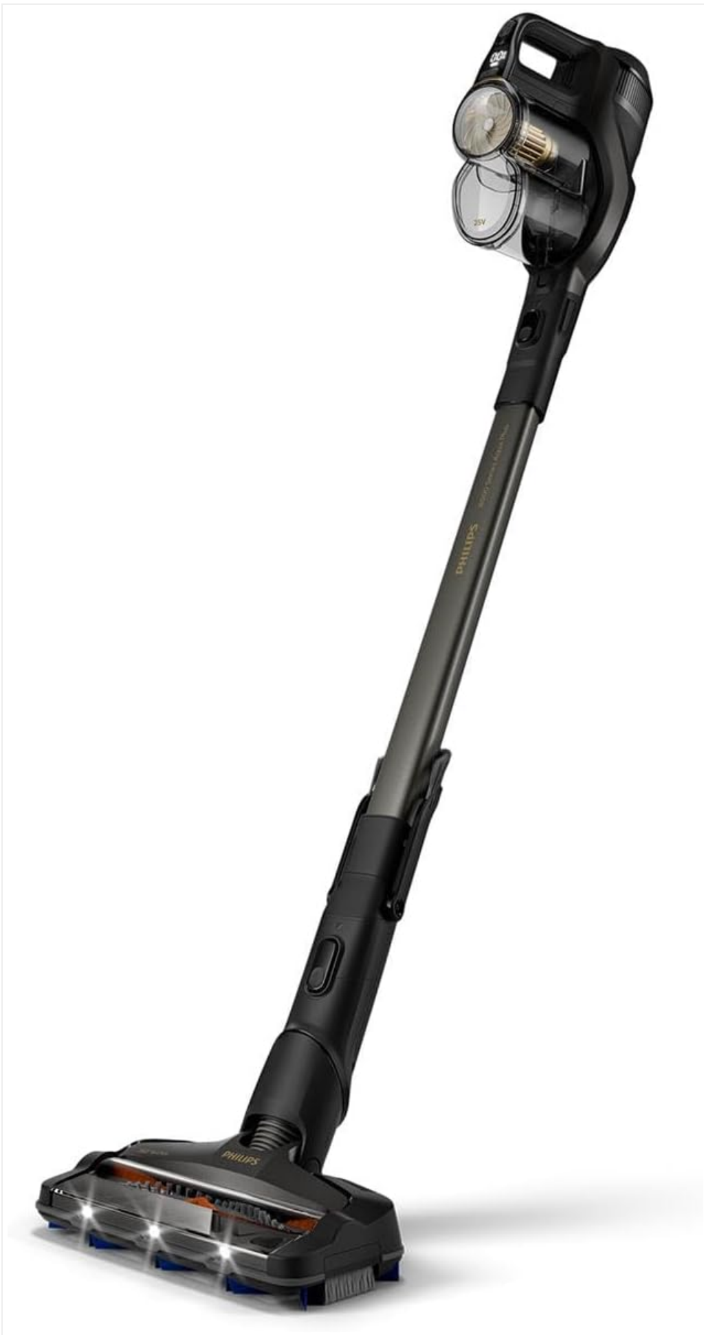
Image 1: Philips Series 8000 Aqua Plus Cordless Vacuum Cleaner. This image shows the complete cordless vacuum cleaner unit, highlighting its sleek design and the main brush head.