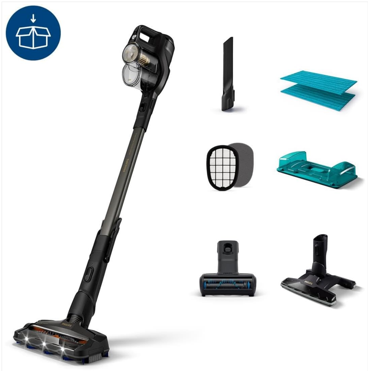
Image 2: Philips Series 8000 Aqua Plus Cordless Vacuum Cleaner with included accessories. This image displays the main vacuum unit along with various attachments such as the crevice tool, extra filter, microfiber pads, and the Aqua brush base.