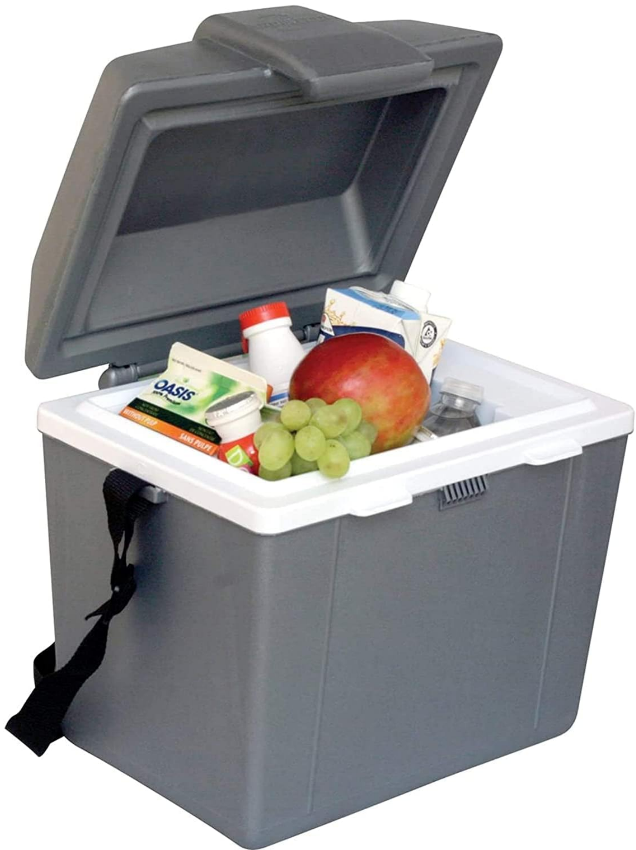
The Koolatron P9 AZ cooler with its lid open, showcasing its interior filled with various food items and beverages, ready for use.