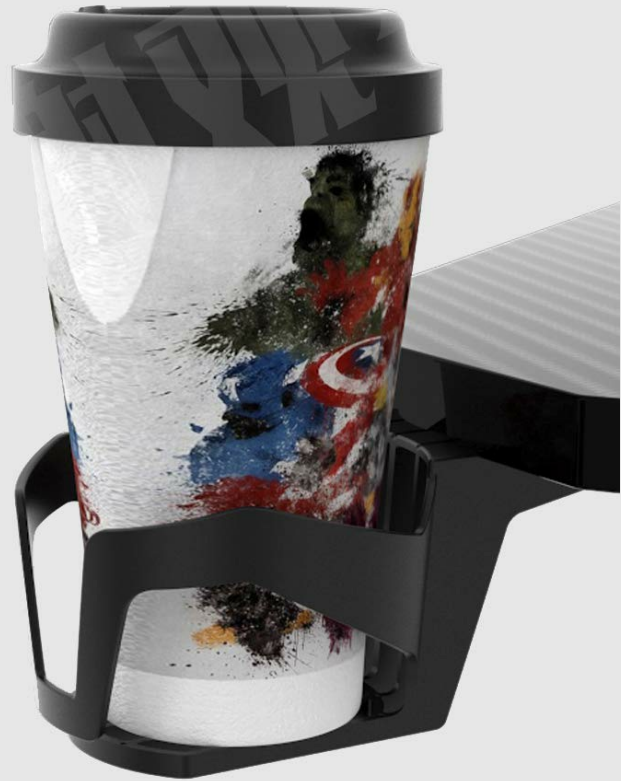
Image: A close-up view of the headphone hook, holding a pair of headphones, and the cup holder, designed to securely hold a beverage.