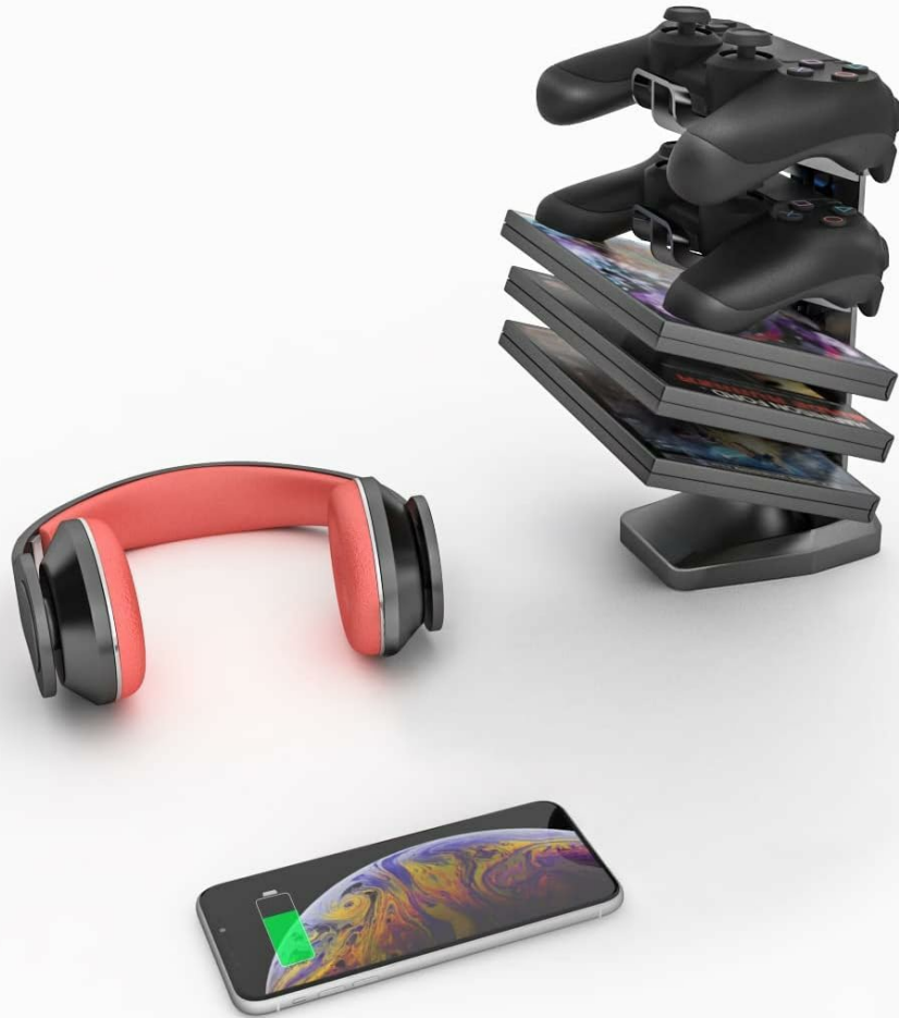
Image: The USB gaming handle rack, demonstrating its use for storing game controllers, headphones, and charging a mobile phone.