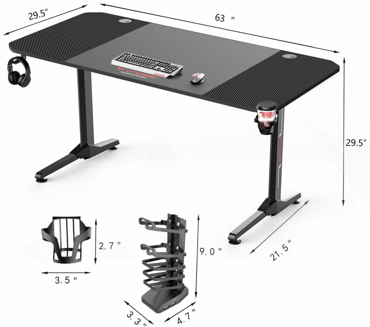
Image: A detailed diagram illustrating the overall dimensions of the desk (63" L x 29.5" W x 29.5" H) and the individual dimensions of the cup holder and gaming handle rack.