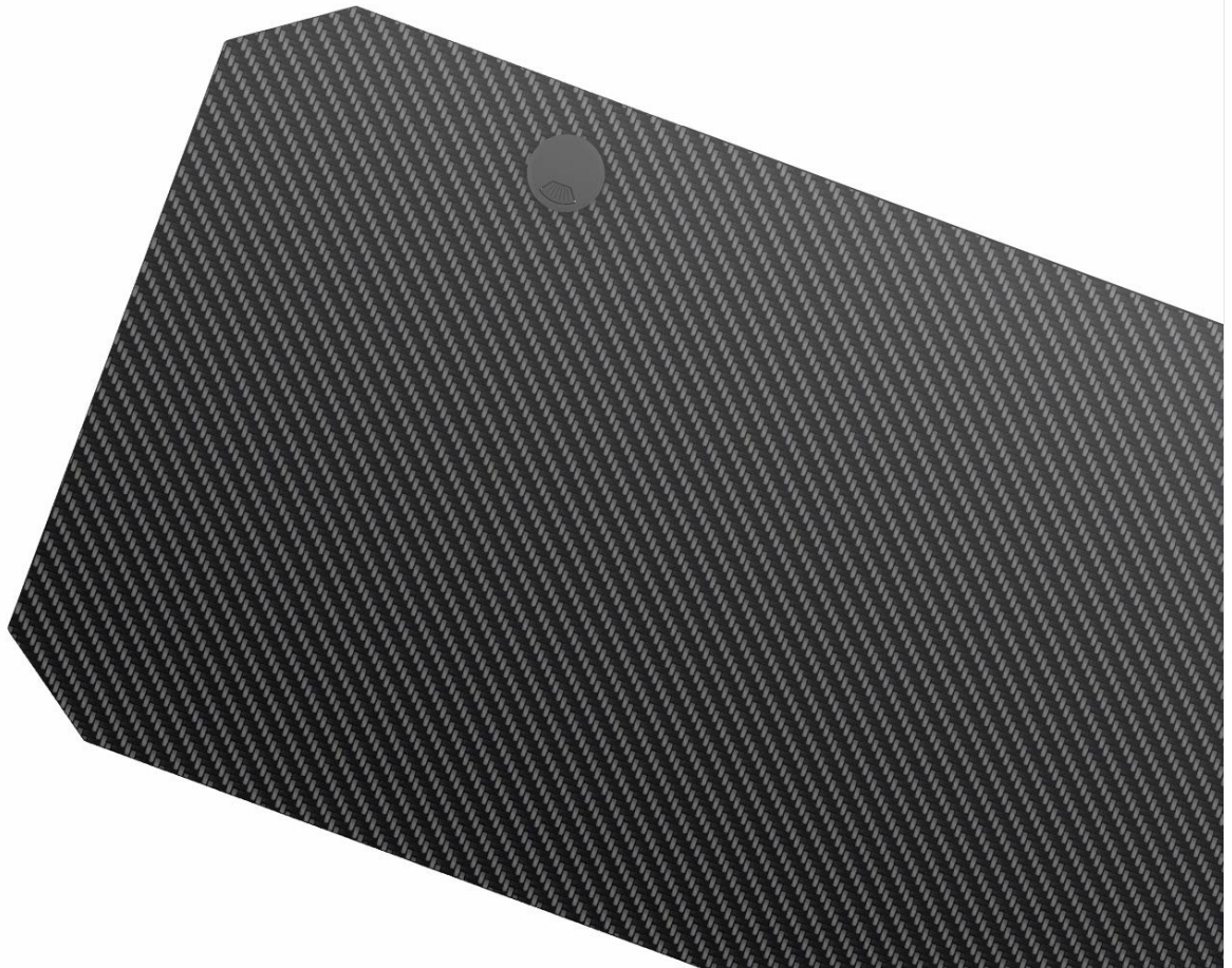
Image: A close-up view of the carbon fiber textured desktop, highlighting its corrosion-resistant properties.