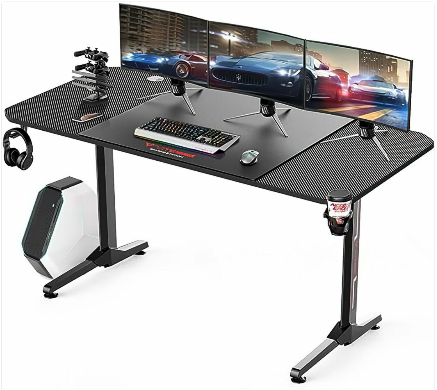
Image: The Waleaf Vitesse GT-V3 63-inch Gaming Desk, showcasing its design and accessories within a typical gaming environment.