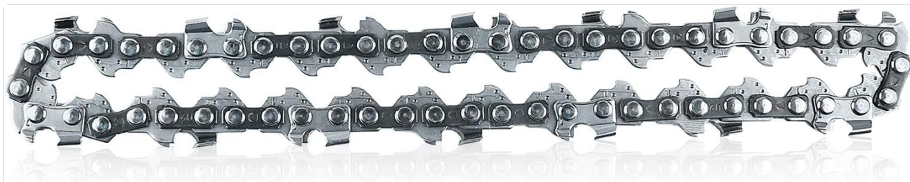
Image: A close-up view of the GOXAWEE 4 inch chainsaw chain, showing the individual links and cutting teeth. This image highlights the robust construction and design of the chain, essential for proper installation and function.