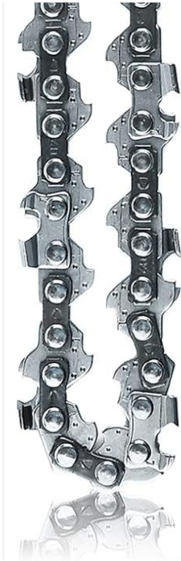
Image: The GOXAWEE 4 inch chainsaw chain presented vertically, highlighting its compact size and the arrangement of its cutting teeth. This perspective can be useful for visual inspection during maintenance.