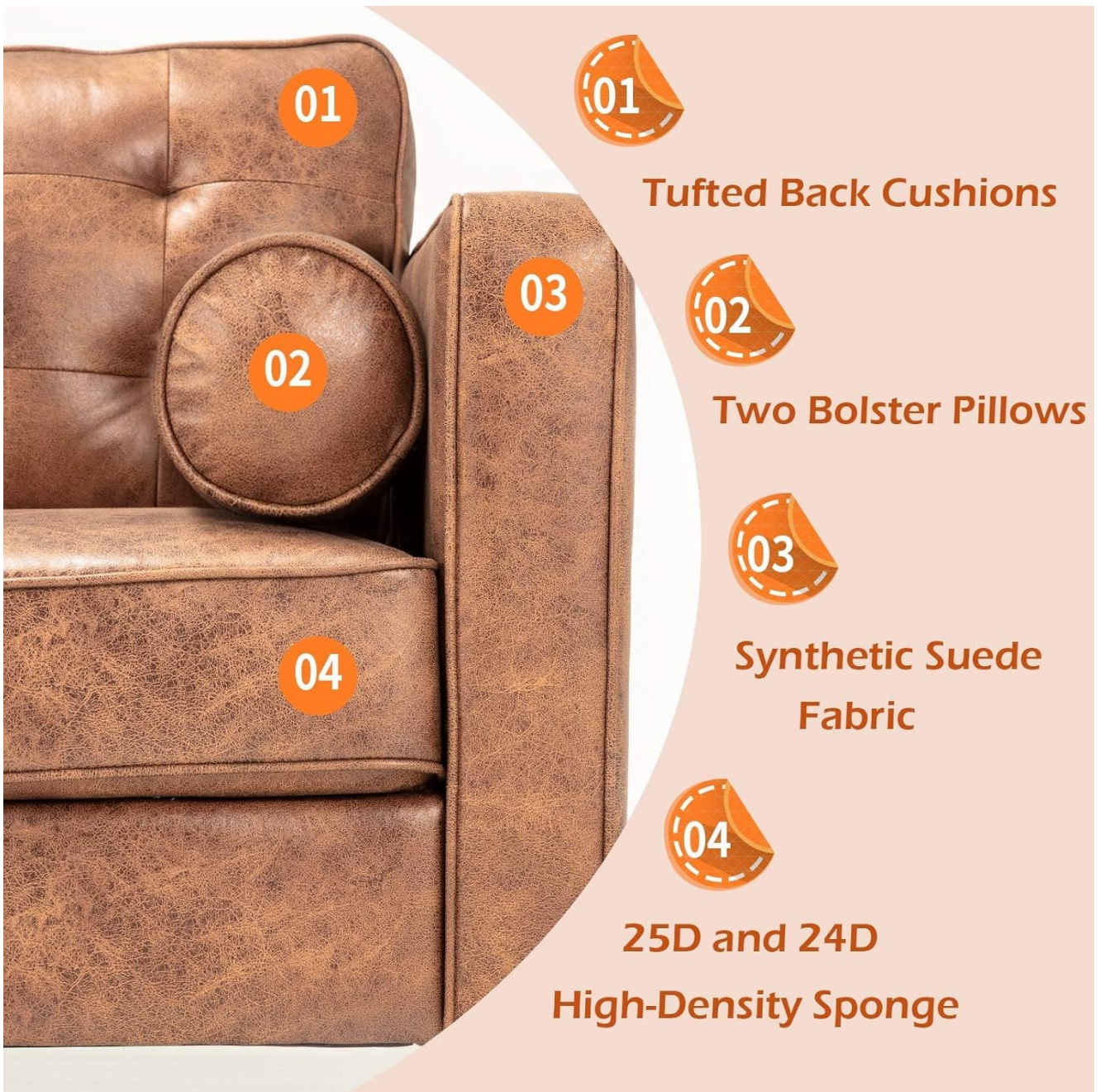
Image showing the sofa with tufted back cushions and bolster pillows in place, highlighting the tufted design and synthetic suede fabric.