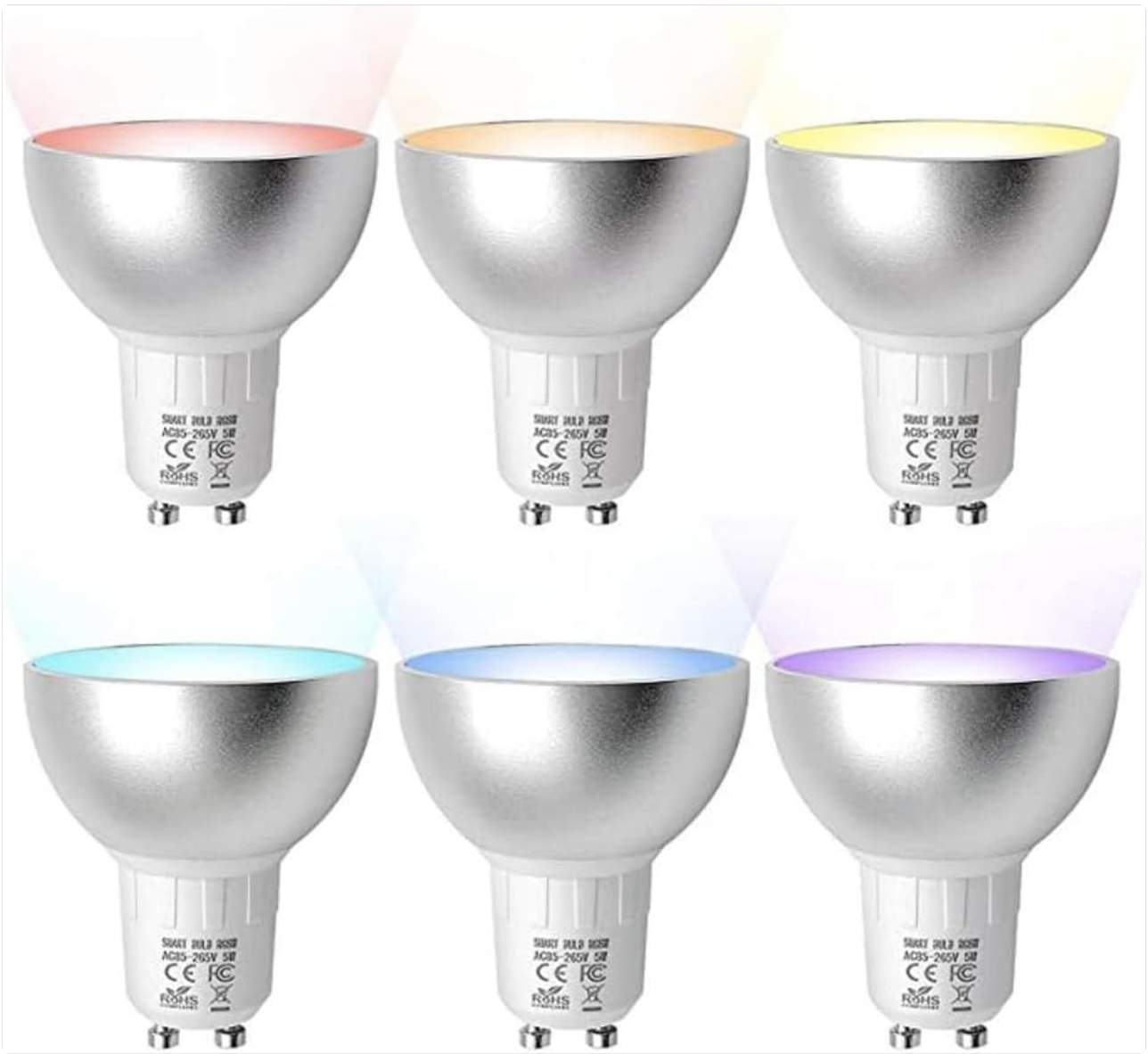
Image: A set of six BENEXMART GU10 smart LED bulbs, each emitting a different color of light (red, orange, yellow, cyan, blue, purple), showcasing their color-changing capabilities.