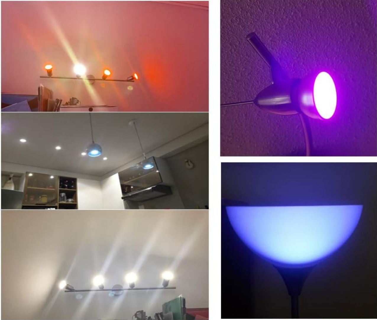
Image: A collage of four images showing the BENEXMART smart bulbs in different applications: two top images show bulbs in track lighting and a single fixture emitting colored light, while the bottom two images show bulbs in track lighting and a floor lamp emitting white and blue light respectively.

For lighting which with GU10 base and 110-240V output