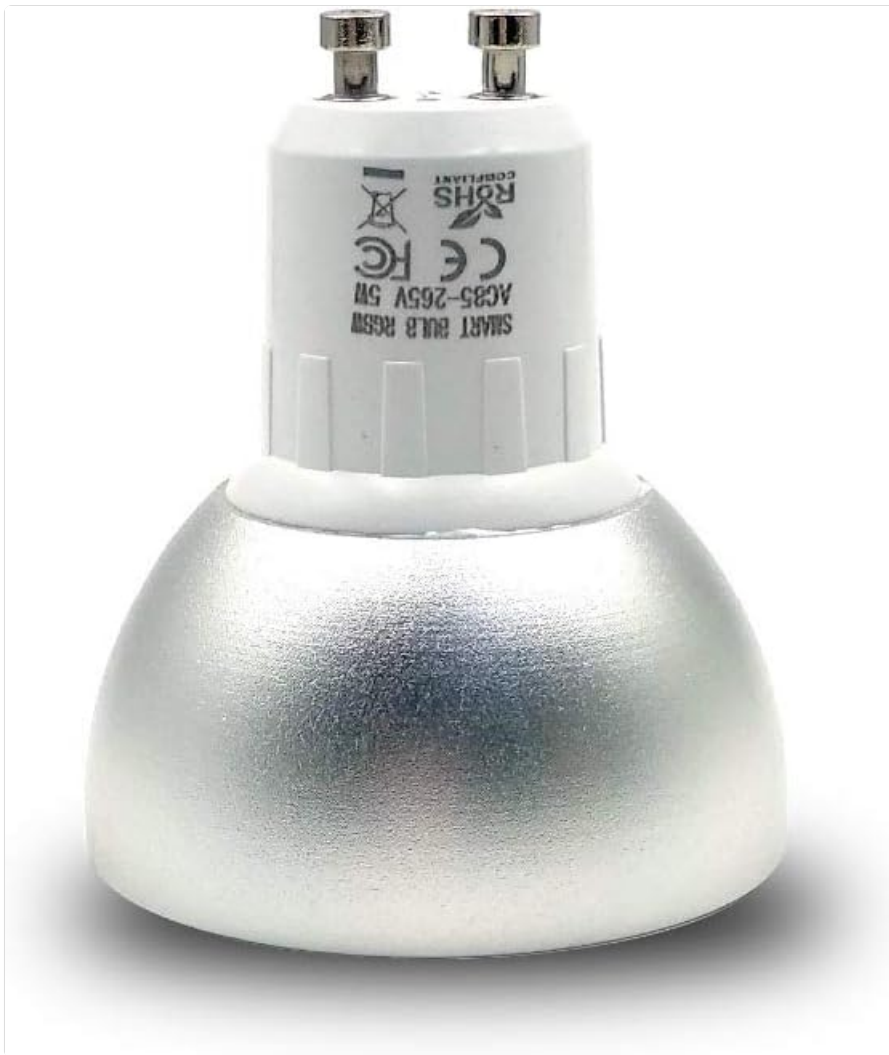
Image: A detailed close-up shot of a single BENEXMART GU10 smart LED bulb, highlighting its silver body and white base with electrical contacts.