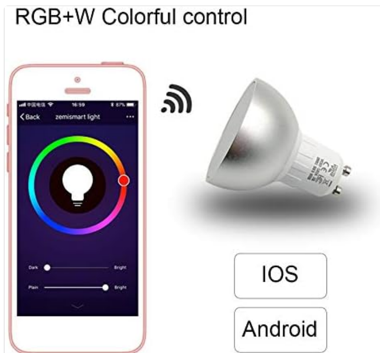
Image: A smartphone displaying the Smart Life app interface, showing a color wheel for RGB+W control of the smart bulb, with brightness and plain sliders. Text indicates compatibility with iOS and Android.

Search for "Smart Life" or "Tuya Smart" in your mobile app store (App Store for iOS or Google Play Store for Android) and download the application. Register for a new account or log in if you already have one.