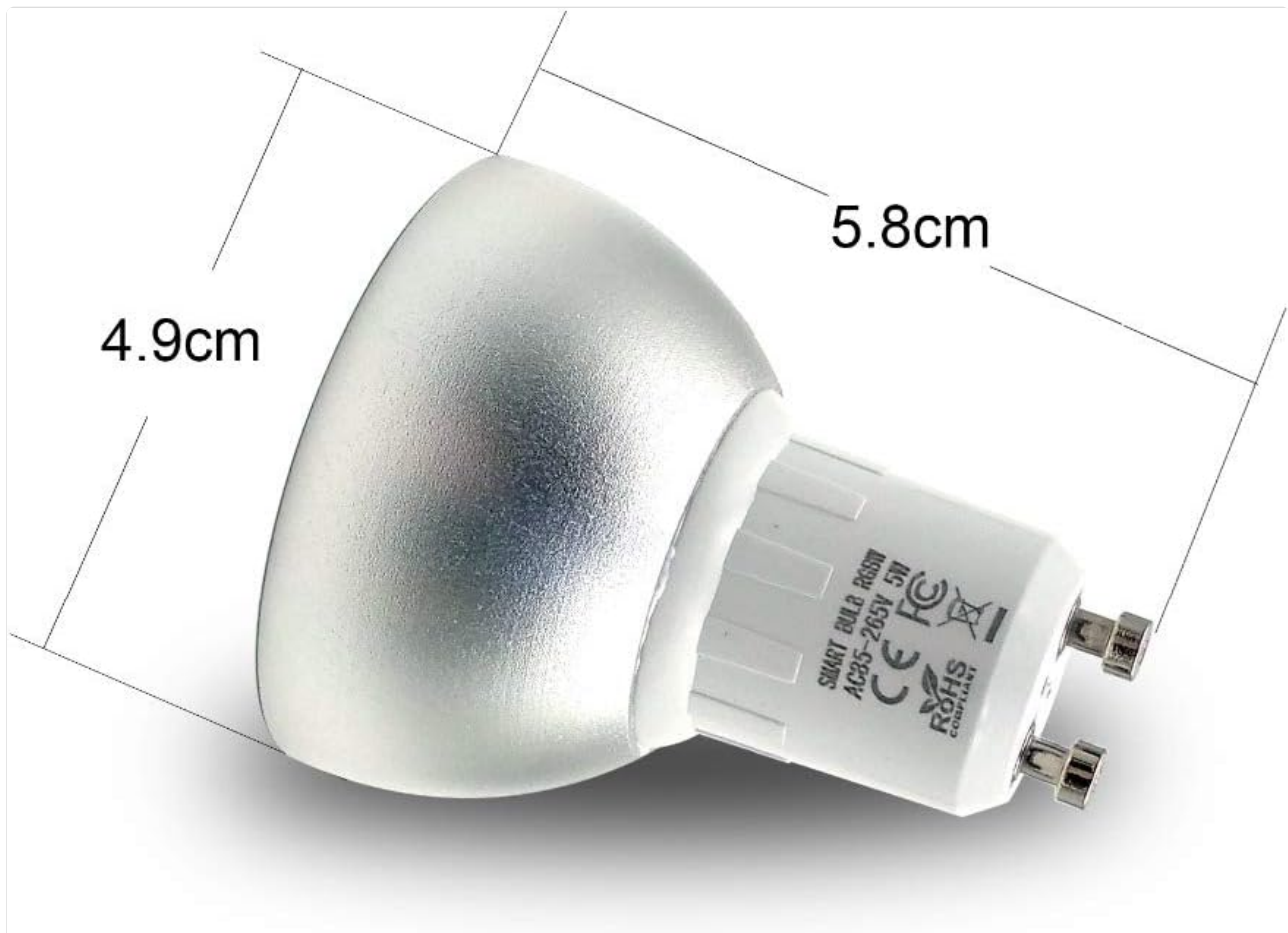
Image: A single BENEXMART GU10 smart LED bulb with measurements indicating its height (4.9cm) and diameter (5.8cm).