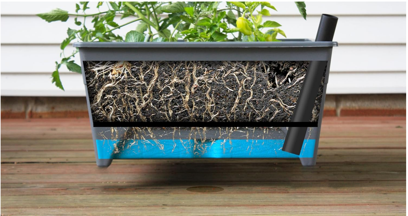
Image: A cutaway view of the planter showing the soil, aeration screen, and the water reservoir at the bottom, illustrating the self-watering mechanism.