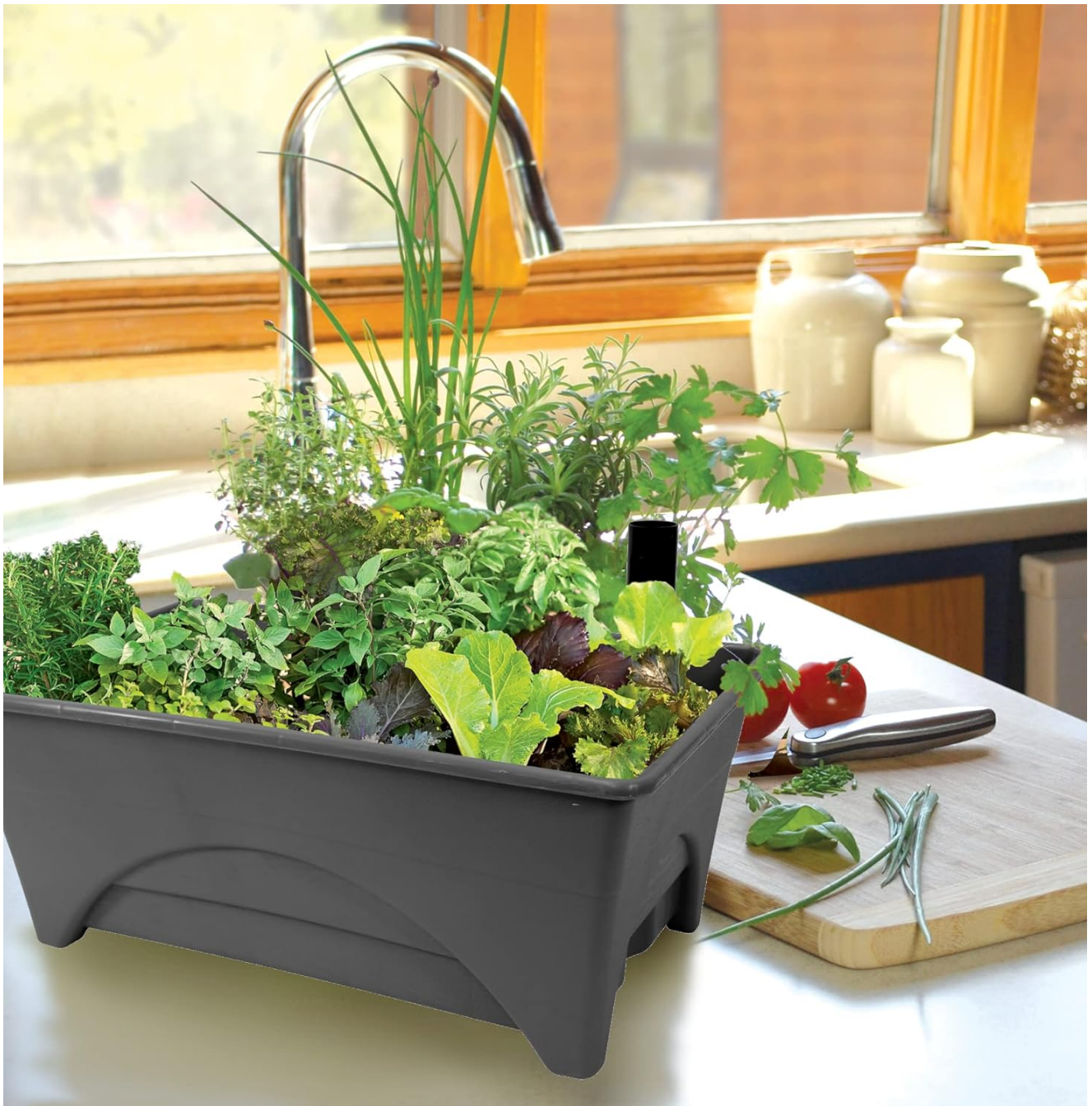
Image: A brown Emsco Group planter filled with a variety of fresh herbs, positioned on a kitchen counter near a window.