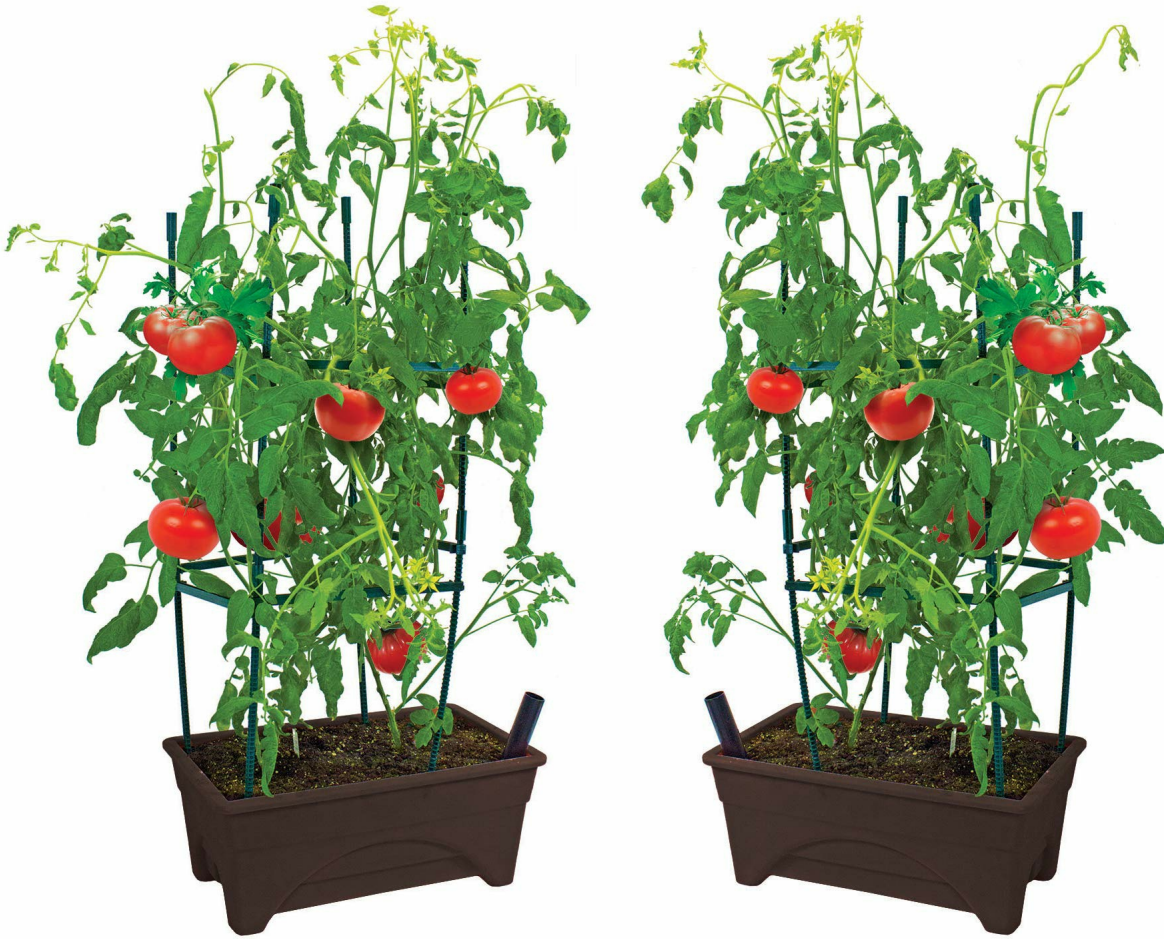
Image: The Emsco Group Start Pickin' Raised Bed Seed Starter in use, showcasing its compact design and suitability for various plants.