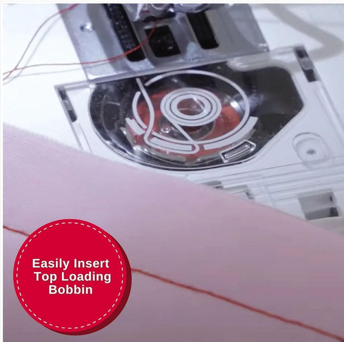
Figure 2: The transparent top drop-in bobbin cover allows for easy monitoring of thread supply.