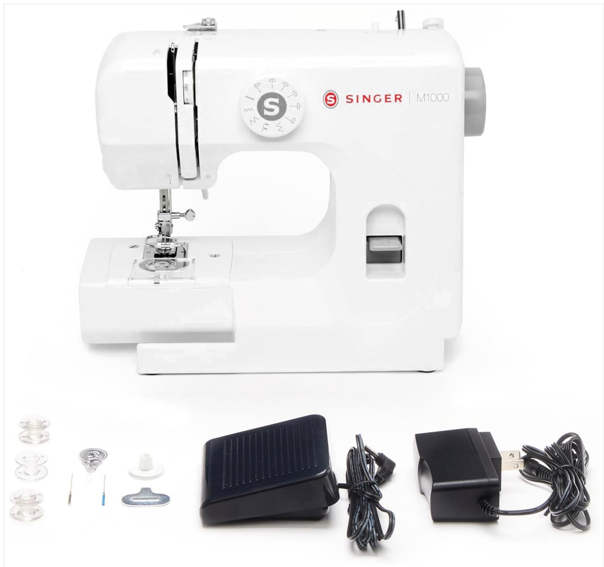
Figure 1: SINGER M1000 Mending Machine with its accessories, including bobbins, needles, and foot pedal.