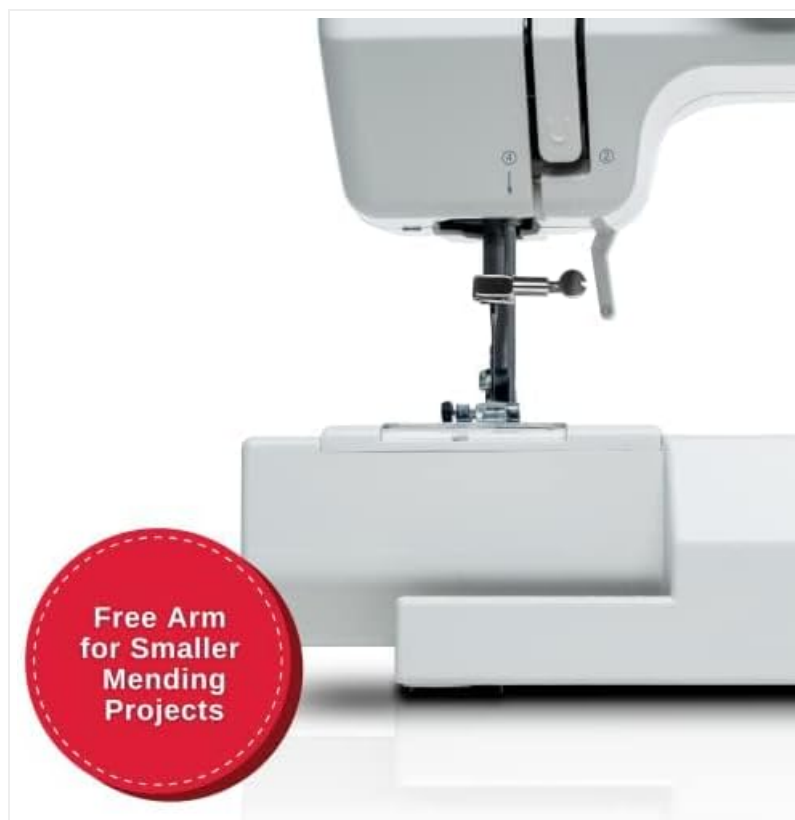
Figure 4: The free arm provides easy access for sewing small, circular projects.