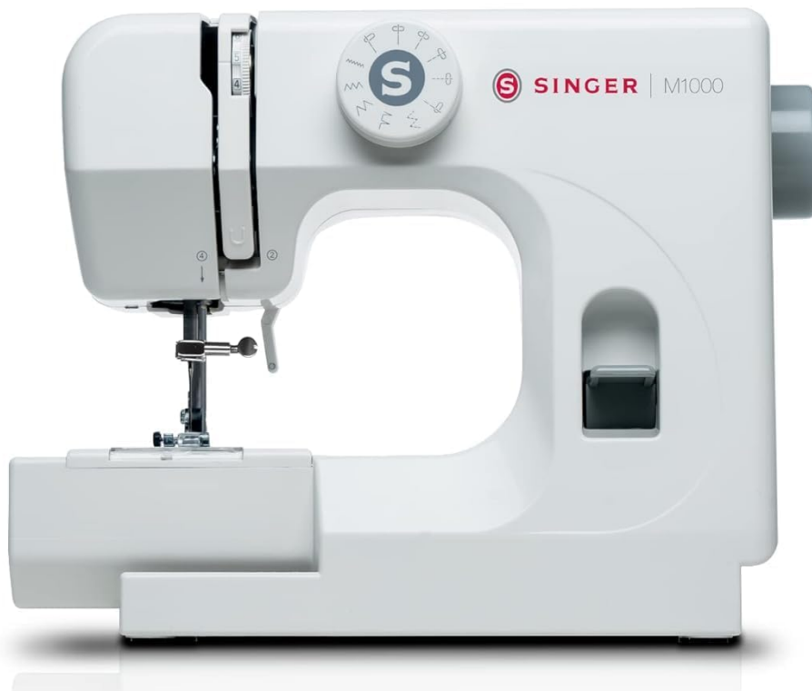
Figure 3: The stitch selection dial allows easy choice from 32 stitch applications, including straight and zigzag stitches.