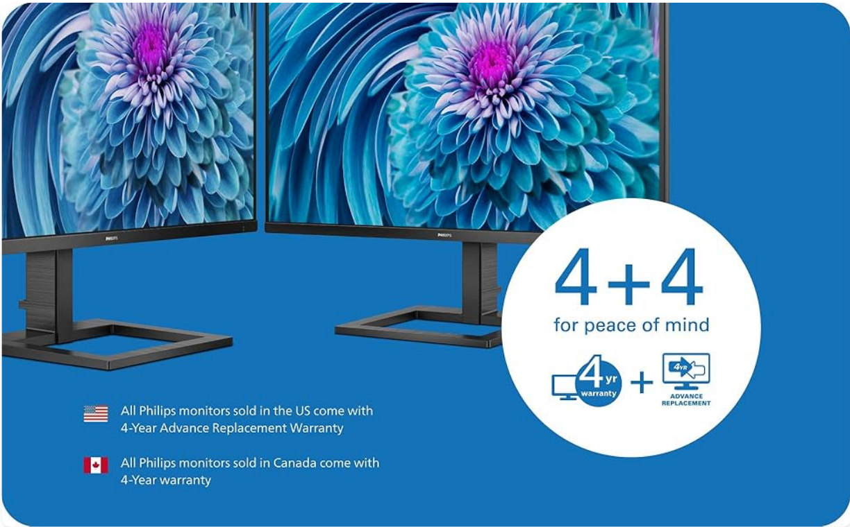
Figure 6: Philips 4-Year Advance Replacement Warranty details.

All Philips monitors sold in the US come with a 4-Year Advance Replacement Warranty. For detailed terms and conditions, please refer to the official Philips website or your product's warranty card.