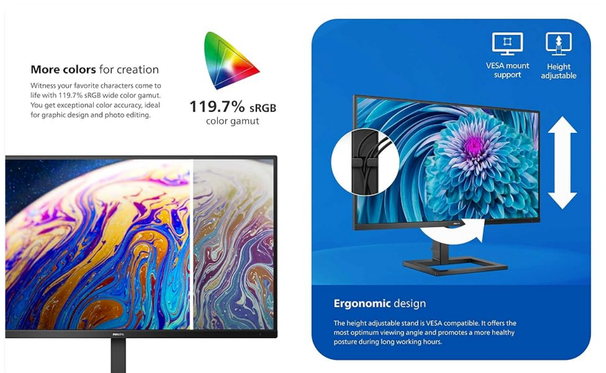
Figure 3: The monitor's wide color gamut and high color accuracy.

Your browser does not support the video tag.