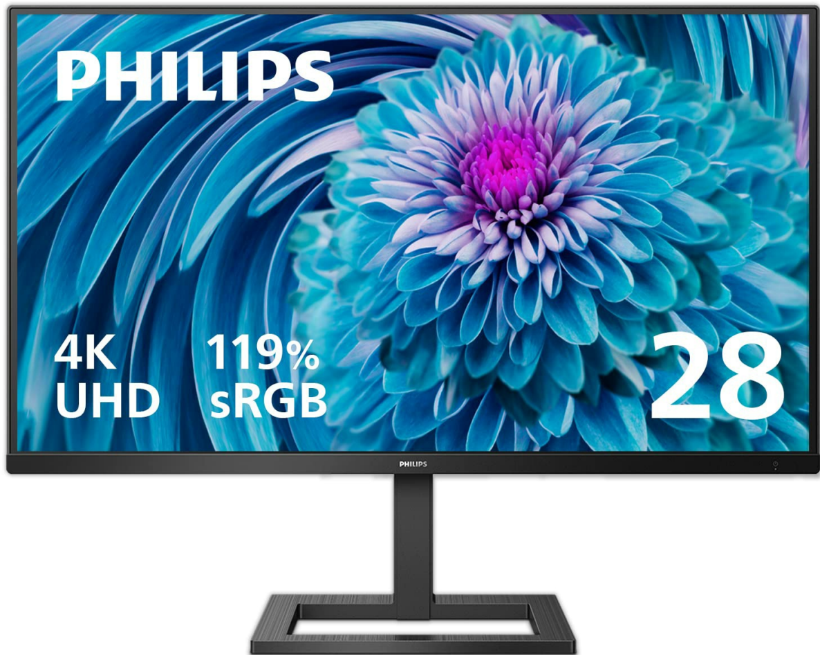
Figure 1: Philips 288E2E 28-inch 4K UHD IPS Monitor.