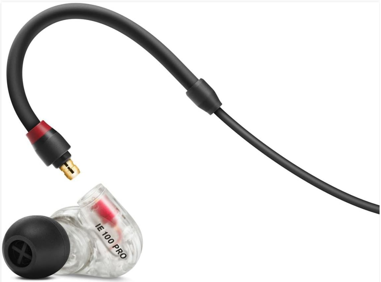
Figure 3: Detachable cable connection point on the earbud.

The IE 100 PRO features a detachable cable for convenience and durability. To attach, align the connector on the cable with the port on the earbud and push gently until it clicks into place. Ensure a secure connection for both earbuds.