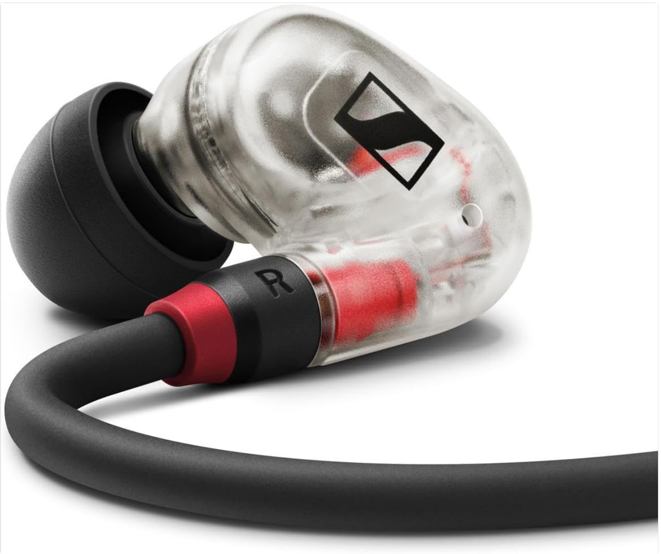
Figure 4: Correct wearing of the IE 100 PRO in-ear monitors.