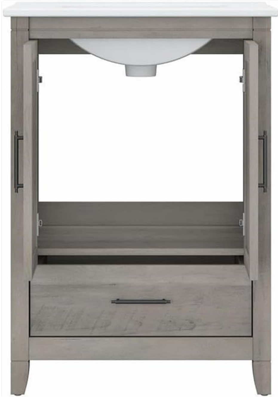
Figure 4: Interior view of the vanity, showing the open cabinet space beneath the sink and the pull-out drawer below. This illustrates the available storage for bathroom essentials.

The vanity features a built-in drawer and a two-door storage cabinet. The cabinet doors are equipped with smooth Euro-style hinges for quiet opening and closing. Use these compartments to store toiletries, cleaning supplies, and other personal care essentials. Ensure items are placed securely to prevent shifting.