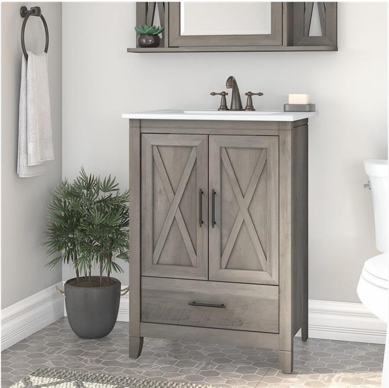
Figure 1: Bush Home Key West 24W Bathroom Vanity with Sink in Driftwood Gray. This image shows the complete vanity unit with its driftwood gray finish, X-pattern cabinet doors, and a lower drawer, topped with a white sink basin.