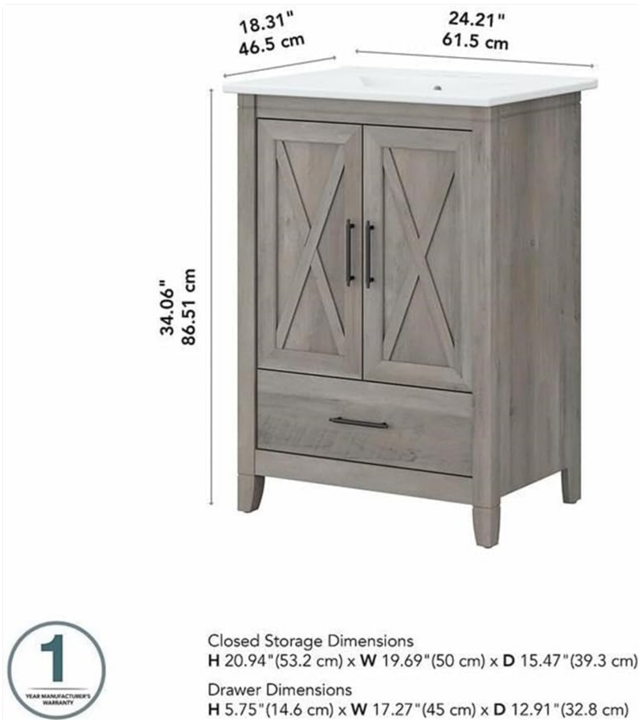
Figure 3: Dimensional overview of the Bush Home Key West 24W Bathroom Vanity. This image provides key measurements for width, depth, and height, essential for planning installation.