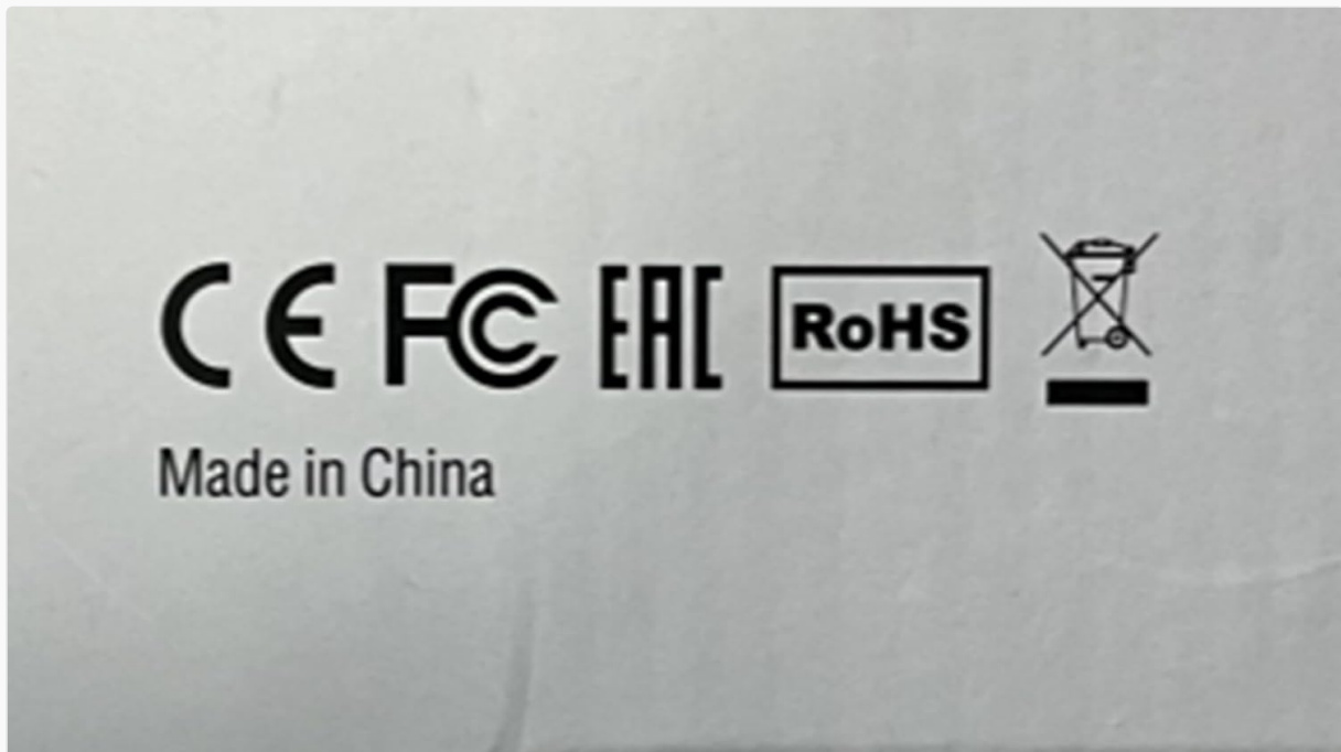
Image: Compliance markings including CE, FC, EAC, RoHS, and 'Made in China', indicating product certifications and origin.