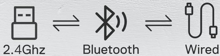
Image: A diagram illustrating the three connection modes: 2.4GHz wireless via USB dongle, Bluetooth, and wired USB-C, with the keyboard shown next to the dongle and cable.