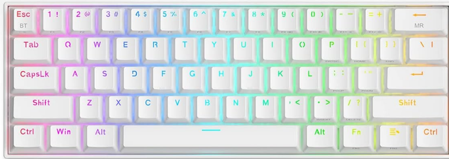
Image: A visual guide to various Fn key combinations for accessing secondary functions like Print Screen, Home, End, Page Up, Page Down, Insert, Delete, and arrow keys.