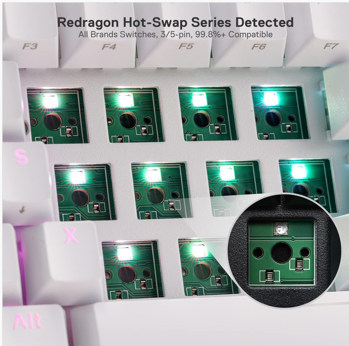
Image: A close-up view of the Redragon K530 Pro's PCB with switches removed, revealing the hot-swappable sockets. An

The K530 Pro features hot-swappable sockets, allowing you to change mechanical switches without soldering.