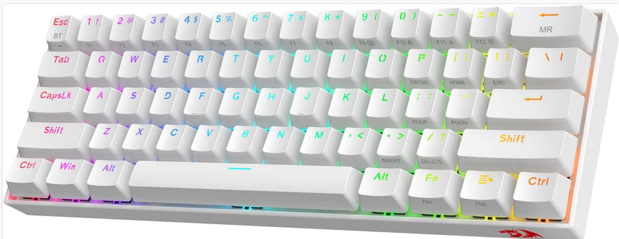
Image: The Redragon K530 Pro Draconic 60% Wireless RGB Mechanical Keyboard in white, showcasing its compact layout and RGB backlighting.

This manual provides detailed instructions for the Redragon K530 Pro Draconic 60% Wireless RGB Mechanical Keyboard. It covers setup, operation, maintenance, and troubleshooting to ensure optimal performance and user experience. Please read this manual thoroughly before using the product.