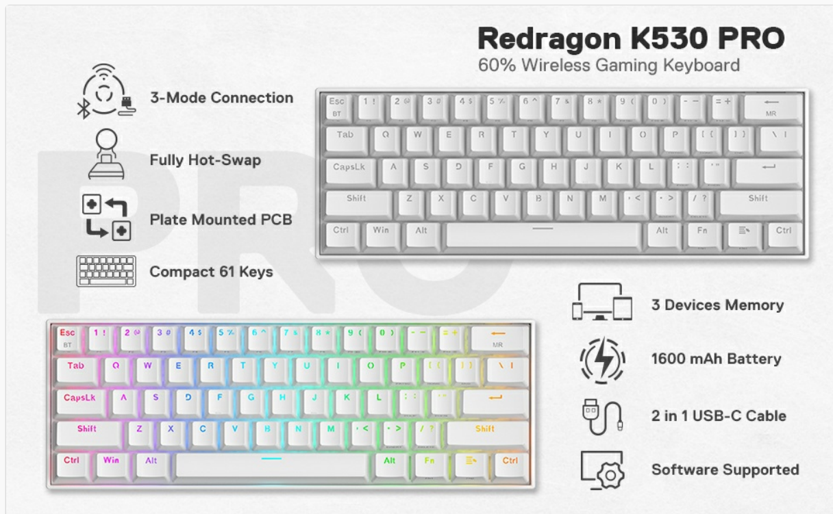
Image: An overview graphic highlighting the Redragon K530 Pro's main features including 3-mode connection, hot-swappable design, compact 61 keys, 1600 mAh battery, USB-C cable, and software support.